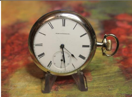
WNS-PW-6105 - Keystone Lancaster, PA Nickeloid Case - 18s -15j - Circa 1890 – Full Front View no2