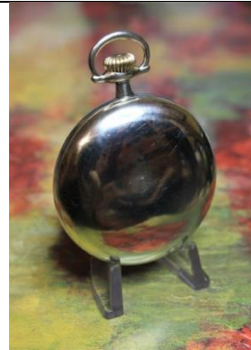
WNS-PW-6105 - Keystone Lancaster, PA Nickeloid Case - 18s -15j - Circa 1890 – Full Back View