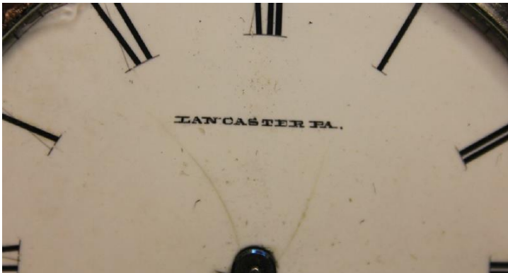
WNS-PW-6105 - Keystone Lancaster, PA Nickeloid Case - 18s -15j - Circa 1890 – Dial Close Up View