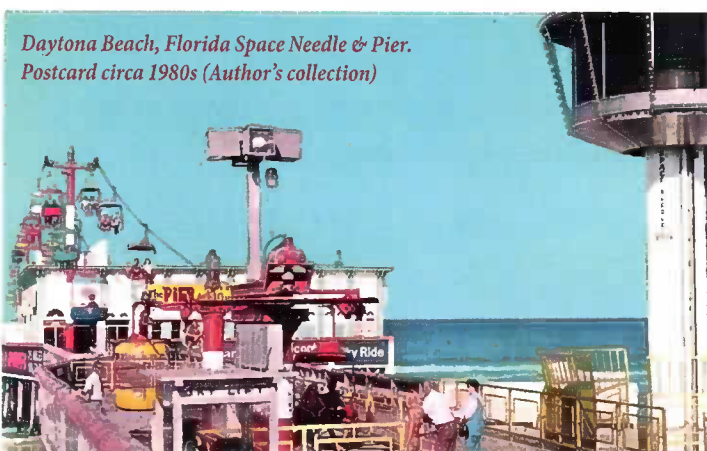
Daytona Beach, Florida Space Needle & Pier. Postcard circa 1980s