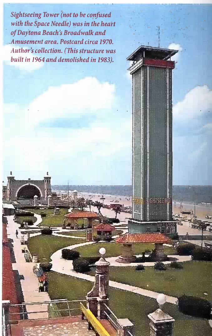
Sightseeing Tower (not to be confused with the Space Needle) was in the heart of Daytona Beach's Broadwalk and Amusement area. Postcard circa 1970. (This structure was built in 1964 and demolished in 1983).