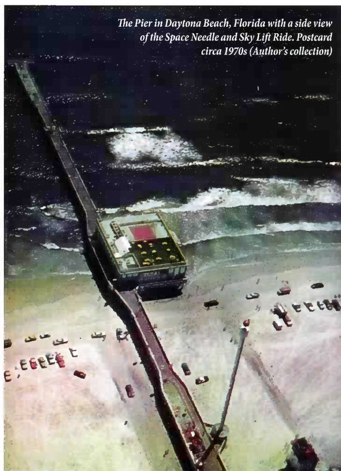
The Pier in Daytona Beach, Florida with a side view of the Space Needle and Sky Lift Ride. Postcard circa 1970s