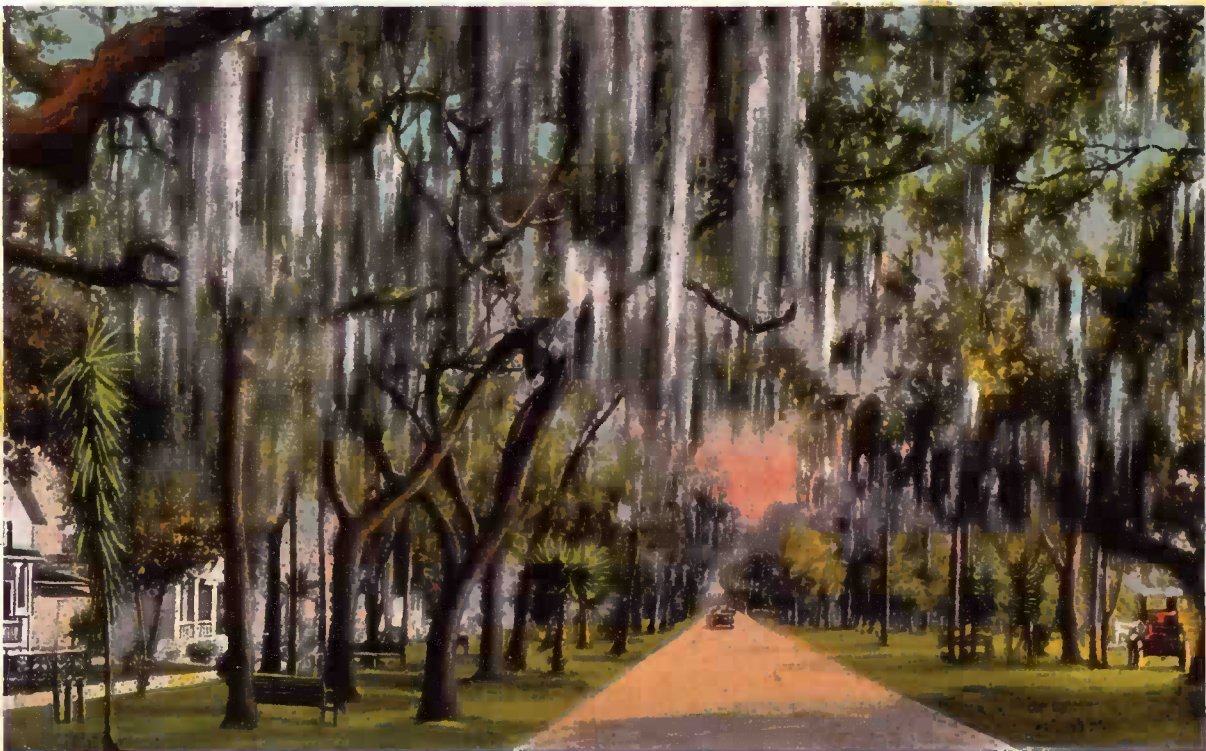
RIDGEWOOD AVENUE, DAYTONA, FLA.

A Journal of the Halifax Historical Society Daytona Beach, Florida