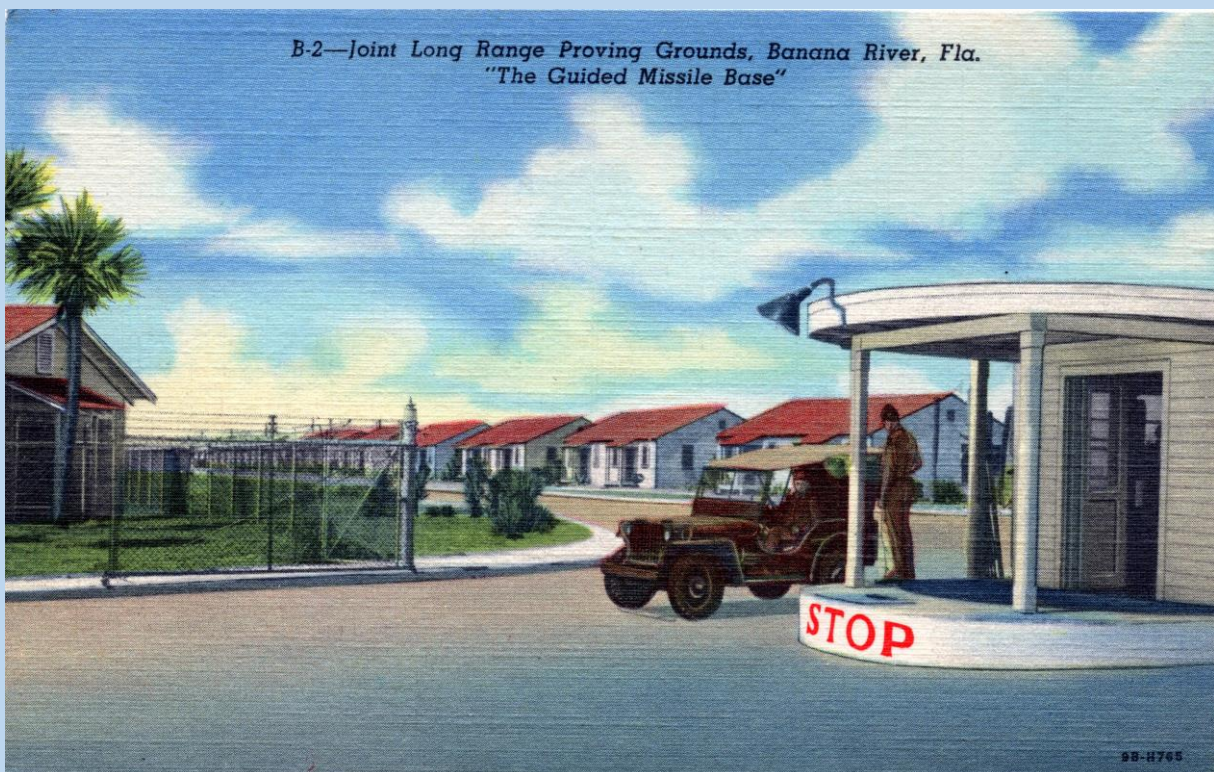
Joint Long Range Proving Grounds, Banana River, Fla. (The Guided Missile Base) - ca. 1940s