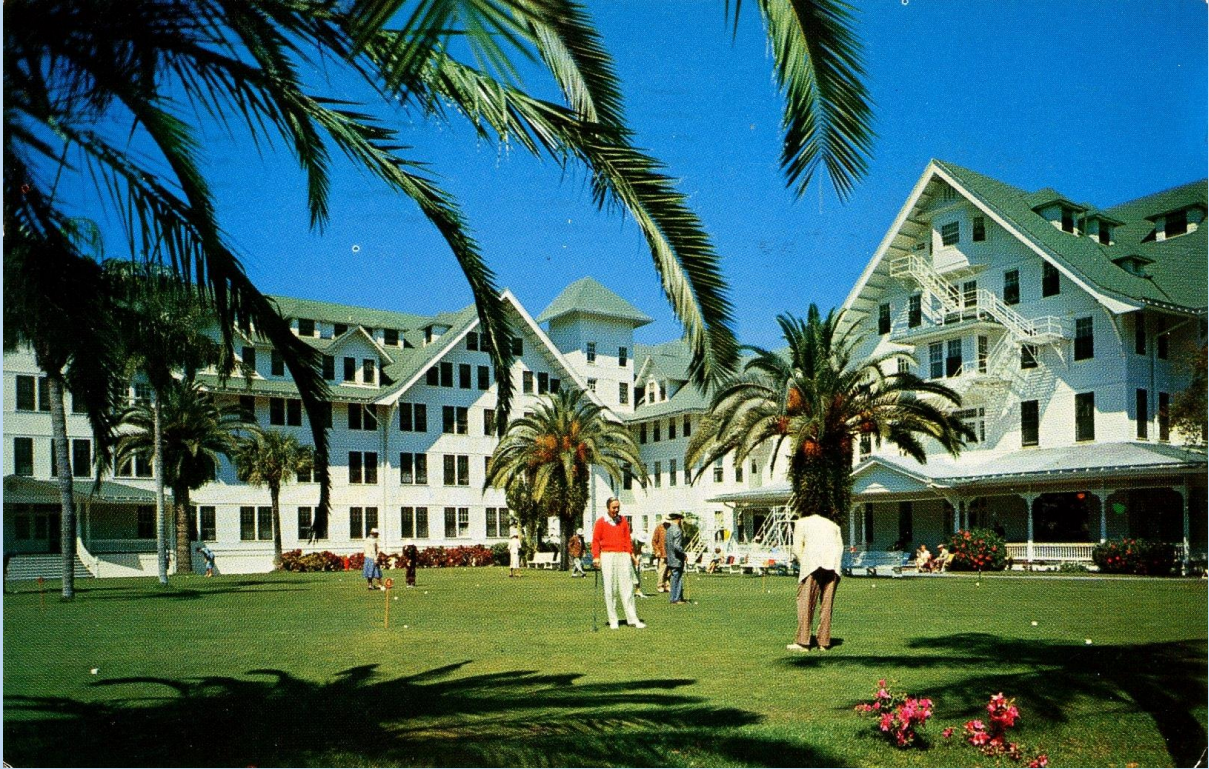
Bellview Biltmore Hotel - Belleair, Fla. - ca. 1957.