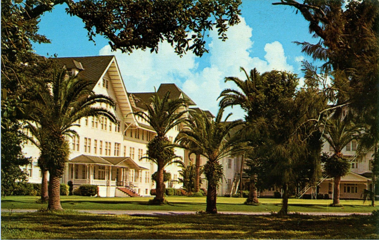
The Bellevue Biltmore is the world's largest wooden structure - Belleair, Fla. - ca. 1960s.