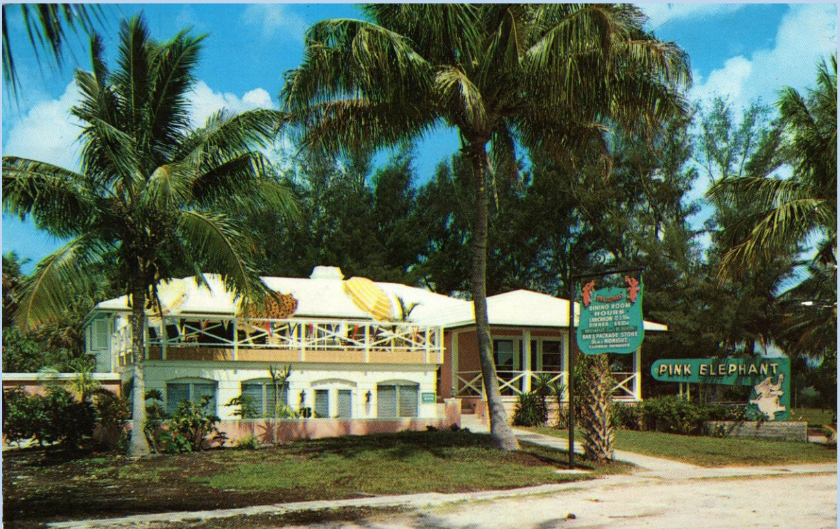
The Pink Elephant at Boca Grande, Fla. - ca. 1964