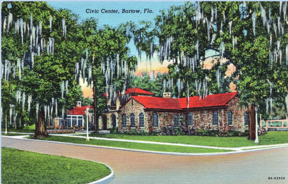
Civic Center, Bartow, Fla. - ca. 1940s