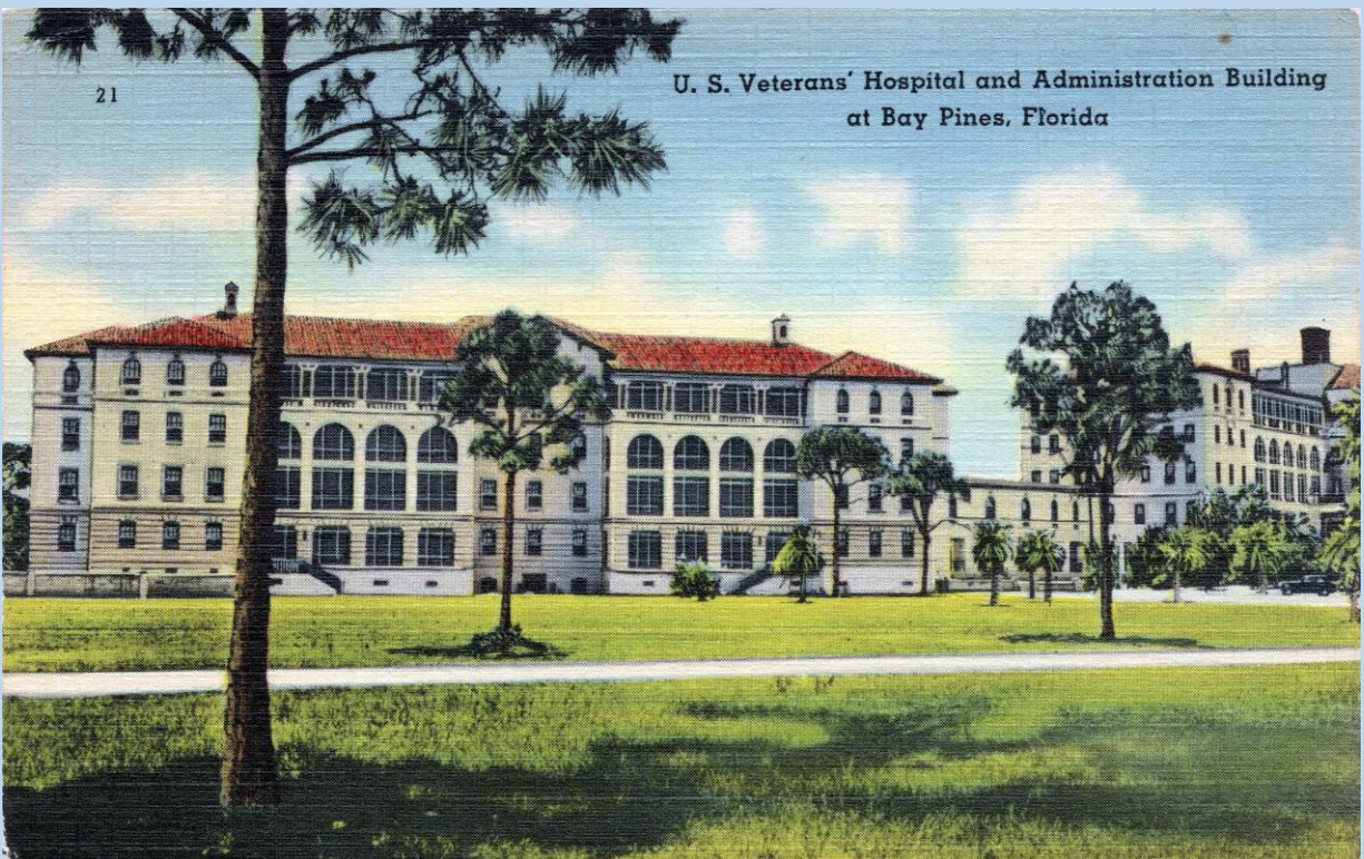
U.S. Veterans' Hospital and Administration Building at Bay Pines, Florida - ca. 1957