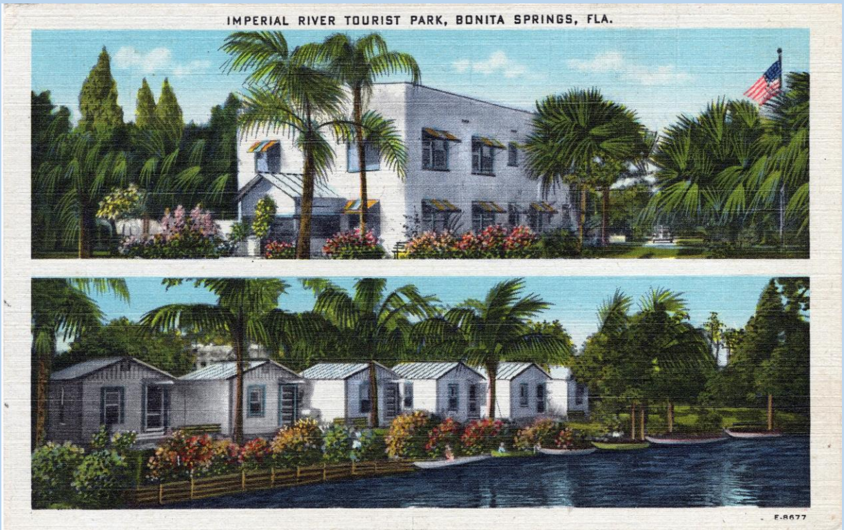
Imperial River Tourist Park, Bonita Springs, Fla. - 1945