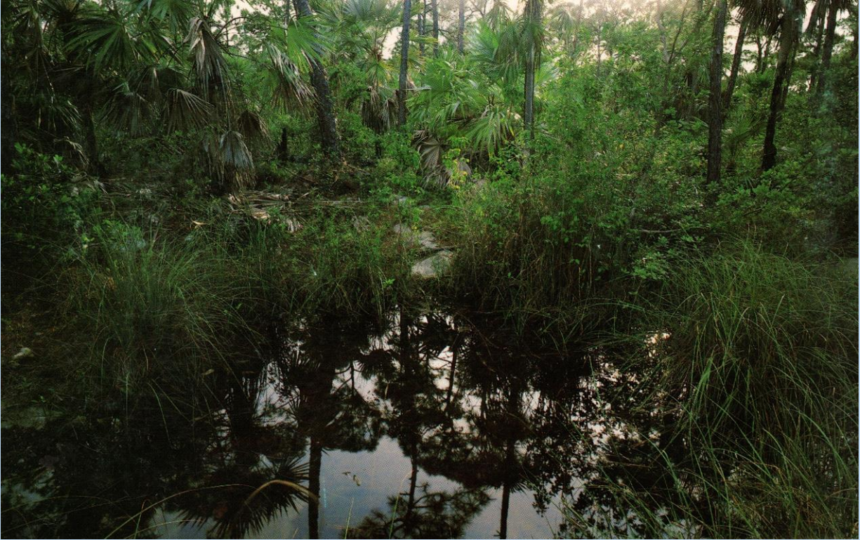
Threatened Key Deer Habitat, Big Pines Key, Florida - ca. 1980s