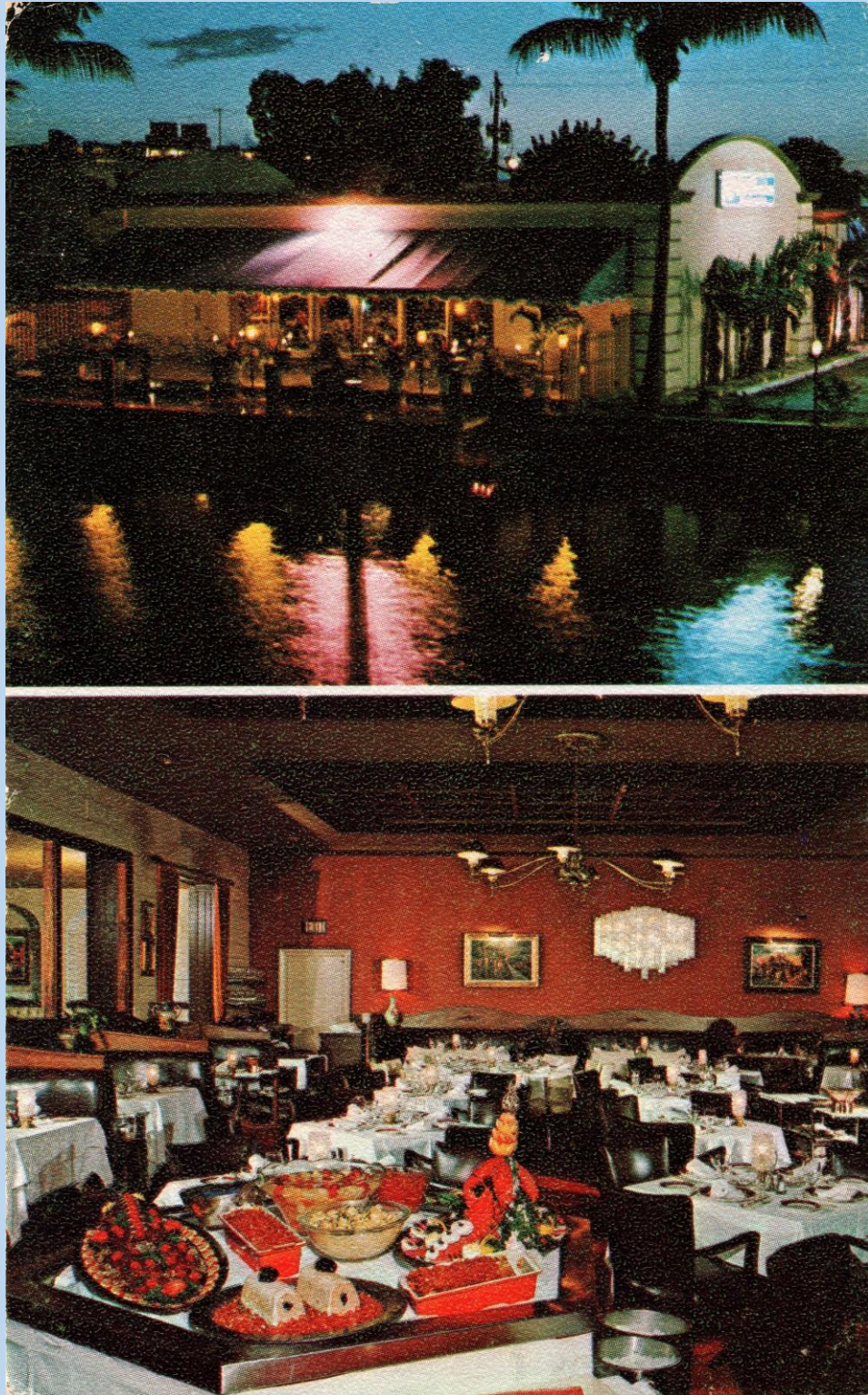
Cafe Chauveron, Bay Harbor Island, Fla. - ca. 1977