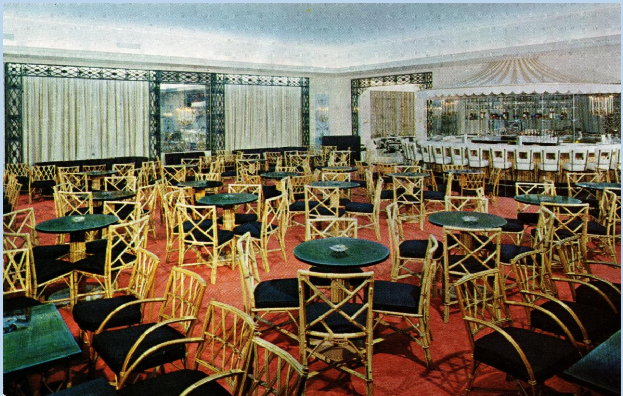
The Beautiful New Candlelight Room, The Bellevue - Biltmore, Belleair, Florida - ca. 1970s