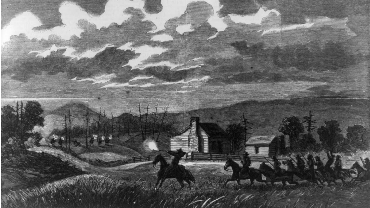
A wood engraving of an 1864 engagement between Union and Confederate troops at Snake Creek Gap in Georgia.

Those omissions point up another feature of history twisted to fit parochial politics and racial prejudice. For one thing, the 1st Alabama was one of the few integrated units in the Union Army: the regiment of 2,066 recruits included 16 freed enslaved people. The shortchanging of its accomplishments also cast a shadow over important events and colorful characters who deserved attention in mainstream histories. My most surprising discovery was that the 1st Alabama led the Union charge that could have prevented the burning of Atlanta. At Snake Creek Gap in North Georgia on May 9, 1864, they had a chance to rout Confederate Gen. Joseph Johnson's entire army by charging into its rear. Their attack was called off when one of Sherman's favorite generals arrived on the scene. In his " Memoirs ," Sherman admitted that his subordinate had cost the Union Army an opportunity that "does not occur twice in a lifetime."