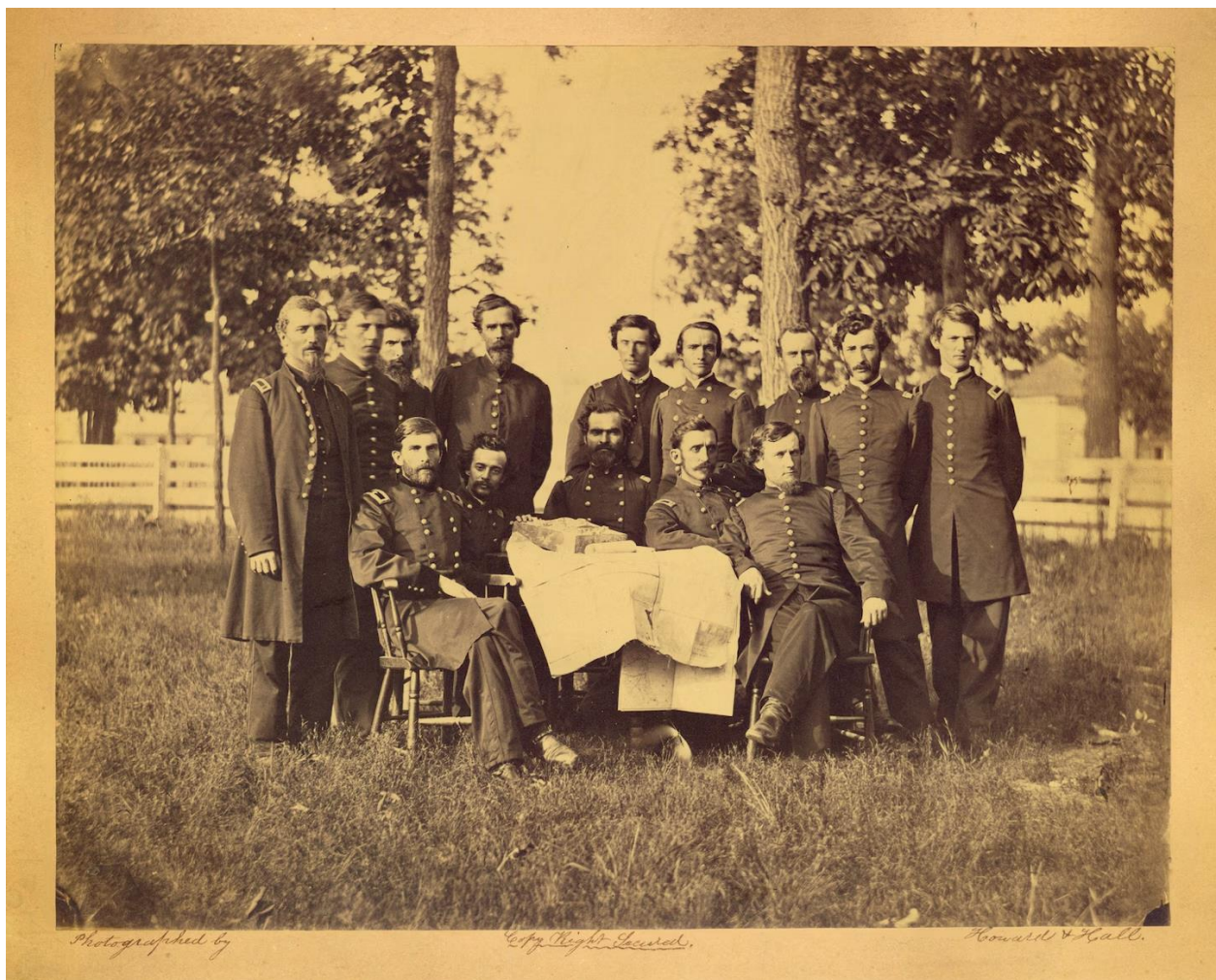
Alabama farmers who volunteered for the First Alabama Union Cavalry were shaped by its commanders at Corinth, Miss., in 1862.