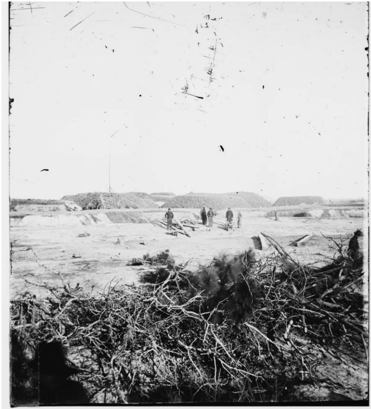
Fort McAllister near Savannah, Ga., in December 1864.