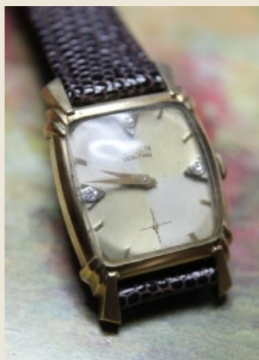
WNS-MCTY-3033 - Gruen - Quad Dial and Diamonds - Full Left Front View