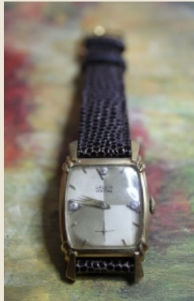
WNS-MCTY-3033 - Gruen - Quad Dial and Diamonds - Full Front View