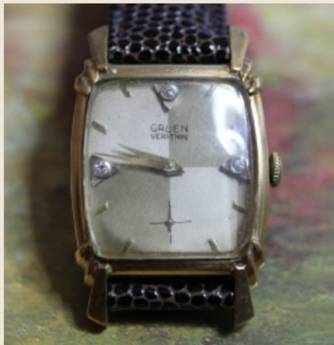
WNS-MCTY-3033 - Gruen - Quad Dial and Diamonds - Dial Close Up View