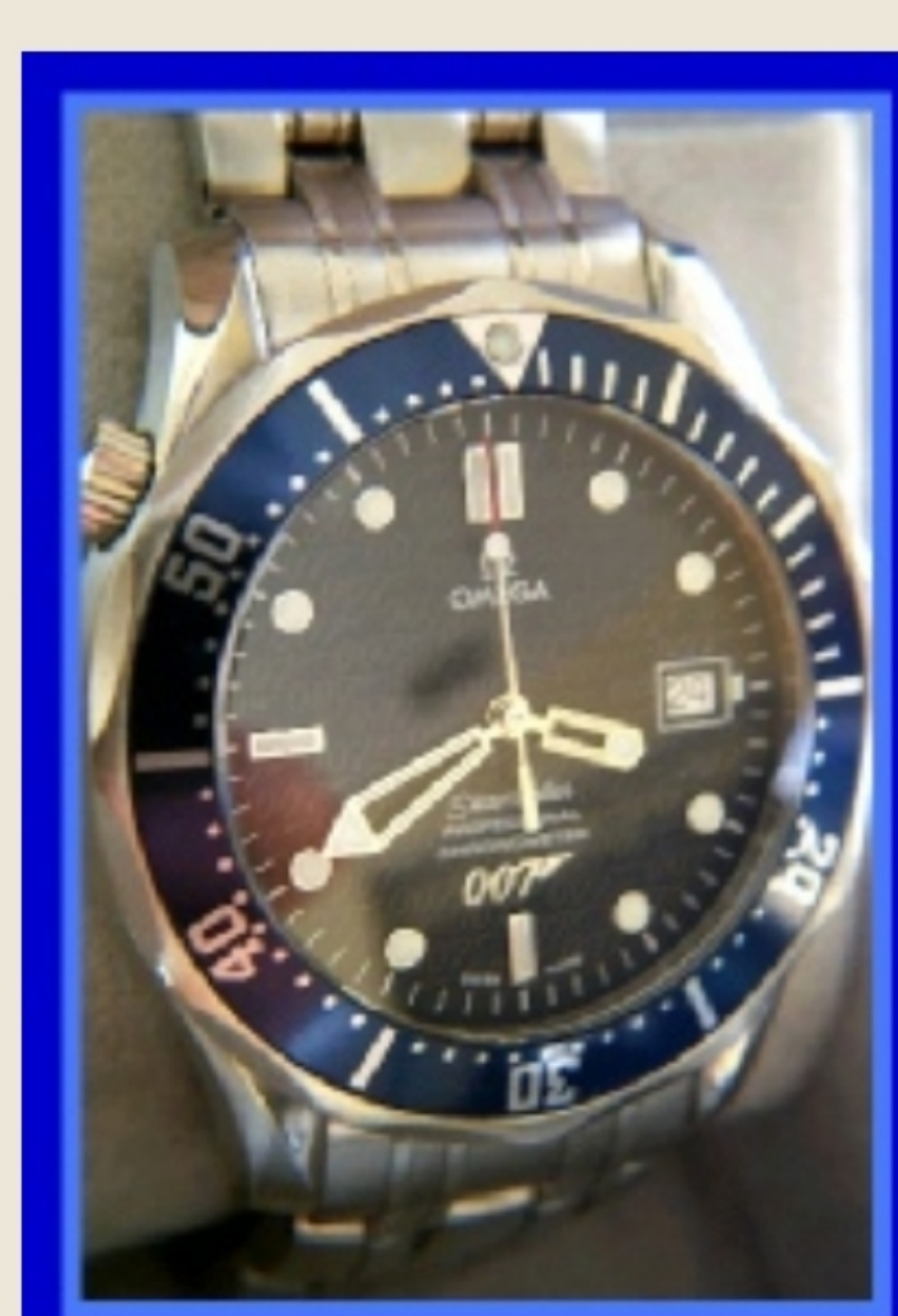
WNS-MDN-5032 - Omega 007 Limited Edition - Full Left Front View