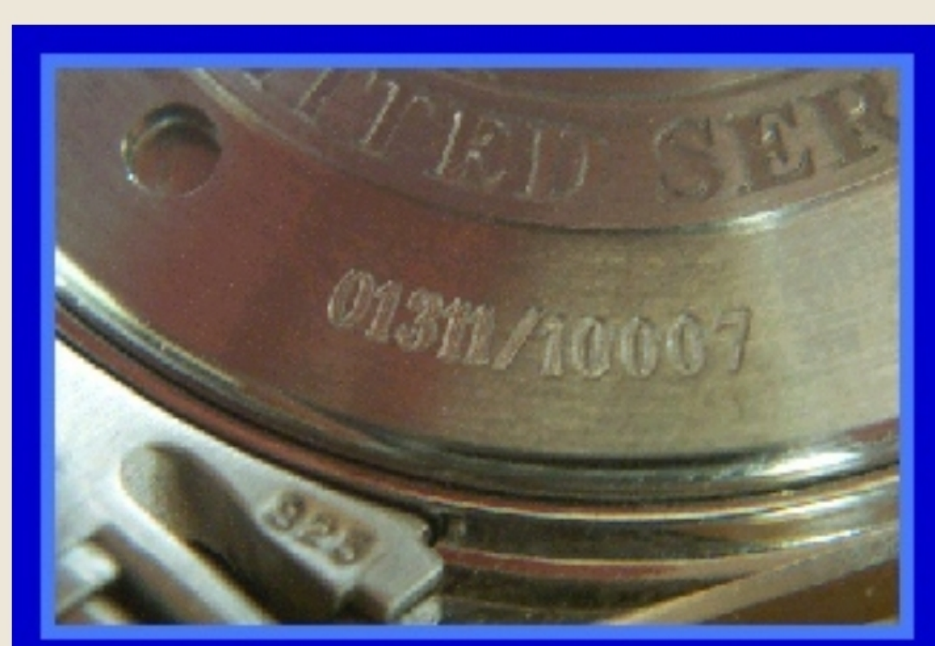
WNS-MDN-5032 - Omega 007 Limited Edition - Edition Number View