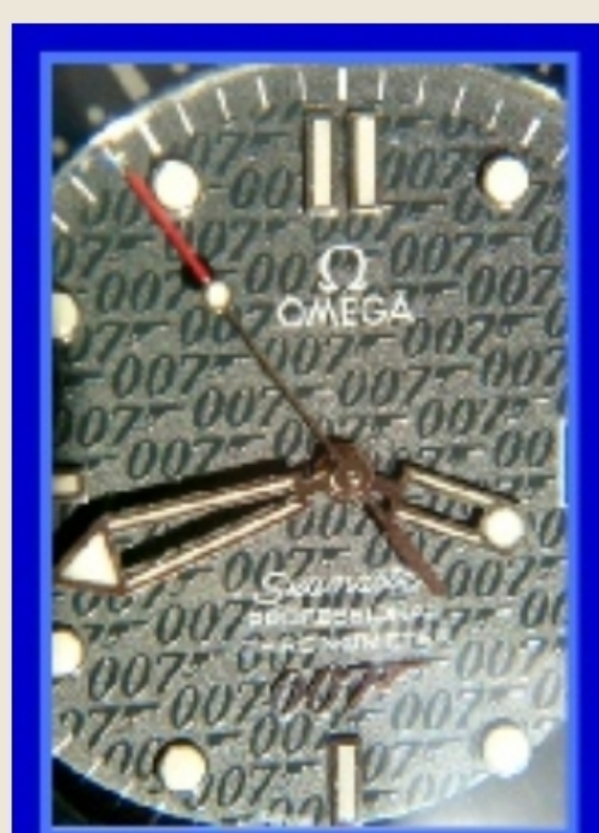
WNS-MDN-5032 - Omega 007 Limited Edition - Central Dial Close Up View