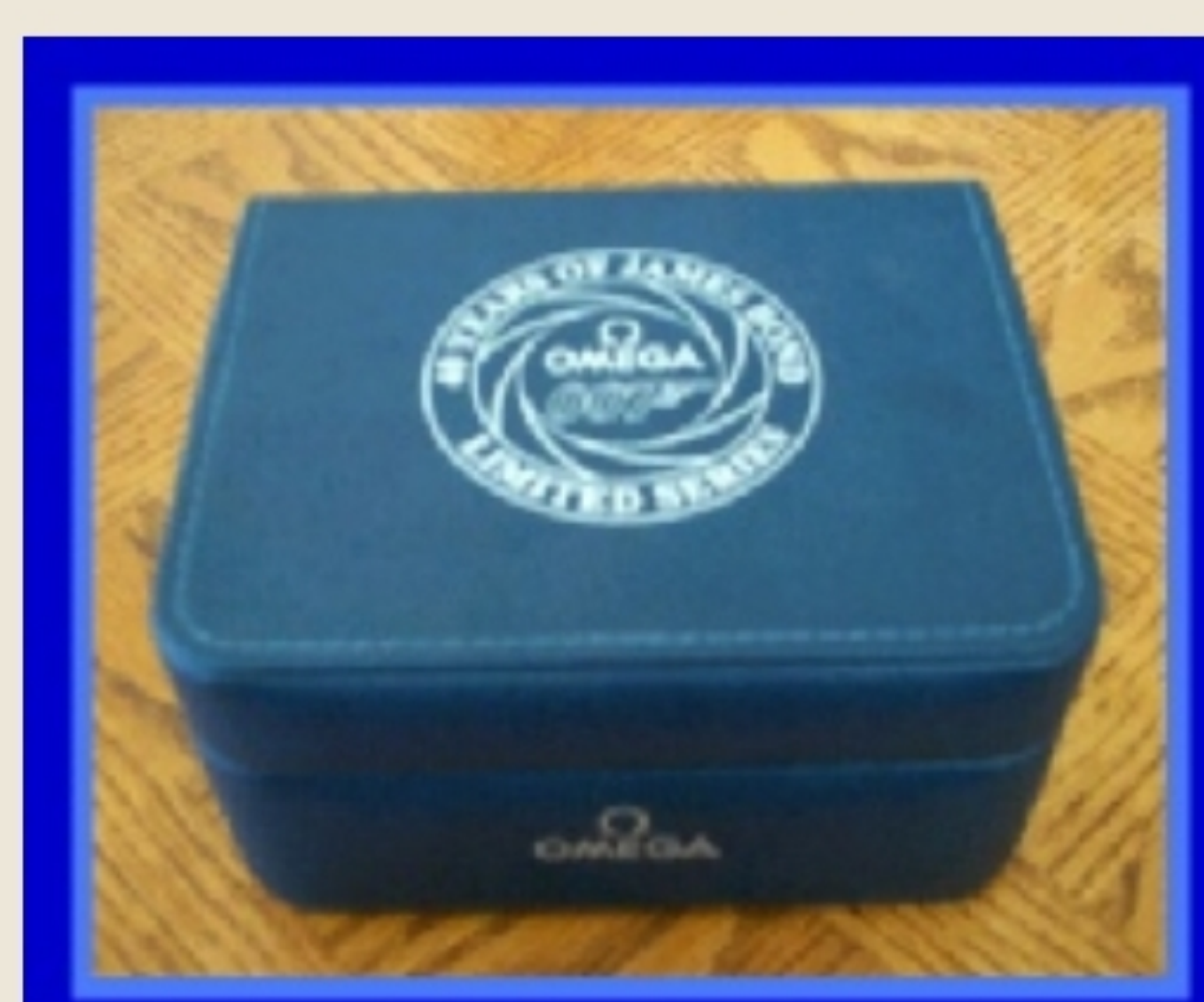
WNS-MDN-5032 - Omega 007 Limited Edition - Outer Box View