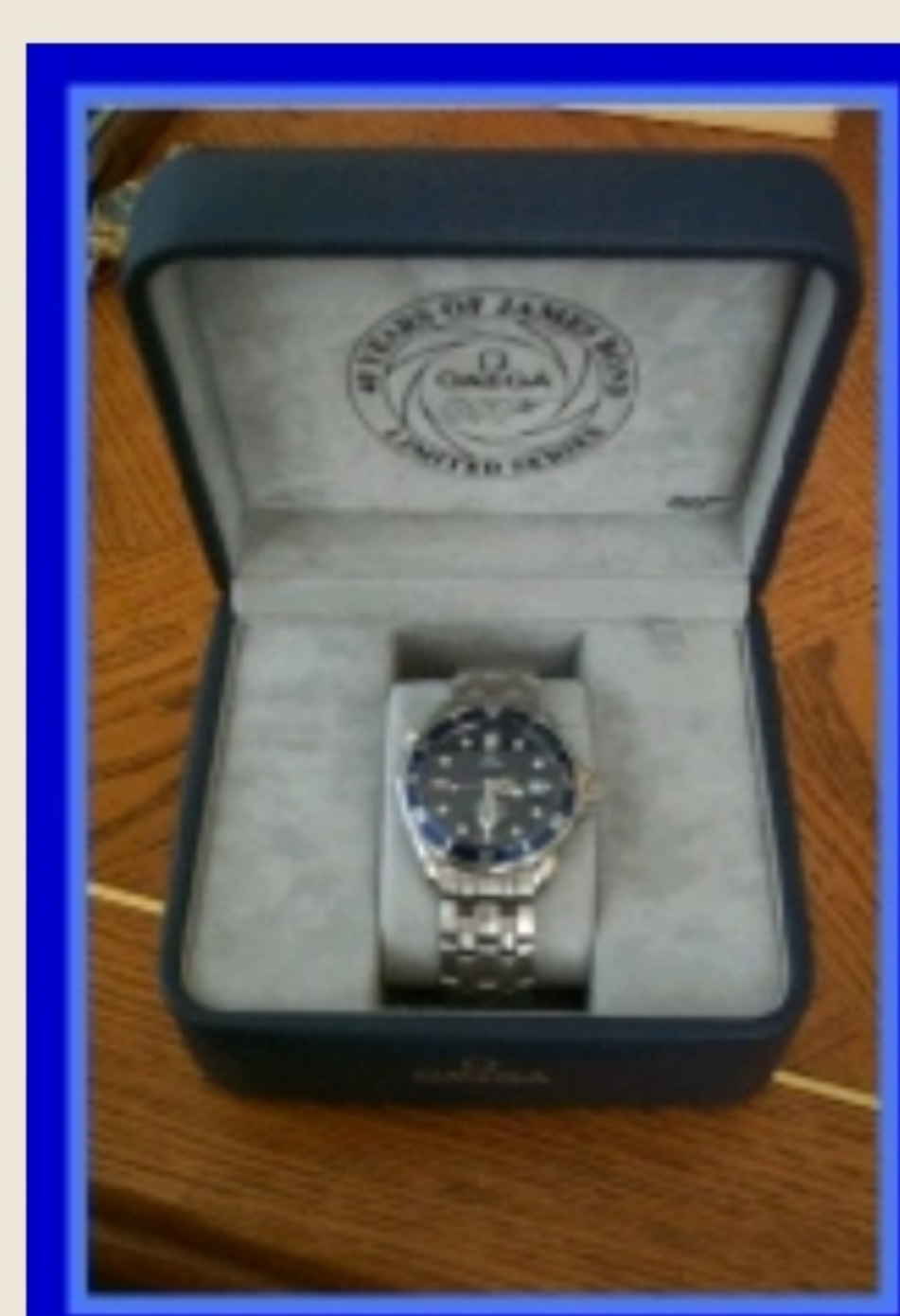
WNS-MDN-5032 - Omega 007 Limited Edition - Watch in Box View