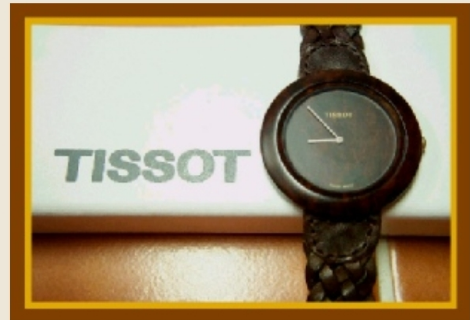
WNS-MDN-5012 - Tissot - Burly Walnut Wood Watch - Full Front View on Box

Case: Round solid Burly Walnut Wood with a stainless steel back - 38 mm wide - 40 mm including the crown and 6 mm thick. Crown at the 3 o'clock position. Plastic mineral crystal.