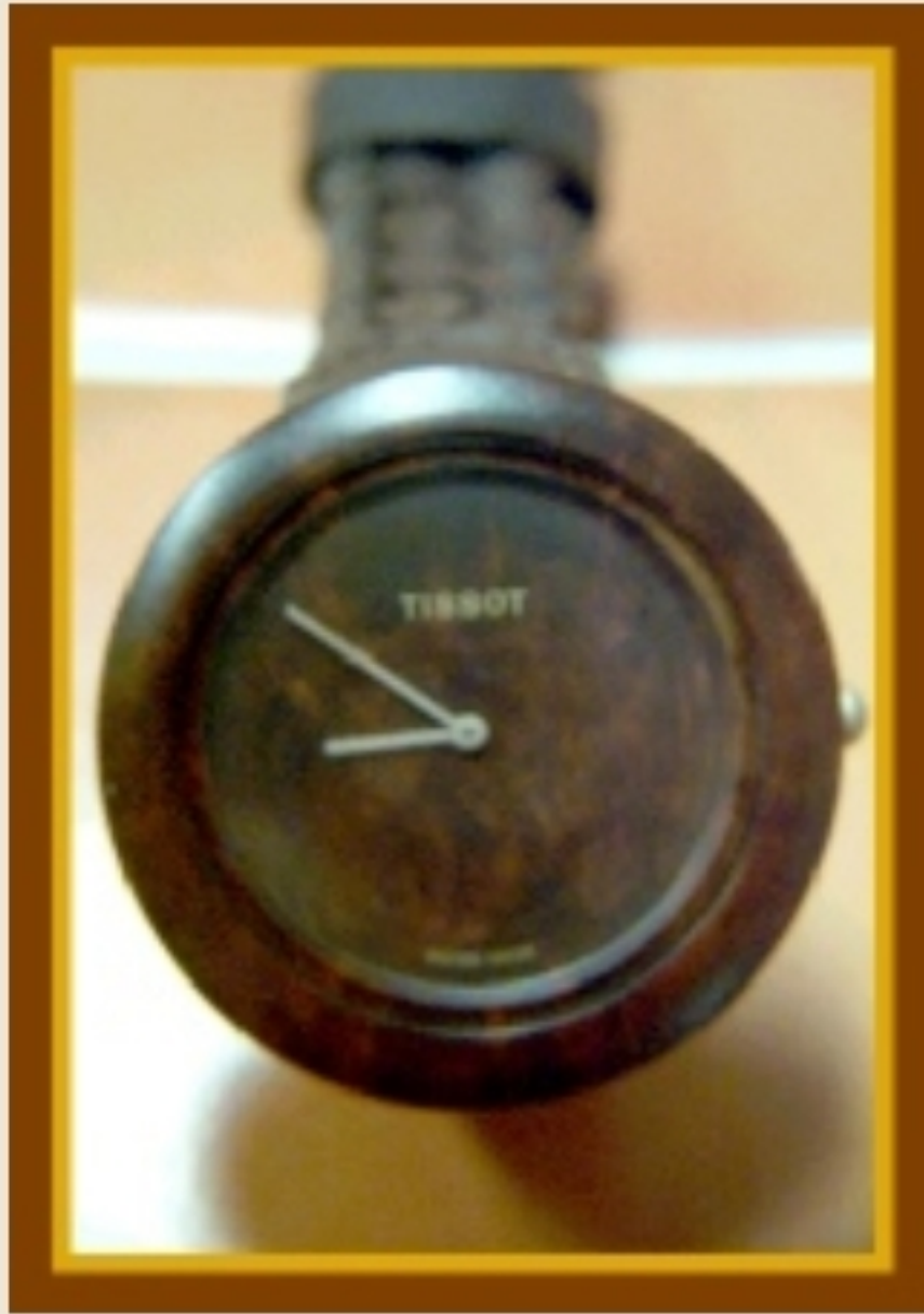
WNS-MDN-5012 - Tissot - Burly Walnut Wood Watch - Full Front View