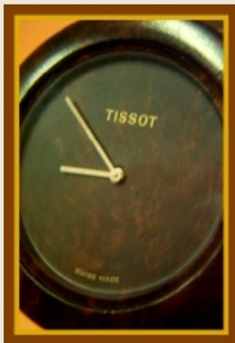
WNS-MDN-5012 - Tissot - Burly Walnut Wood Watch - Dial Close Up View