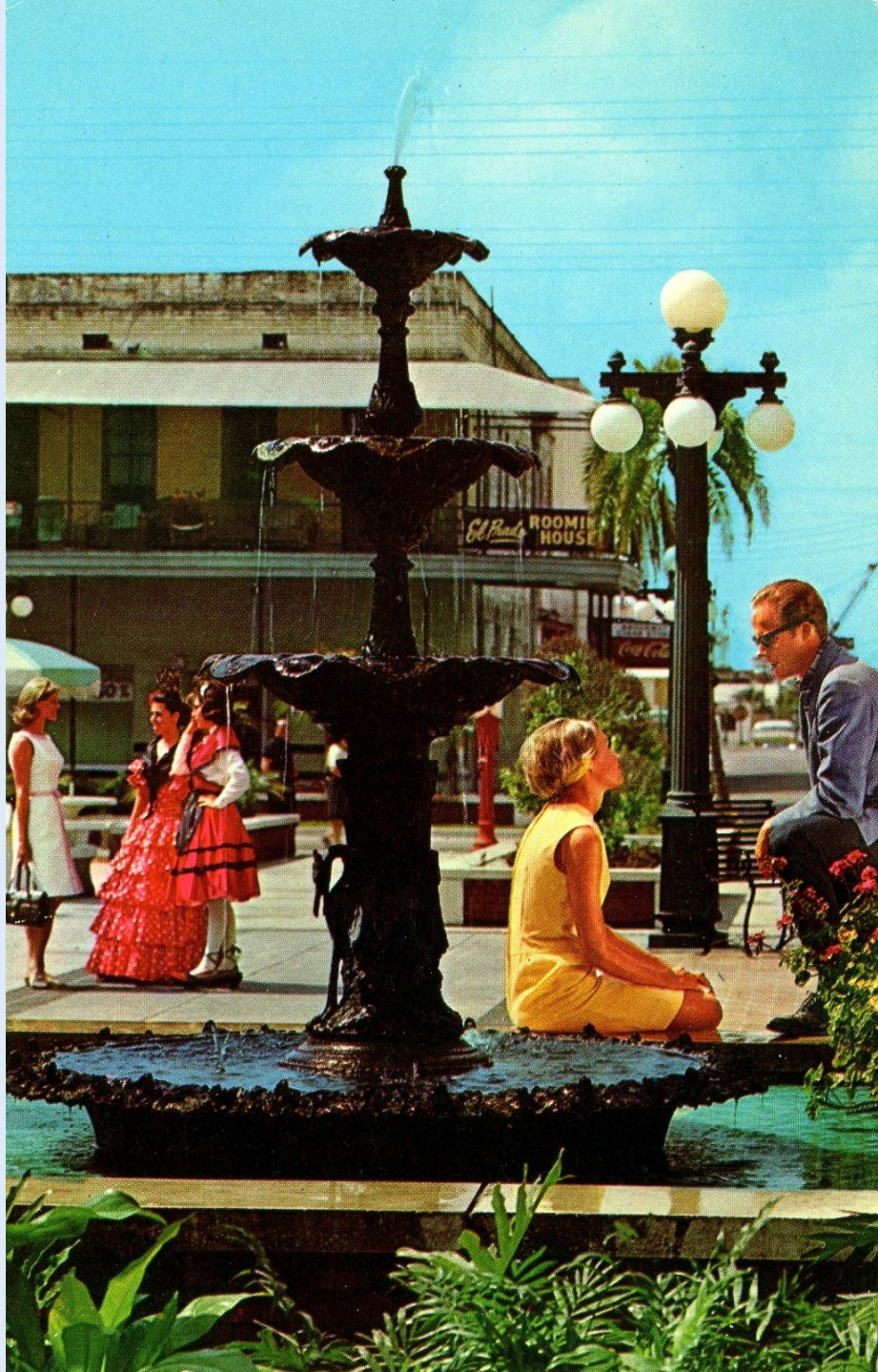
Water Splashes Musically in the Ornate Fountains - Ybor City, Fla. - ca. 1970s