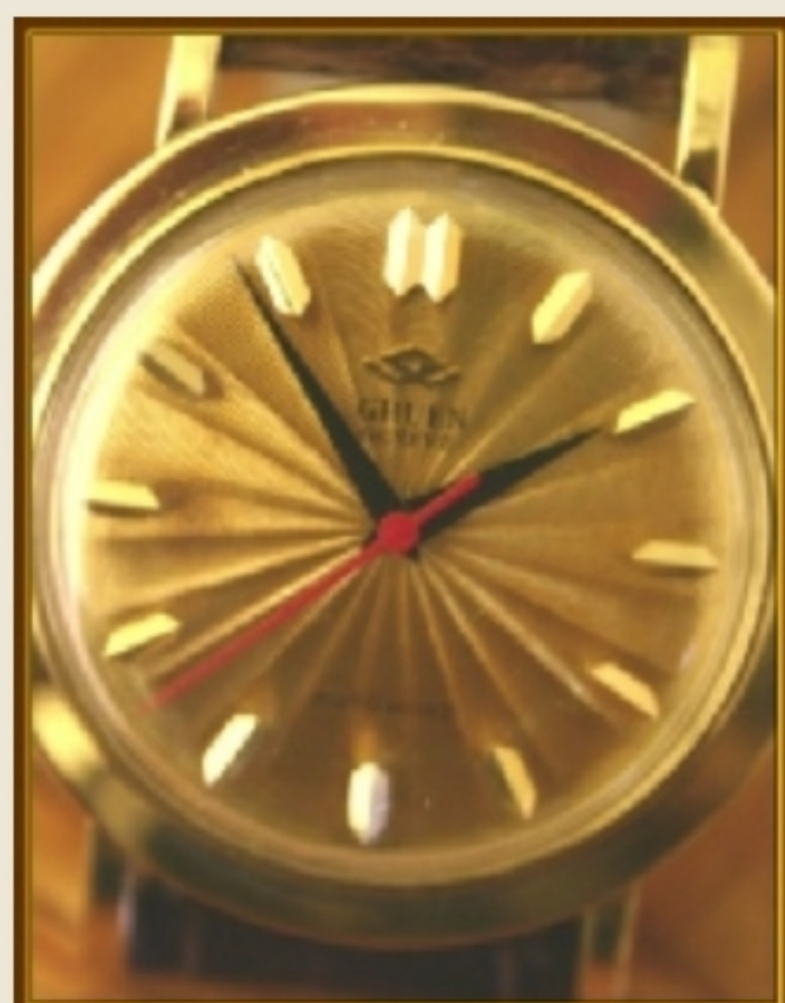
WNS-MCTY-3042 - Gruen - 18K Solid Gold Case and Sunray Dial - Case Close Up View