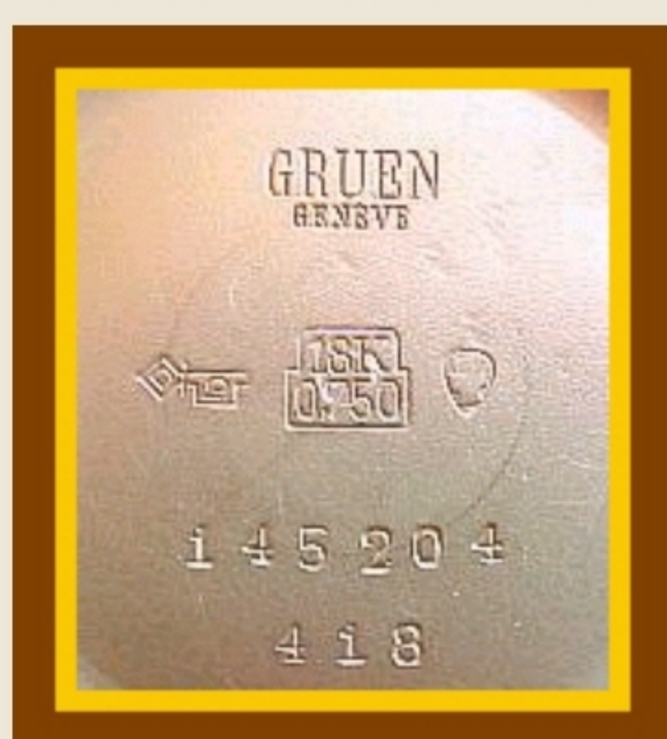
WNS-MCTY-3042 - Gruen - 18K Solid Gold Case and Sunray Dial - Case Markings View