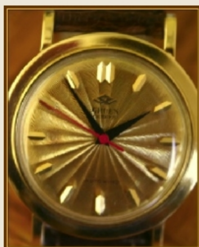
WNS-MCTY-3042 - Gruen - 18K Solid Gold Case and Sunray Dial - Full Front View