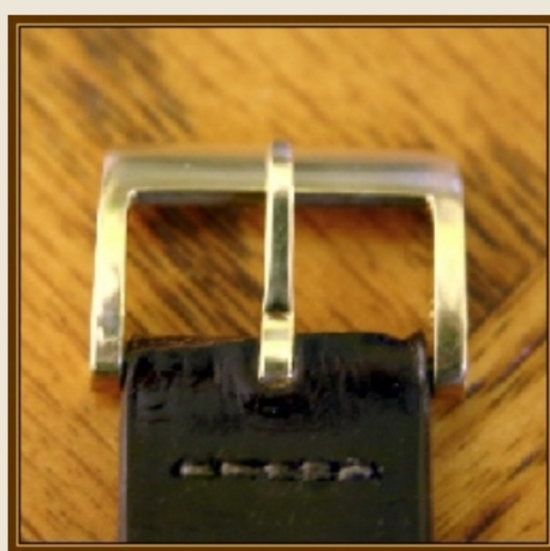
WNS-MCTY-3042 - Gruen - 18K Solid Gold Case and Sunray Dial - 18K Buckle View