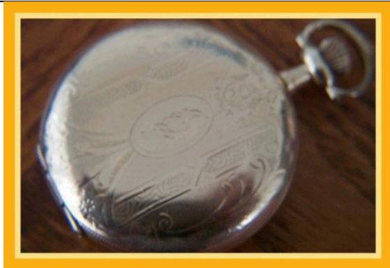
WNS-PW-6028 - Elgin_PW_1896_Great_Dial - Outer_Case_Front_View