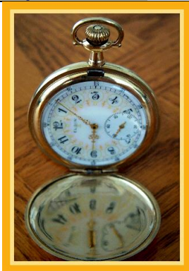
WNS-PW-6028 - Elgin_PW_1896_Great_Dial - Front_Open_View