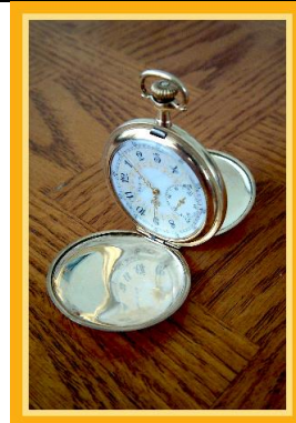
WNS-PW-6028 - Elgin_PW_1896_Great_Dial - Open_Case_View