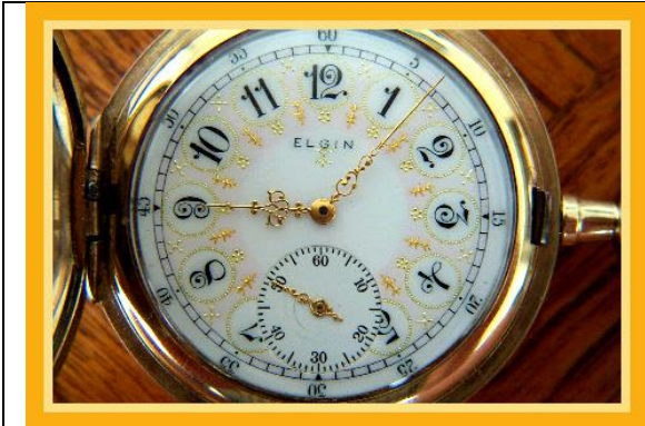
WNS-PW-6028 - Elgin_PW_1896_Great_Dial - Dial_Close_Up_View_No_3