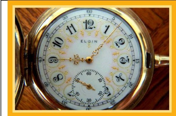
WNS-PW-6028 - Elgin_PW_1896_Great_Dial - Dial_Close_Up_View_No_4