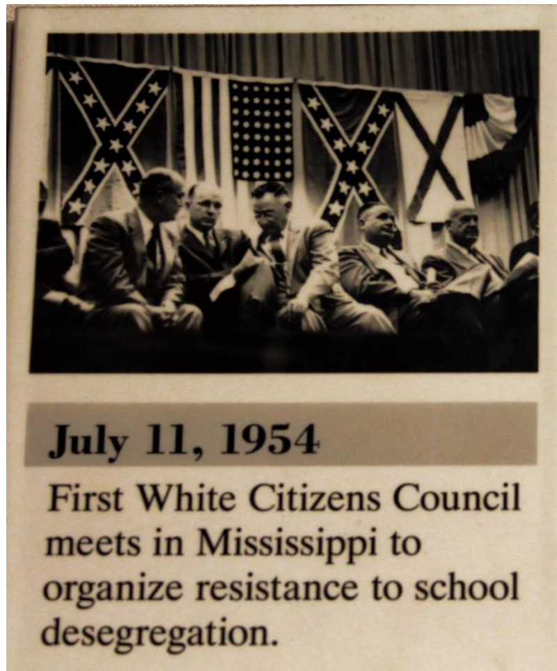
Fig. 15.1. First White Citizens' Council meets in Mississippi on July 11, 1954 to organize resistance to school desegregation.