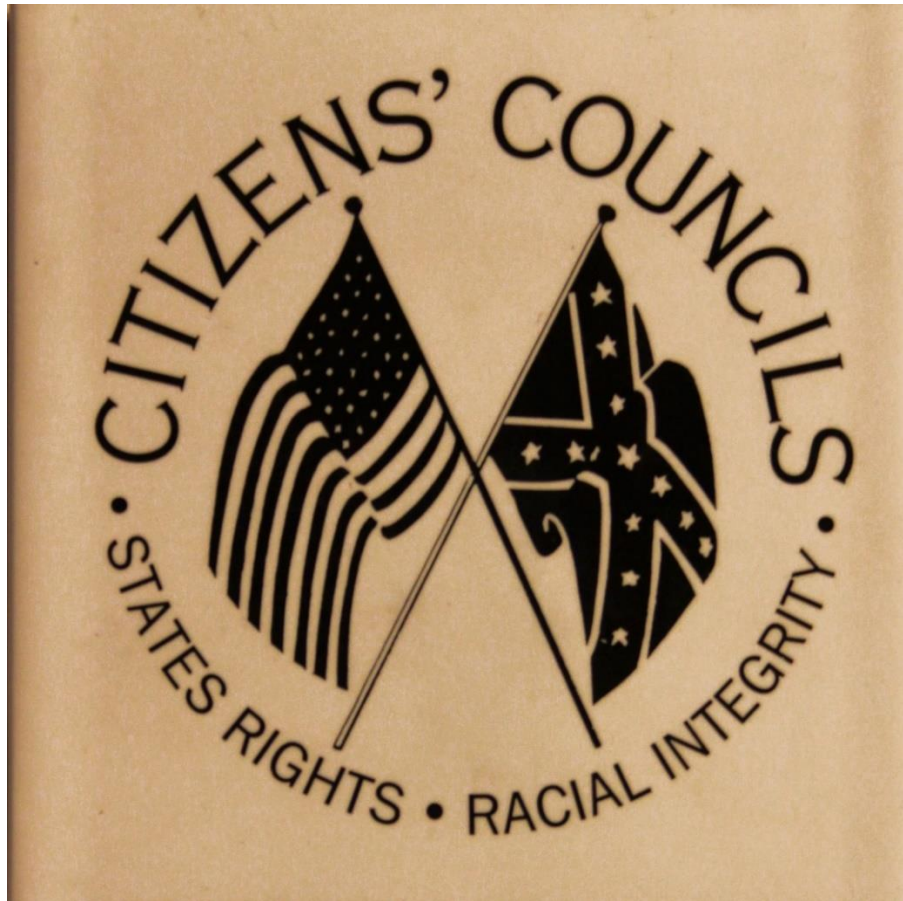
Fig. 15.2. Citizens' Council insignia – States' Rights – Racial Integrity. Source: Exhibit at the Birmingham Civil Rights Institute in Birmingham, Alabama. Photograph by Author (February 2019).