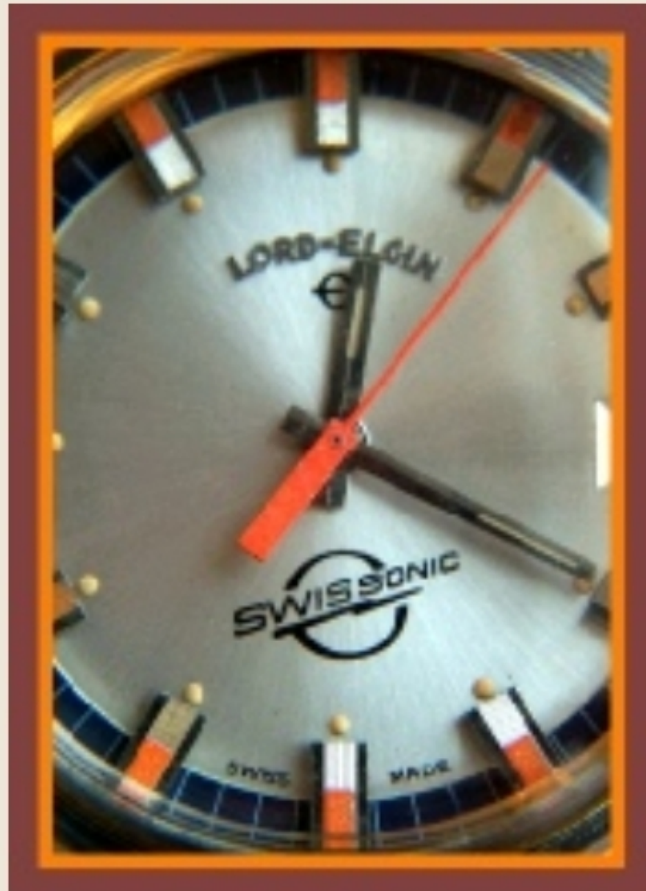
WNS-6070-4062 - Lord Elgin - Swissonic - Orange-Silver Dial - Dial Close Up View no 2