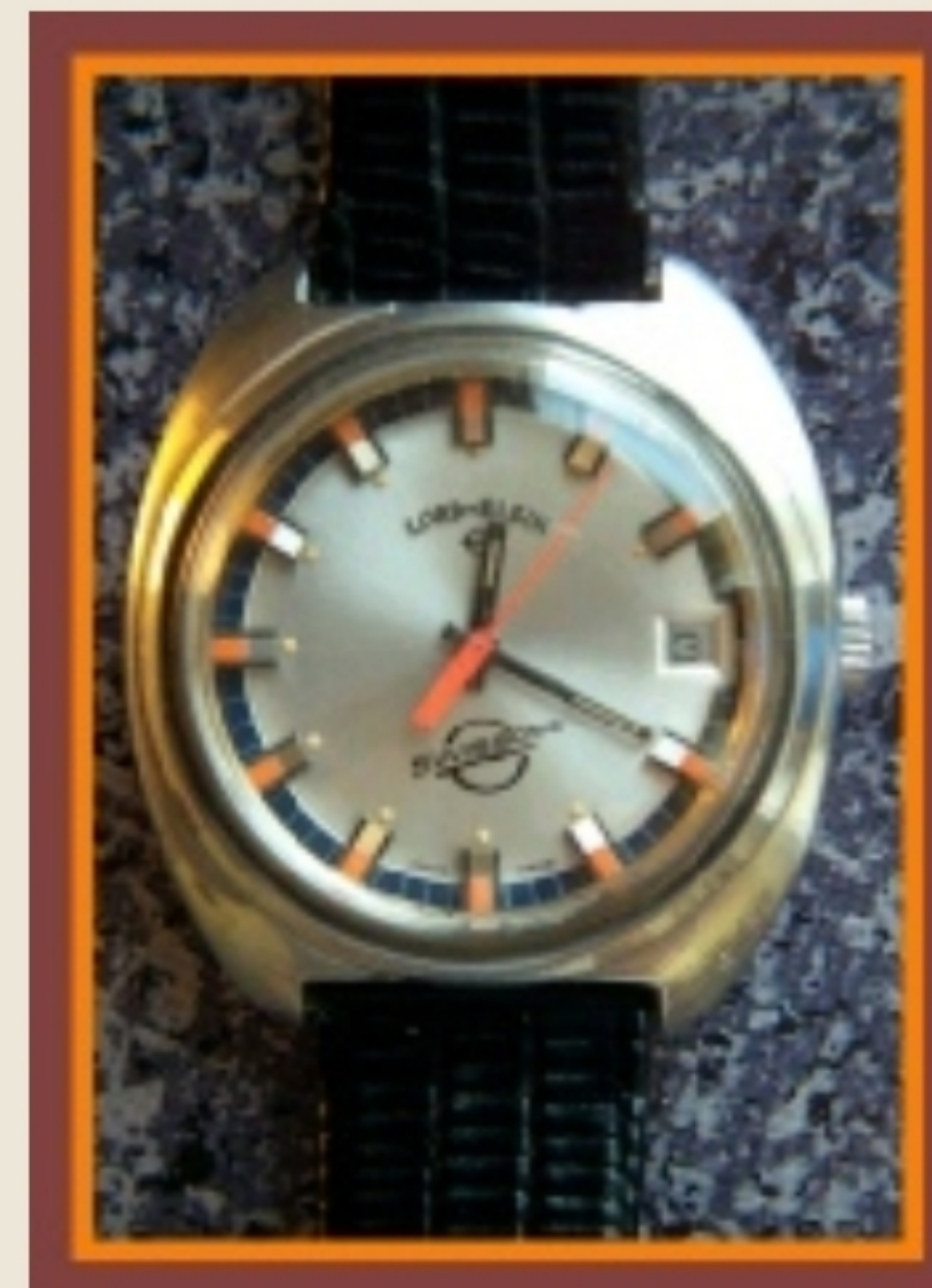
WNS-6070-4062 - Lord Elgin - Swissonic - Orange-Silver Dial - Full Front View