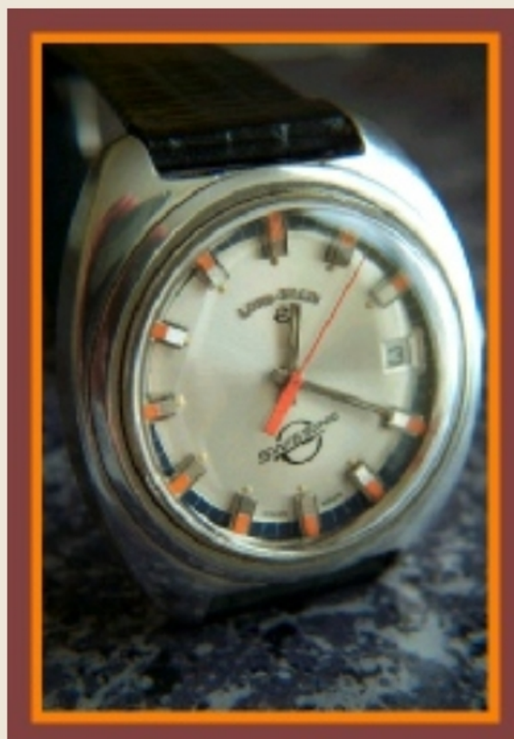
WNS-6070-4062 - Lord Elgin - Swissonic - Orange-Silver Dial - Full Left Front View