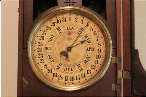
WNS-CLK-181 - Jerome & Co. - 2 Dial Calendar - Bottom Dial Close Up View