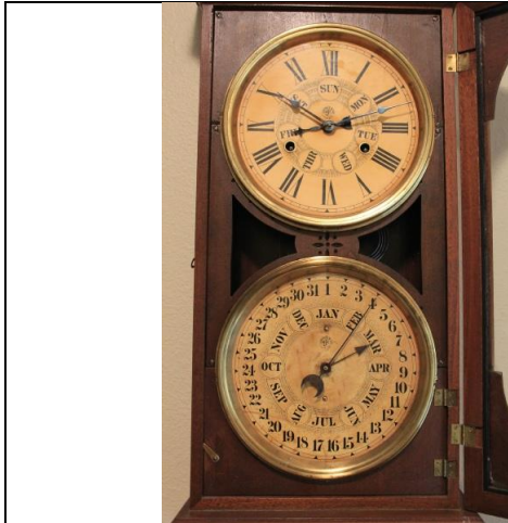
WNS-CLK-181 - Jerome & Co. - 2 Dial Calendar - 2 Dials Close Up View