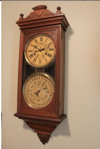
WNS-CLK-181 - Jerome & Co. - 2 Dial Calendar - Right Front View