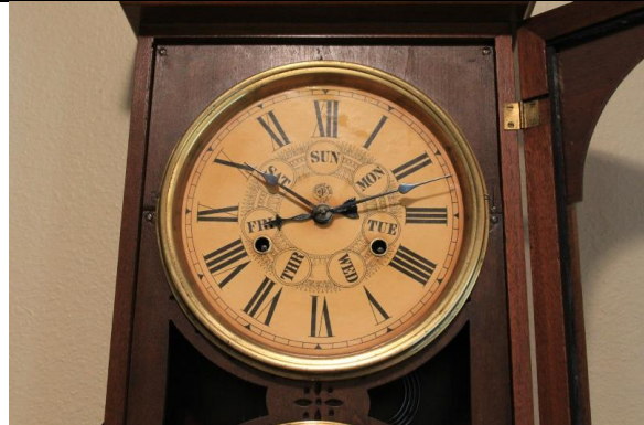
WNS-CLK-181 - Jerome & Co. - 2 Dial Calendar - Top Dial Close Up View