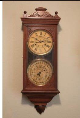
WNS-CLK-181 - Jerome & Co. - 2 Dial Calendar - Right Front View