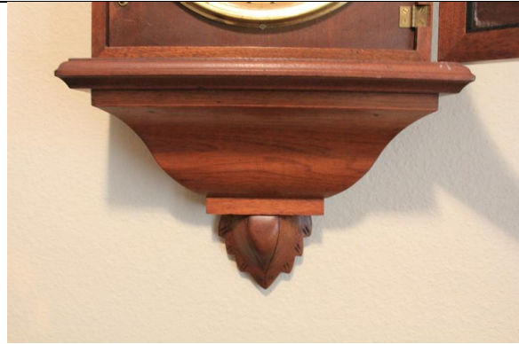
WNS-CLK-181 - Jerome & Co. - 2 Dial Calendar - Bottom Case View