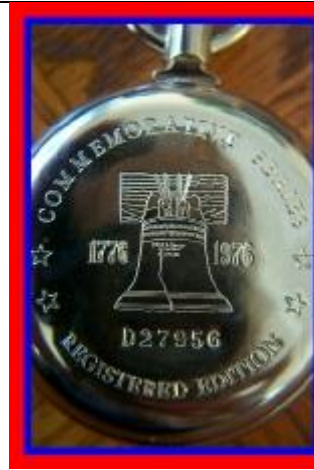
WNS-PW-6025 - Mickey Mouse 1976 Pocket Watch - Rear Case View