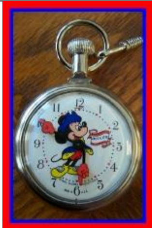
WNS-PW-6025 - Mickey Mouse 1976 Pocket Watch - Full Front View