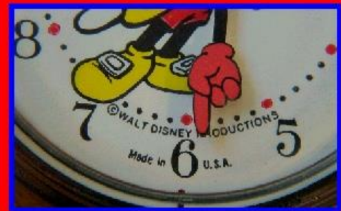
WNS-PW-6025 - Mickey Mouse 1976 Pocket Watch - Dial Close Up View