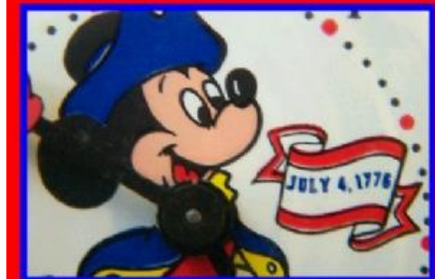
WNS-PW-6025 - Mickey Mouse 1976 Pocket Watch - Dial Close Up View_no_2