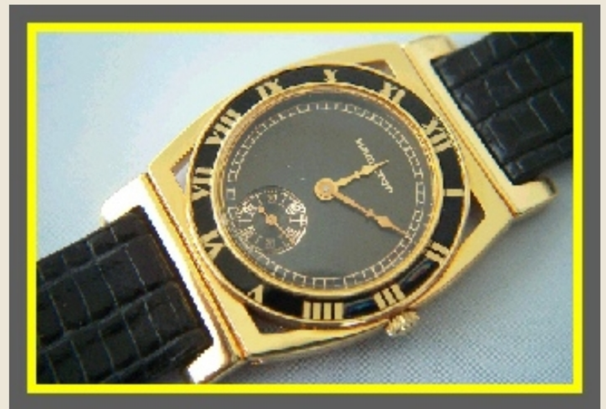
WNS-MDN-5026 - Hamilton - Piping Rock - Re-Issue Black Dial - Right Front View

Case: The tonneau shaped rose gold toned plated case is absolutely one of the nicest I have ever seen. It measures 30 mm (32 mm including the signed 'H' crown) and 42 mm (lug to lug.) It is 7 mm thick. The signed crown is located at the 3 o'clock position. The lugs are hinged (swinging type) that are very eye-catching and appealing. The back of the case is marked Registered Edition, Hamilton, Base Metal Bezel, Stainless Steel Back, and (the model number 6194A.) Dial: The mint round dial is finished with a gorgeous black color.