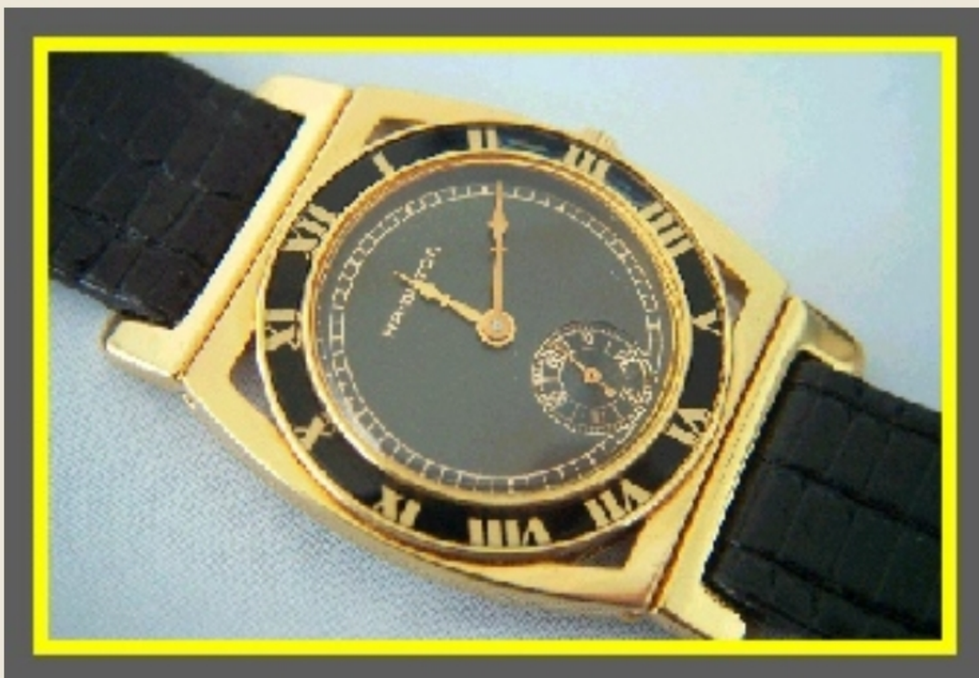
WNS-MDN-5026 - Hamilton - Piping Rock - Re-Issue Black Dial - Left Front View