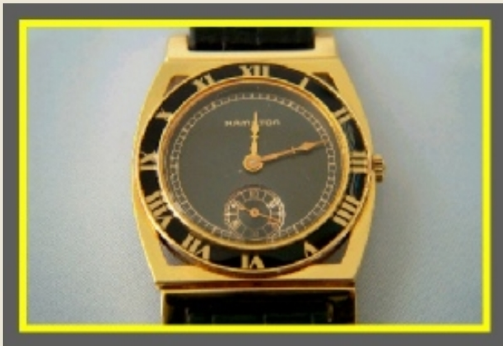
WNS-MDN-5026 - Hamilton - Piping Rock - Re-Issue Black Dial - Dial Close Up View