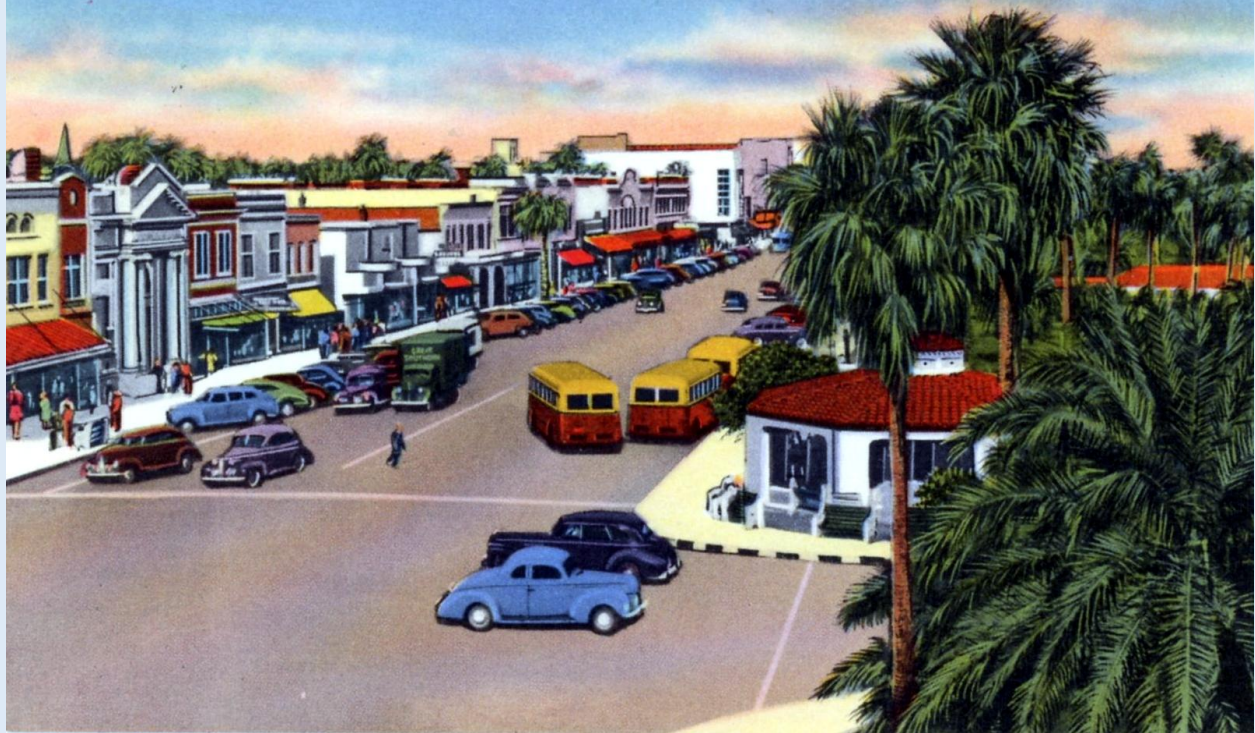
Beach Street Business District - (Buses at a Stop) - Daytona Beach, Fla. - ca. 1940s