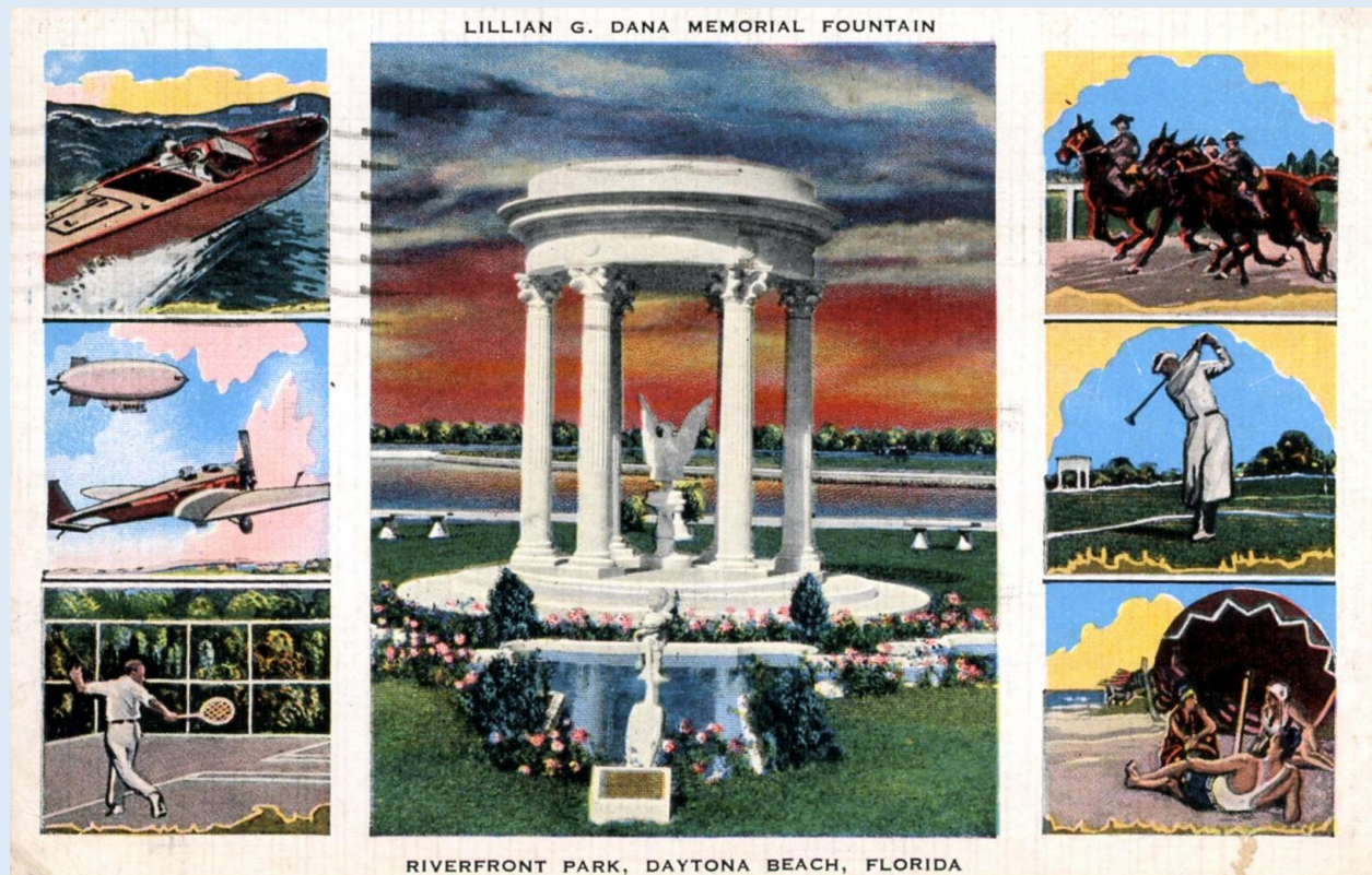
Riverfront Park - Daytona Beach, Fla. - ca. 1944