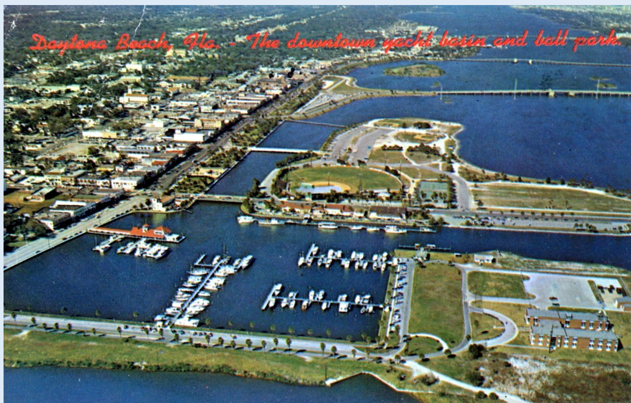
The Downtown Yacht Basin and Ball Park - Daytona Beach, Fla. - ca. 1971