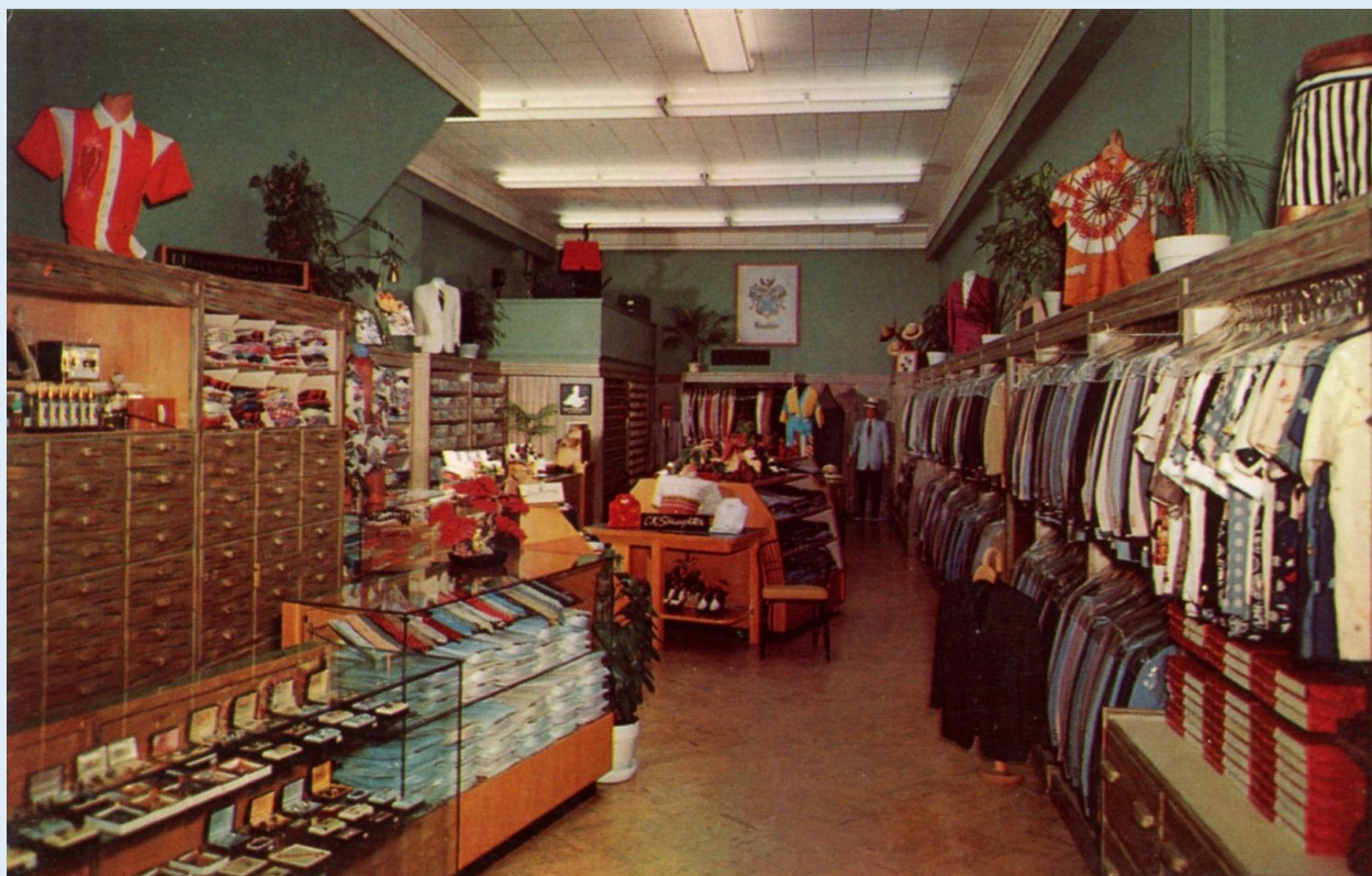
C.K. Slaughter - 206 South Beach Street - Daytona Beach, Fla. - ca. 1950s