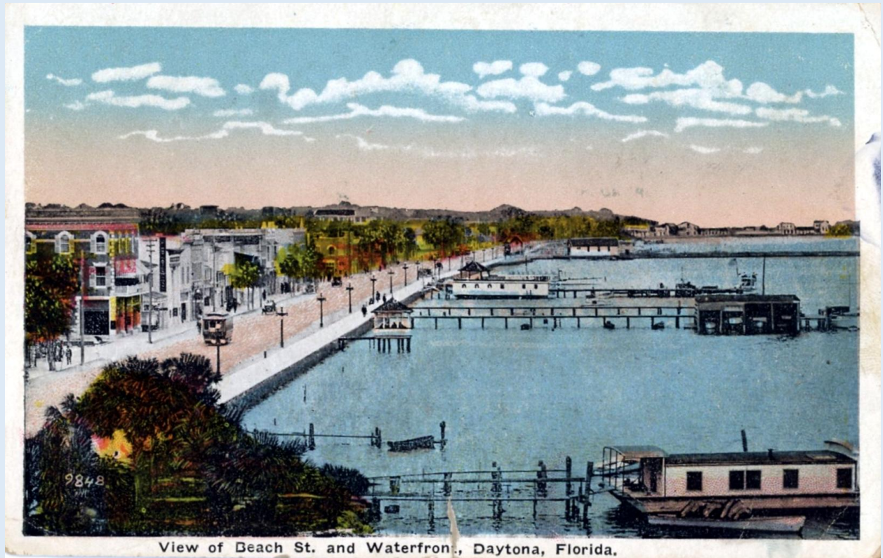
View of Beach St. and Waterfront - Daytona, Fla. - ca. 1915