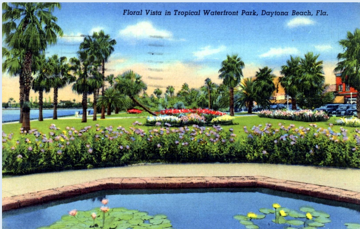
Floral Vista in Tropical Waterfront Park - Daytona Beach, Fla. - ca. 1944