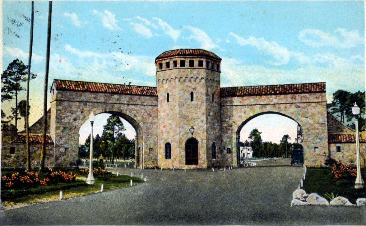
"FLORIDA'S SUBURB OF HILLS AND LAKES".