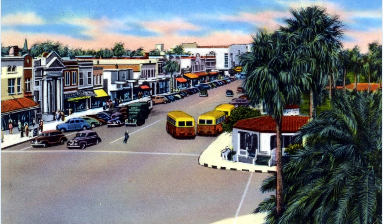
Beach Street Business District - Daytona Beach, Fla. - ca. 1940s