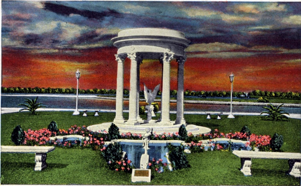
Lillian G. Dana Memorial Fountain - Riverfront Park - Daytona Beach, Fla. - ca. 1940s