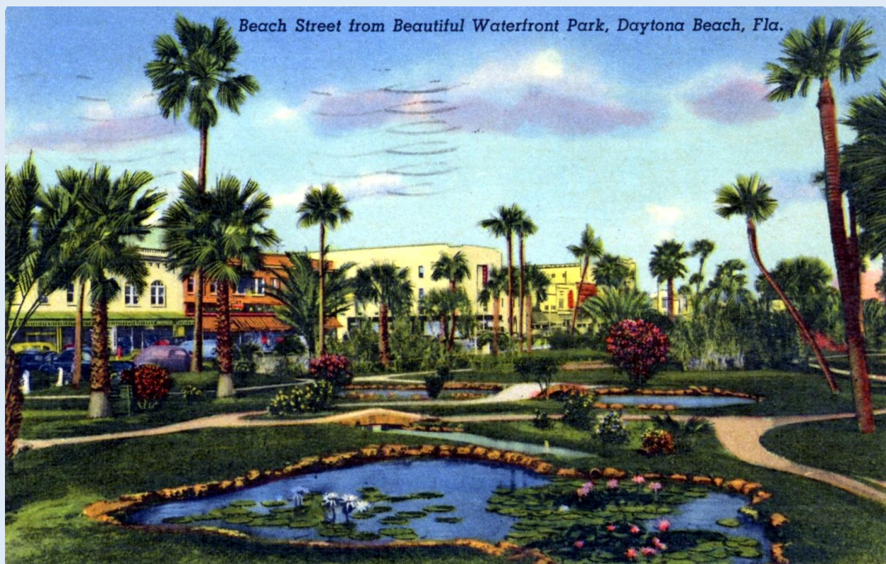
Beach Street from Beautiful Waterfront Park - Daytona Beach, Fla. - ca. 1957