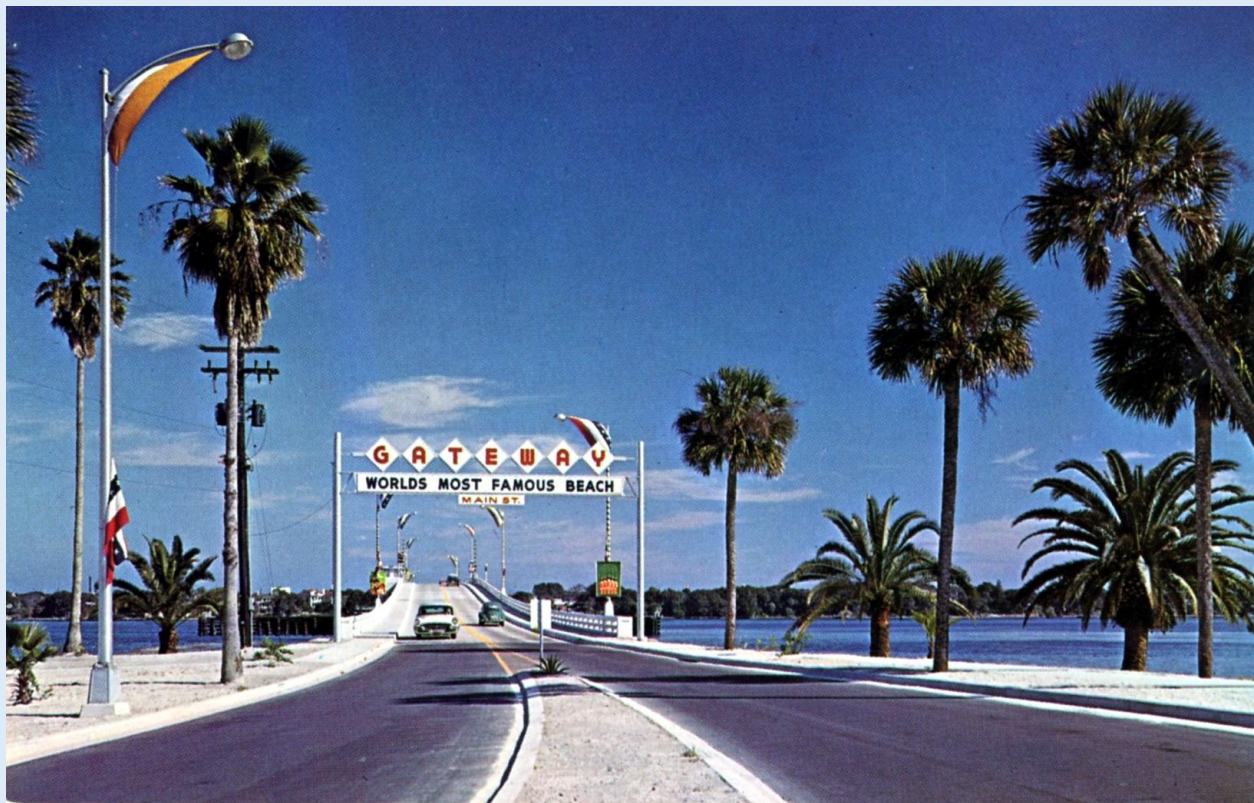
Main Street Bridge - Gateway to the World's Most Famous Beach - Daytona Beach, Fla. - 1950s