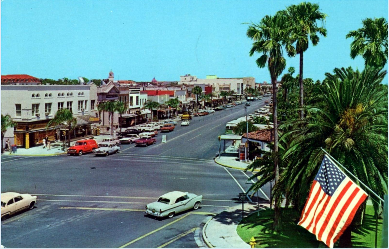
Beach Street Facing Waterfront Park - Daytona Beach, Fla. - ca. 1970