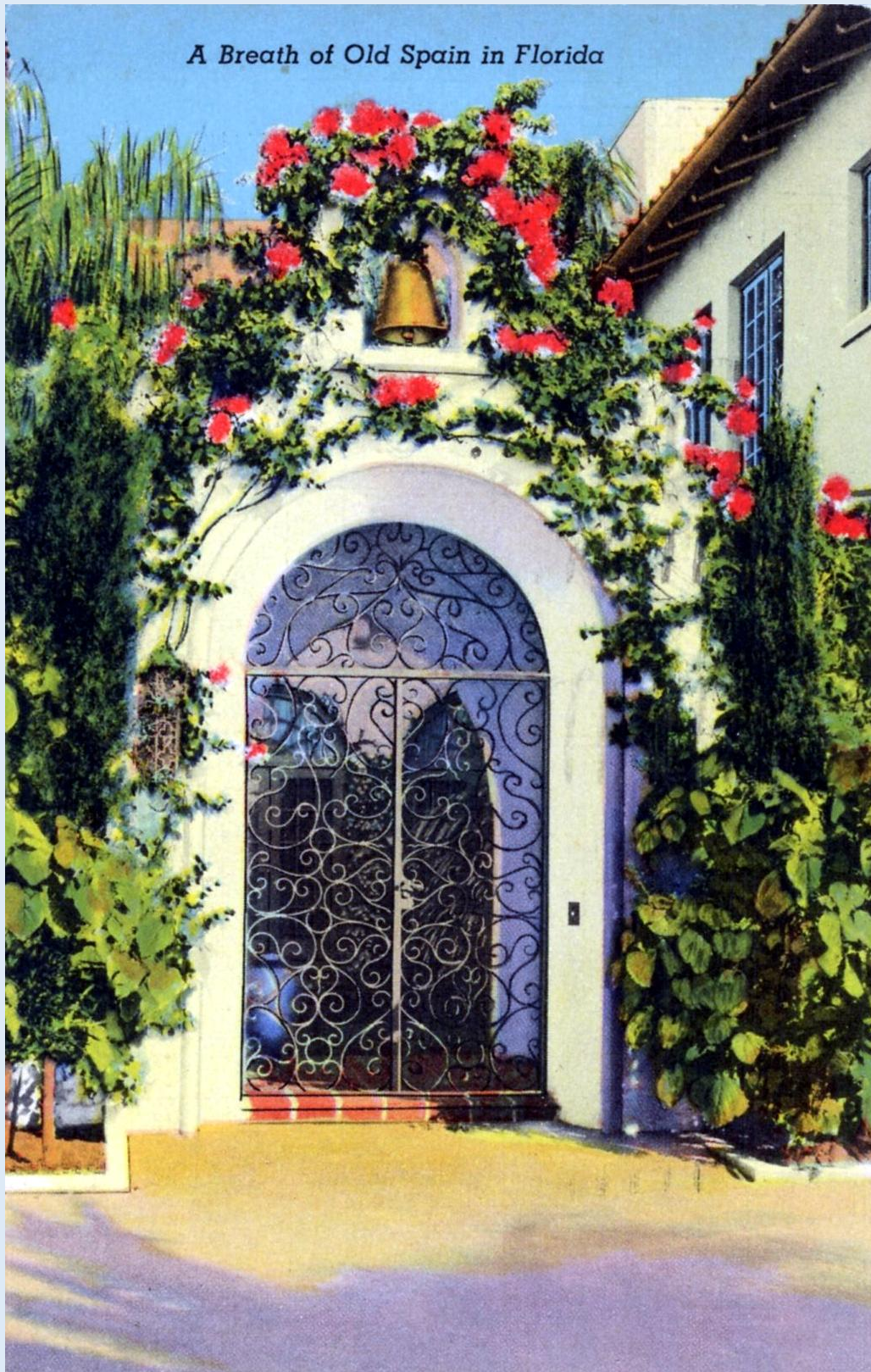
A Breath of Old Spain in Florida - Daytona Beach, Fla. - ca. 1941