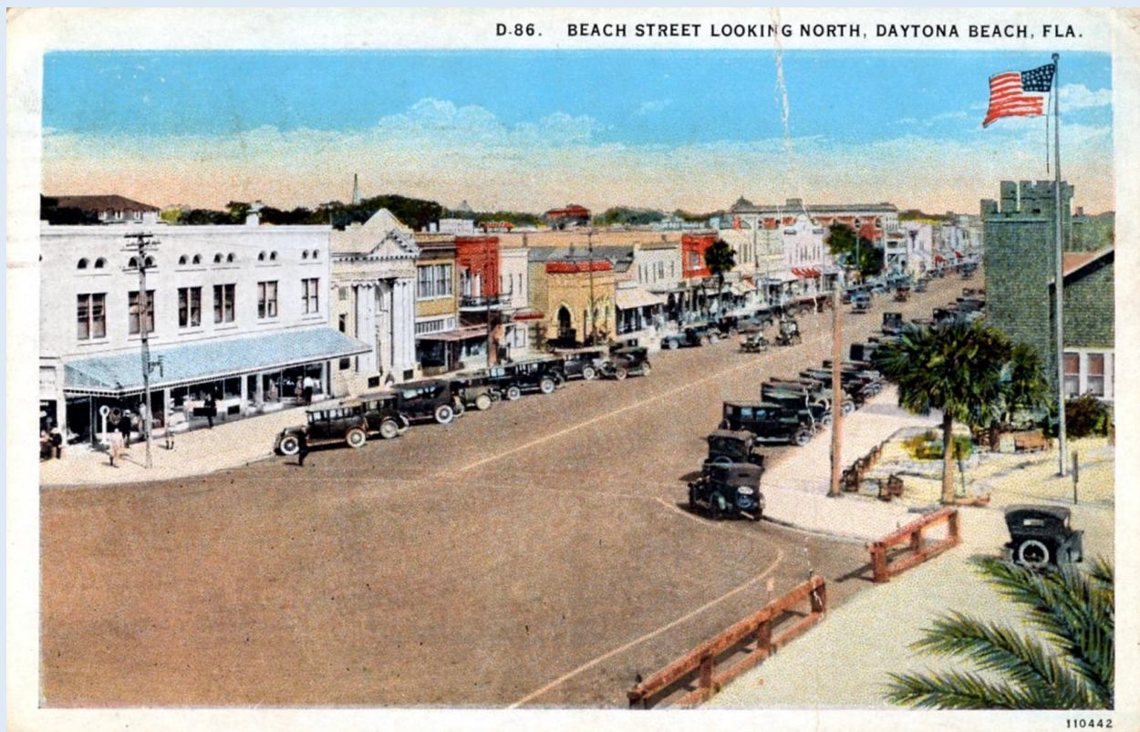
Beach Street Looking North - Daytona Beach, Fla. - ca. 1929