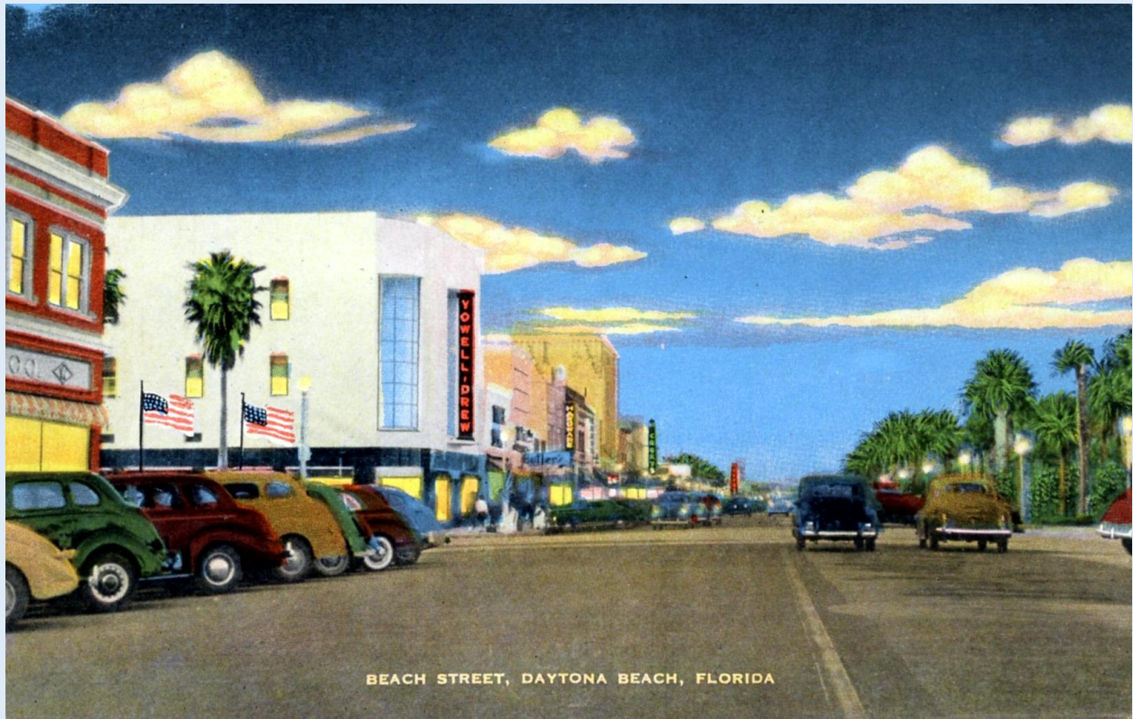
Beach Street (Commercial Business District) - Daytona Beach, Fla. - ca. 1930s