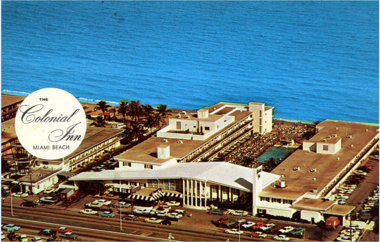
The Colonial Inn - Complete Resort Hotel - Miami Beach, Fla. - ca. 1960s.