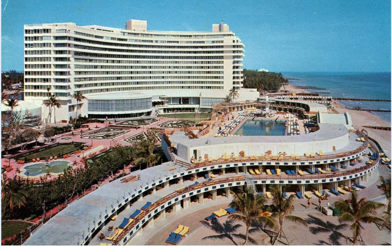
Fountainbleau Resort Hotel - largest on the oceanfront - 44th to 47th Street - Miami Beach, Fla. - ca. 1956.