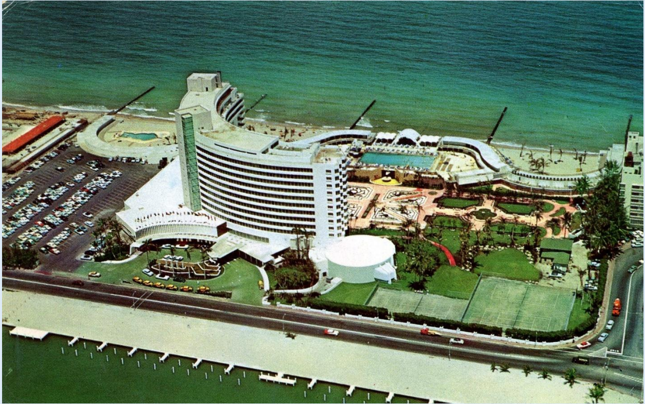
Fountainbleau Resort Hotel - Oceanfront, 44th to 47th Street - Miami Beach, Fla. - ca. 1960.