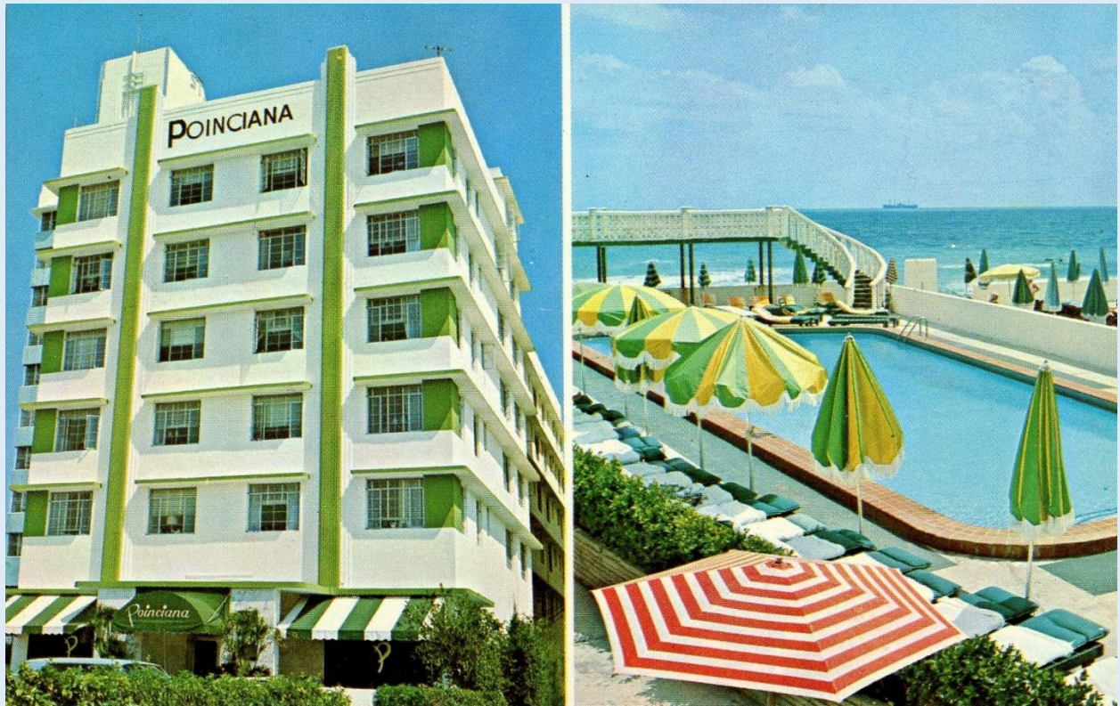
Poinciana Hotel - 1555 Collins Avenue - Miami Beach, Fla. - ca. 1970s.