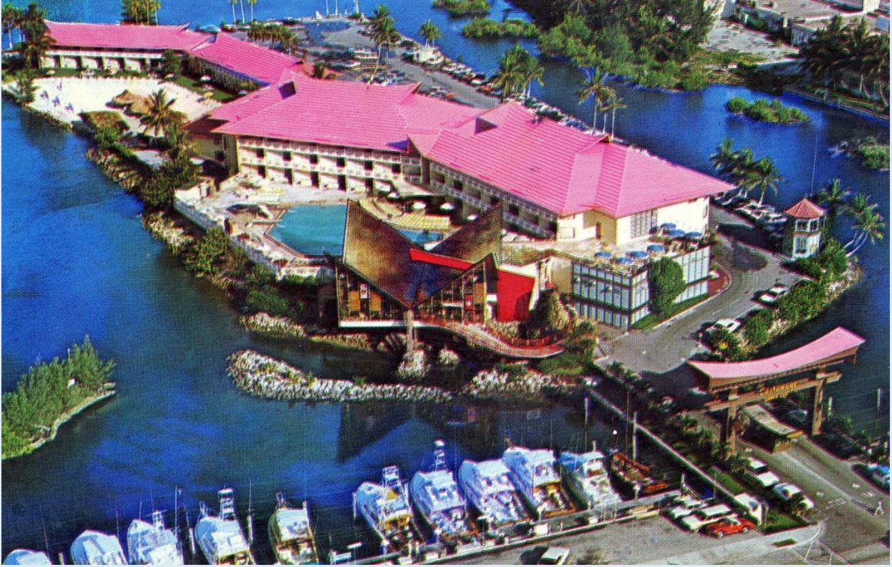
The Castaways Hotel - Fairyland Island - Miami Beach, Fla. - ca. 1973.