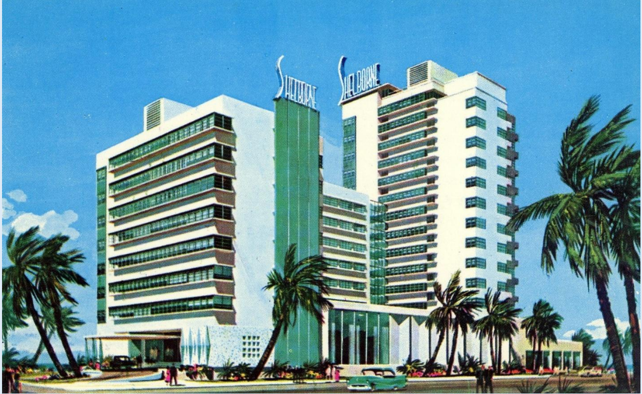
The Shelborne Hotel - directly on the Ocean at 18th Street - Miami Beach, Fla. - ca. 1969.