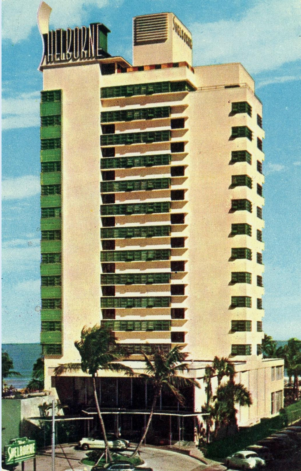
The Shelborne Hotel - on the ocean at 18th Street - Miami Beach, Fla. - ca. 1950s.