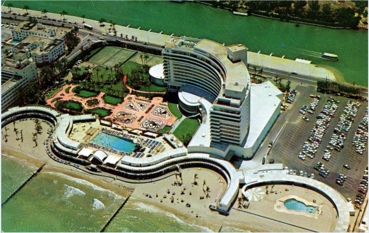
Fountainbleau Resort Hotel - a masterpiece of design - 44th to 47th Street - Miami Beach, Fla. - ca. 1970s.