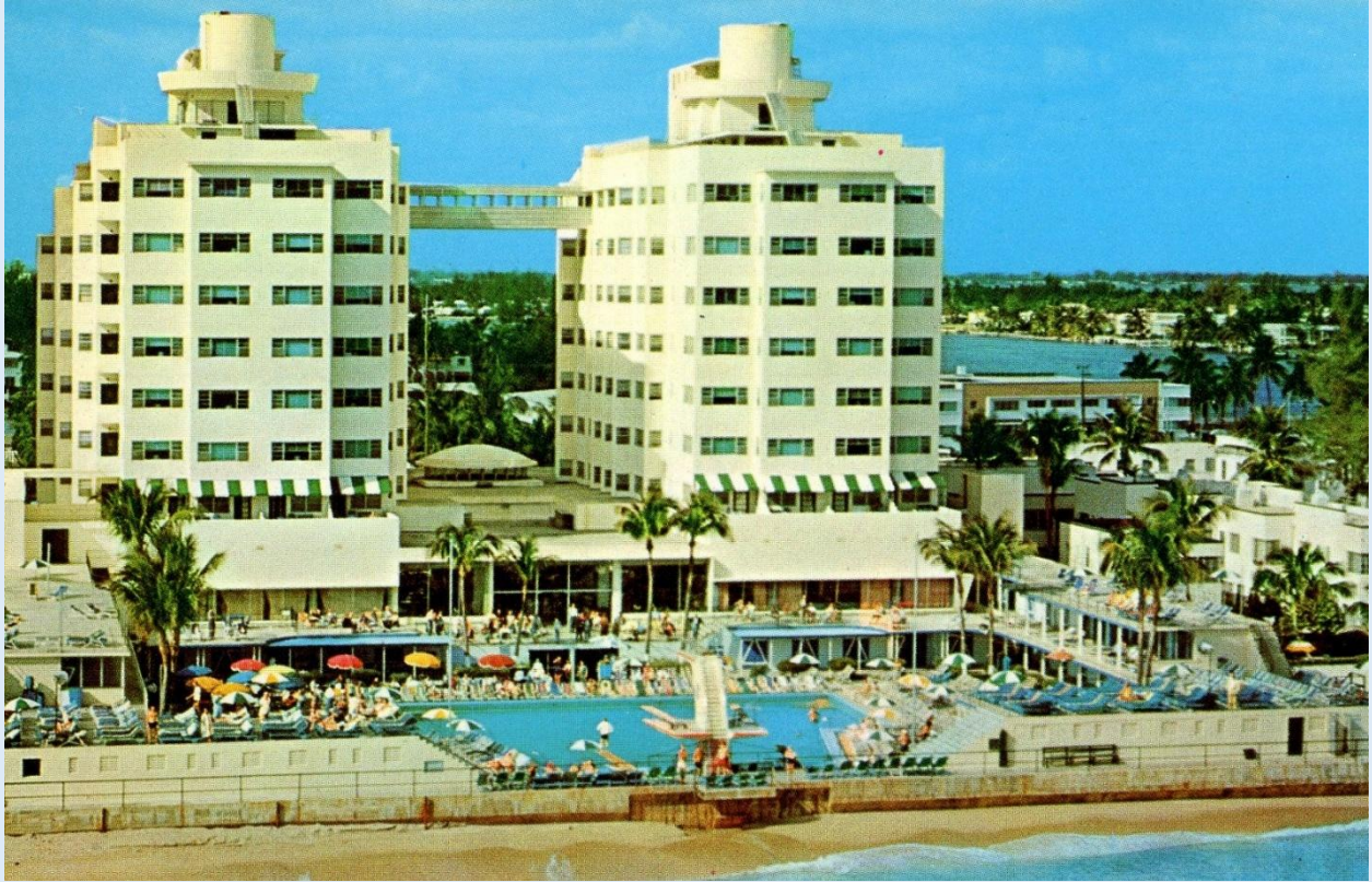
The Sherry Frontenac Hotel - on the ocean at 65th Street - Miami Beach, Fla. - ca. 1960s.