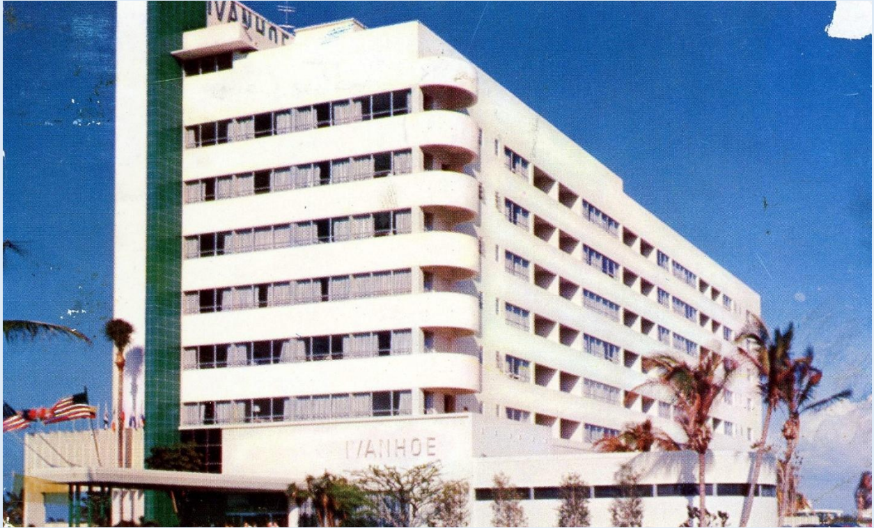
Ivanhoe Hotel - by the sea - oceanfront and 101st Street - Miami Beach, Fla. - ca. 1957.