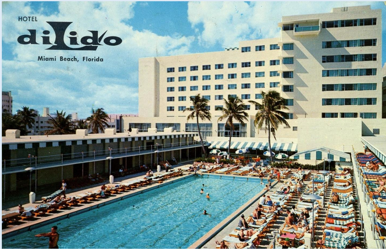
Dilido Hotel - on the ocean at Lincoln Road Mall - Miami Beach, Fla. - ca. 1969.