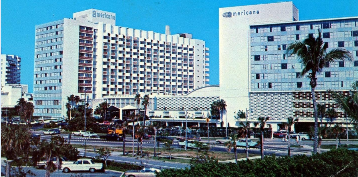
Americana Hotel - a fabulous site on Collins Avenue - Miami Beach, Fla. - ca. 1968.