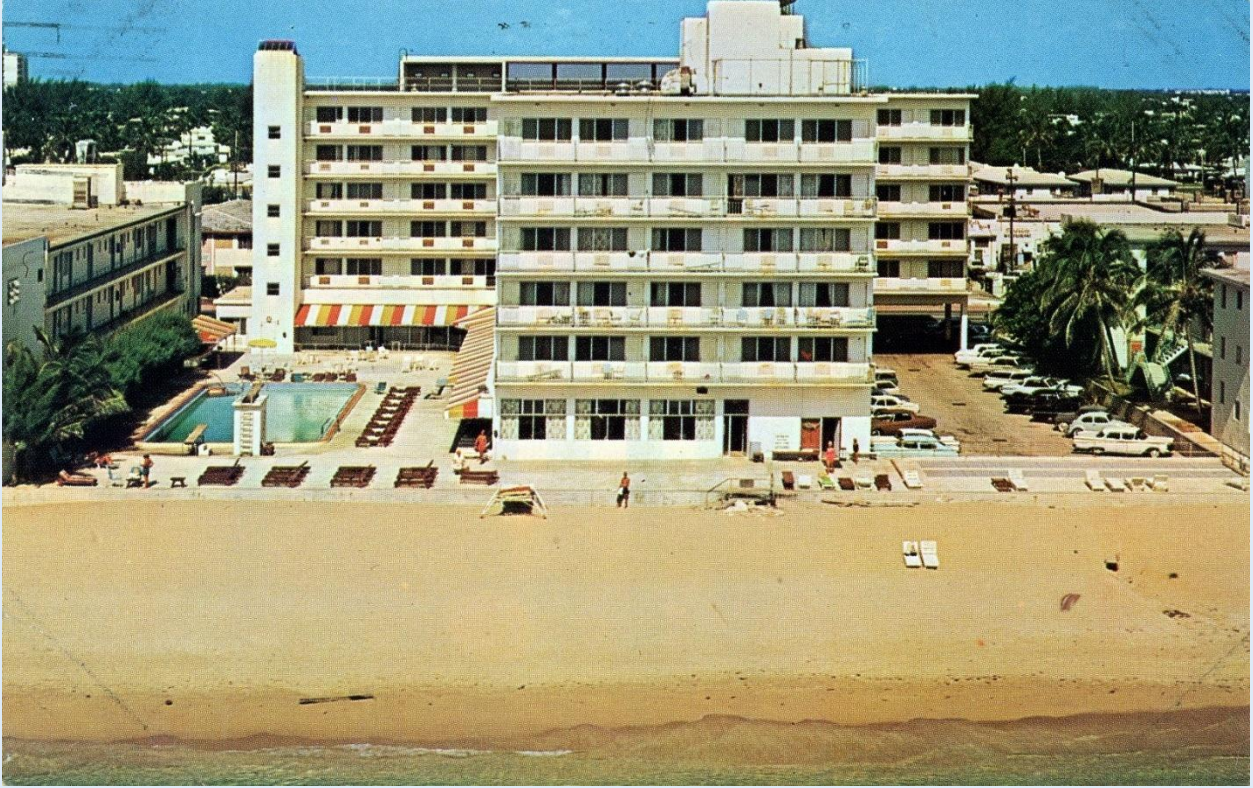
Florida Shores Resort - on the ocean at Collins Avenue and 94th Street - Miami Beach, Fla. - ca. 1967.