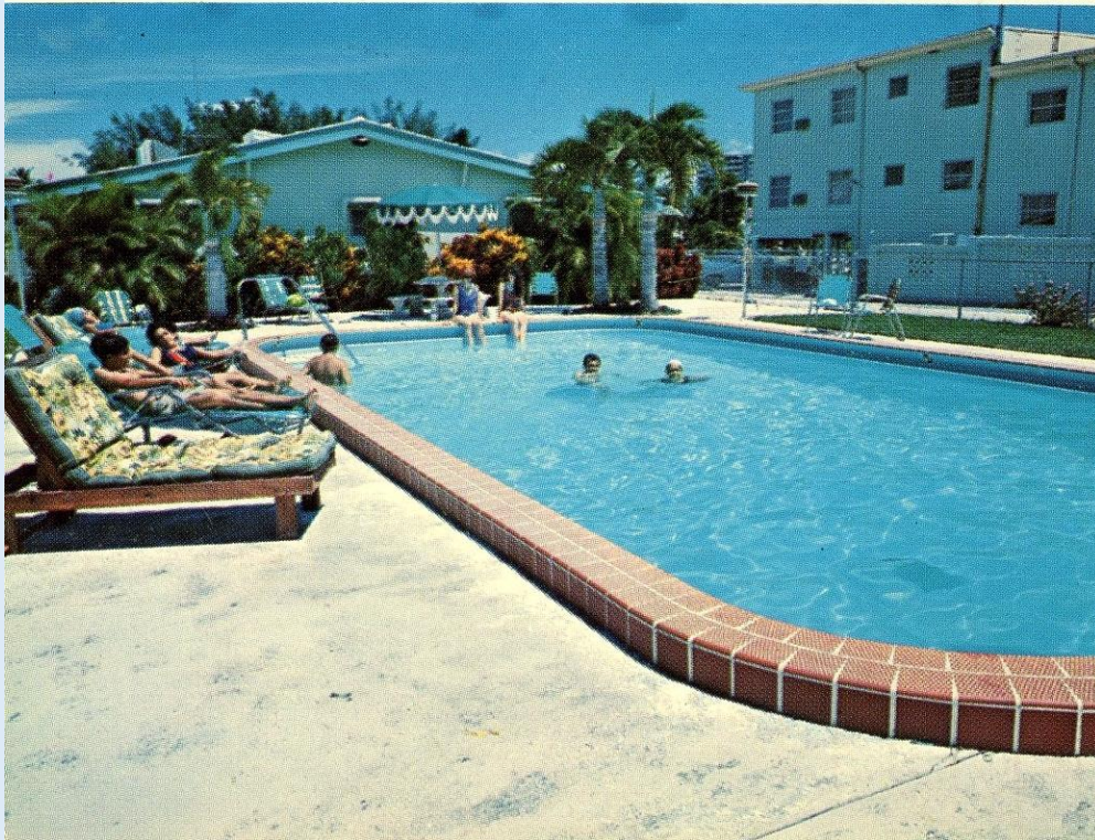
Towne Motel - 'Miami's Friendliest' - 1200 Brickell Avenue - Miami, Fla. - ca. 1960.