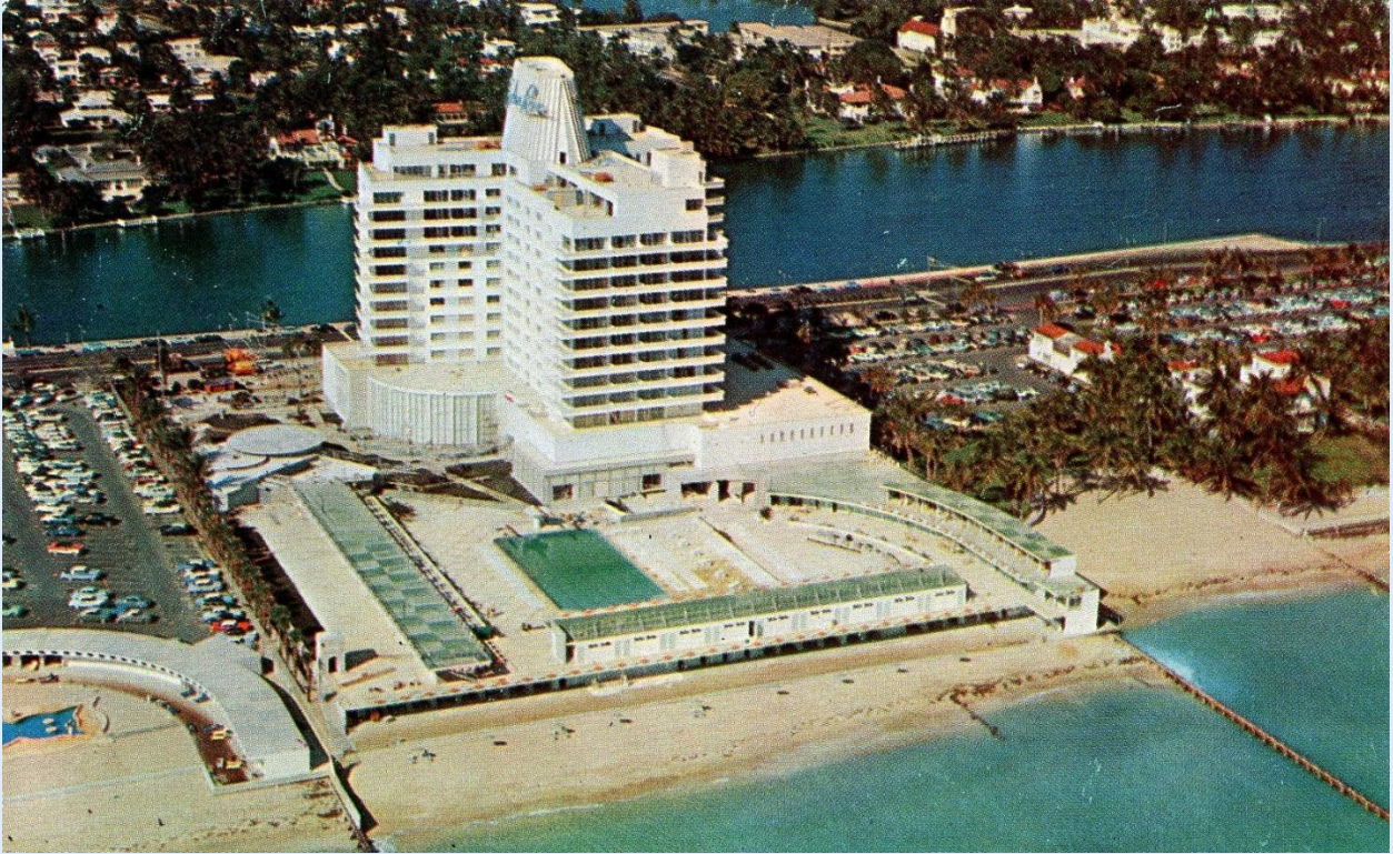
Eden Roc Hotel - Miami Beach, Fla. - ca. 1960s.