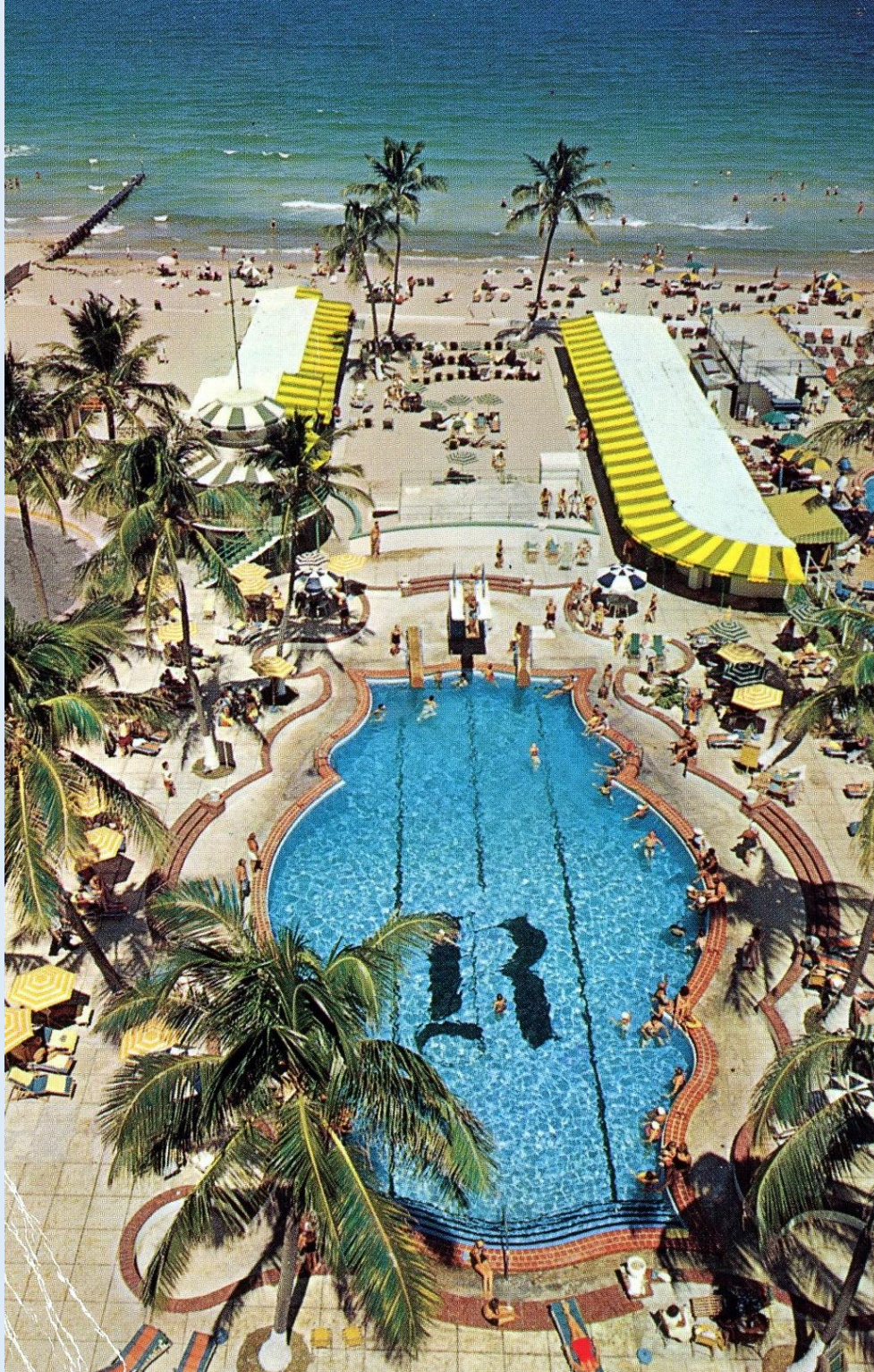
The Raleigh Hotel - 18th Street and Collins Avenue - Miami Beach, Fla. - ca. 1970.