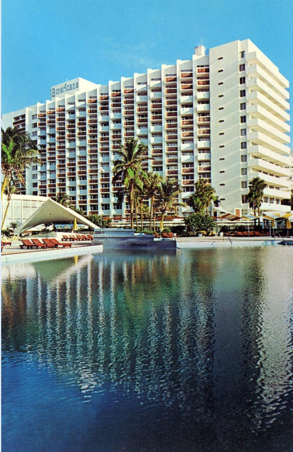
Americana Hotel - the different Miami Beach - Bal Harbor - Miami Beach, Fla. - ca. 1960s.