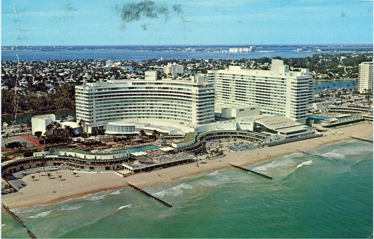
Fountainbleau Resort Hotel - Fabulous Oceanfront View, 44th to 47th Street - Miami Beach, Fla. - ca. 1974.