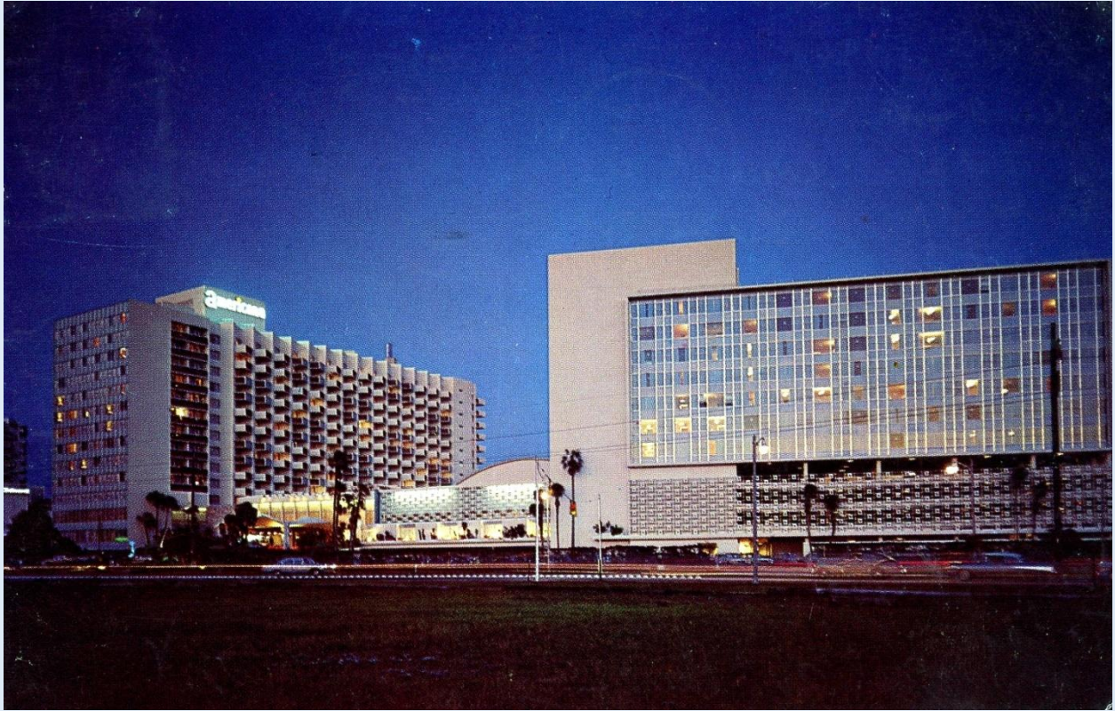
Americana Hotel - at night - Miami Beach, Fla. - ca. 1960.