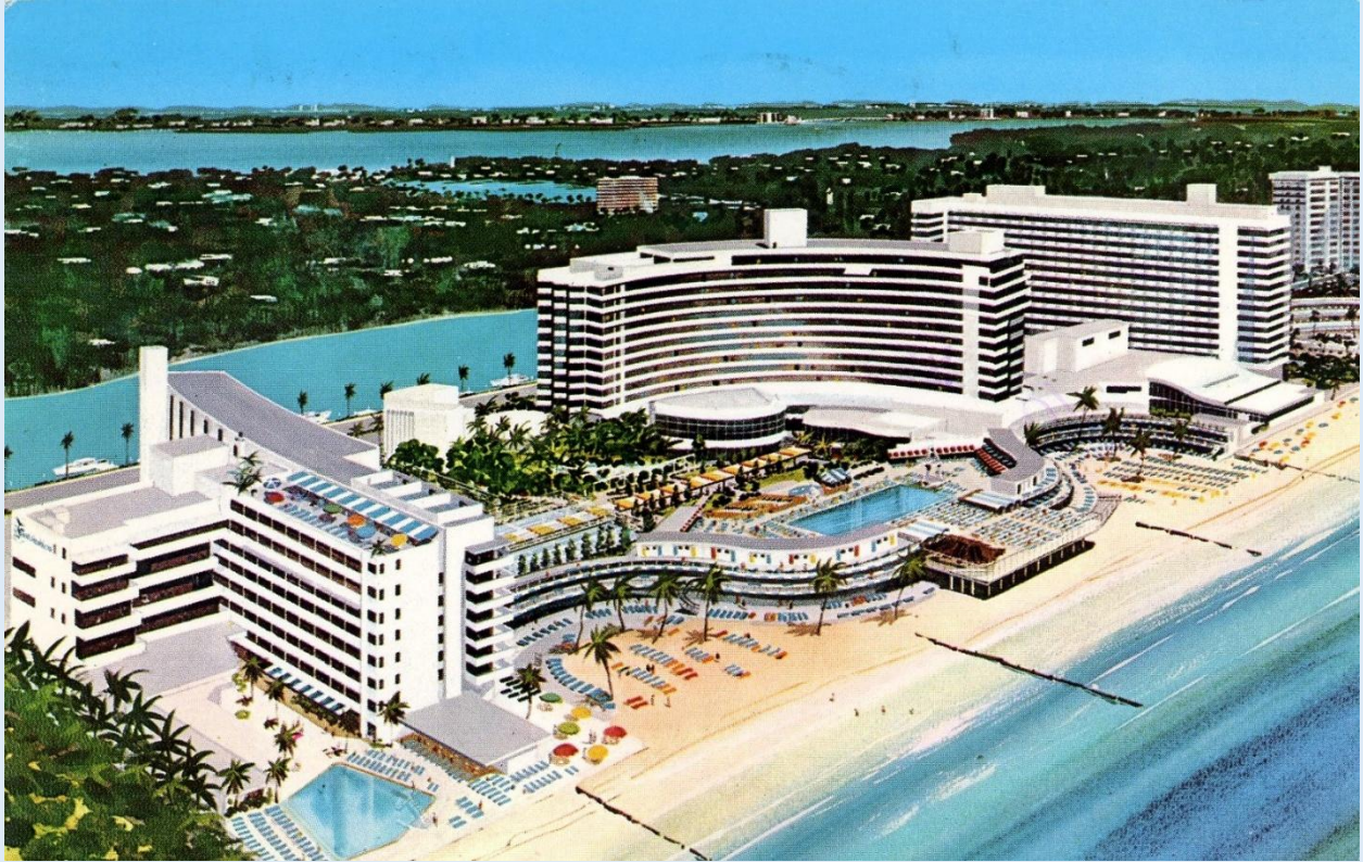
Fountainbleau Resort Hotel - Fabulous Oceanfront View, 44th to 47th Street - Miami Beach, Fla. - ca. 1971.