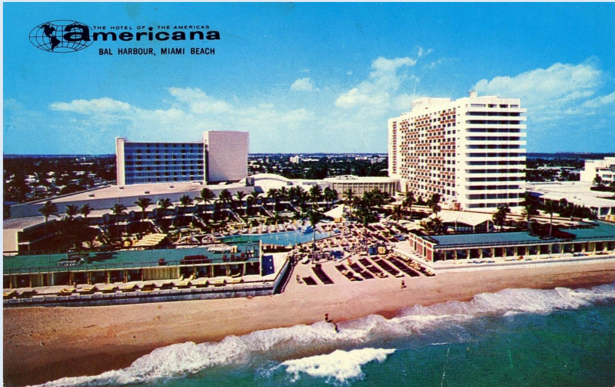
Americana Hotel - the Hotel of the Americas - Bal Harbor - Miami Beach, Fla. - ca. 1965.