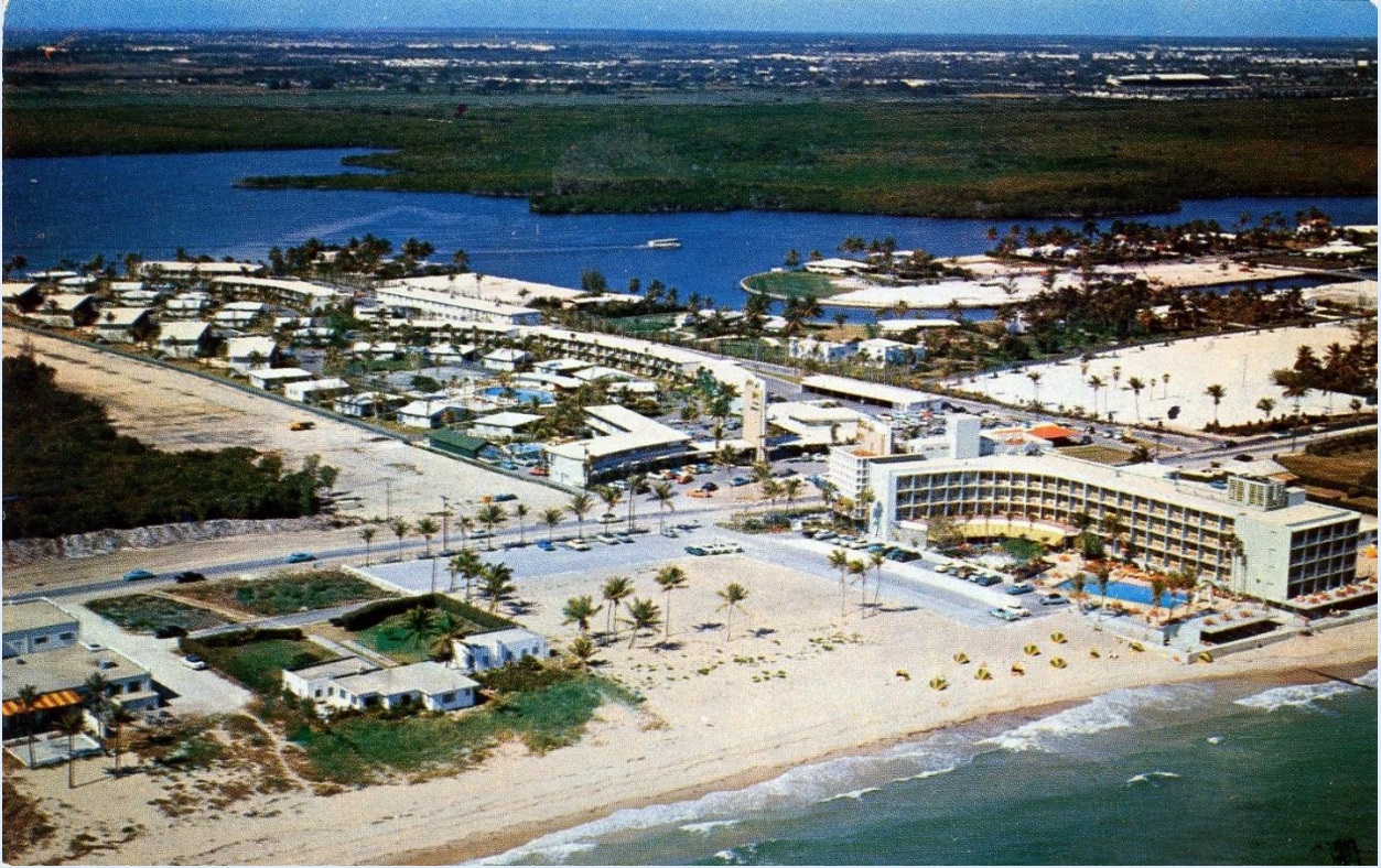
The Golden Gate Hotel - 19400 Collins Avenue - Miami Beach, Fla. - ca. 1960s.