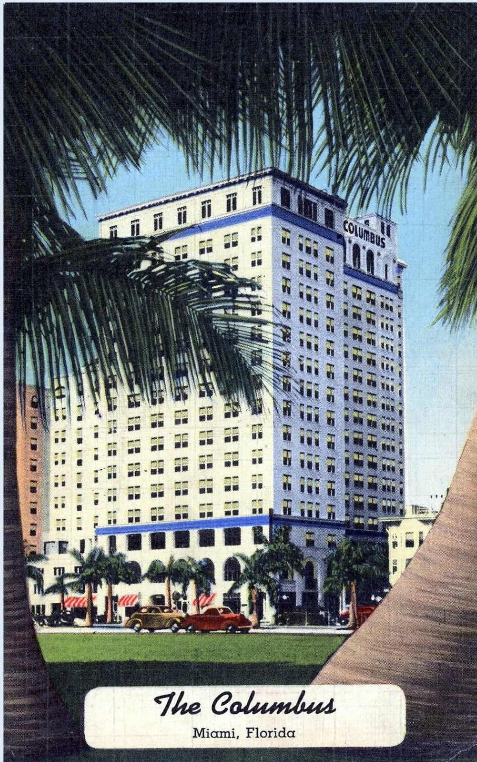
The Columbus - Miami's Finest Beachfront Hotel - Miami, Fla. - ca. 1930s.