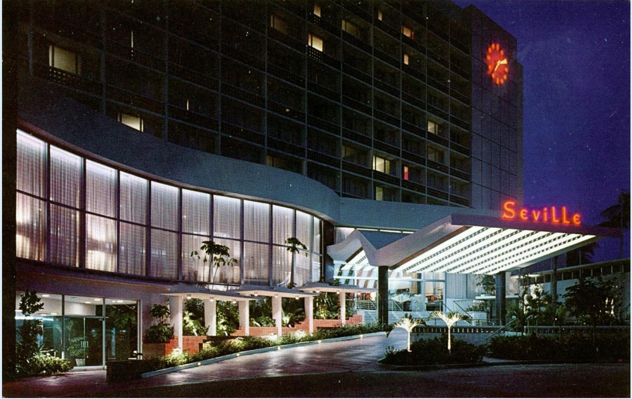
The Seville Hotel - at dusk - in the heart of Miami Beach, Fla. - ca. 1960s.