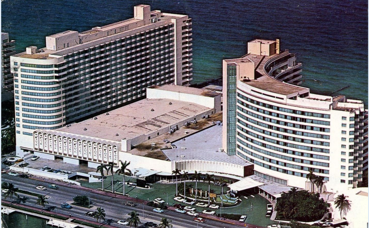
Fountainbleau Resort Hotel - in any season - 44th to 47th Street - Miami Beach, Fla. - ca. 1963.