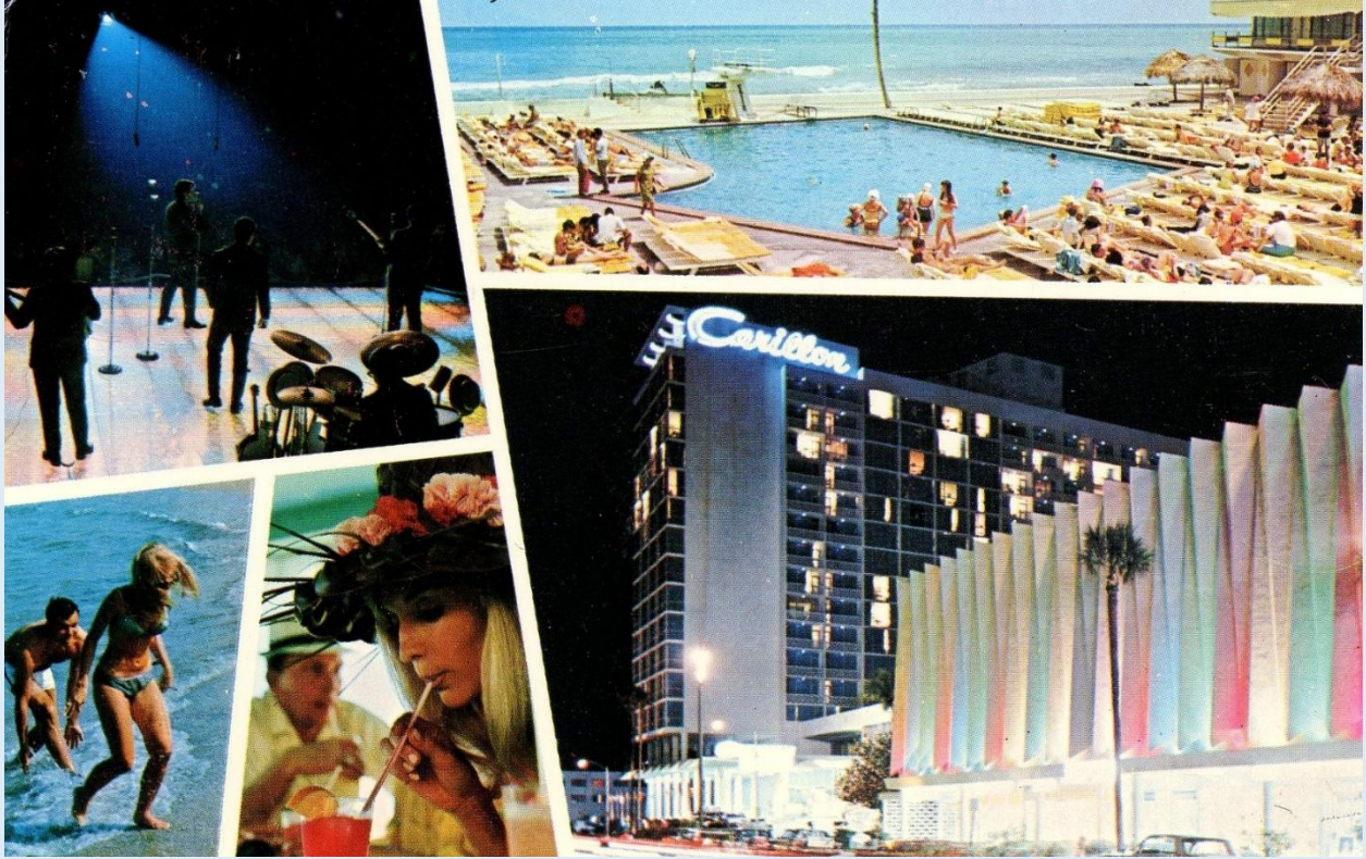
The Carillon Hotel - on Florida's Gold Coast - Multi-Views - Miami Beach, Fla. - ca. 1972.