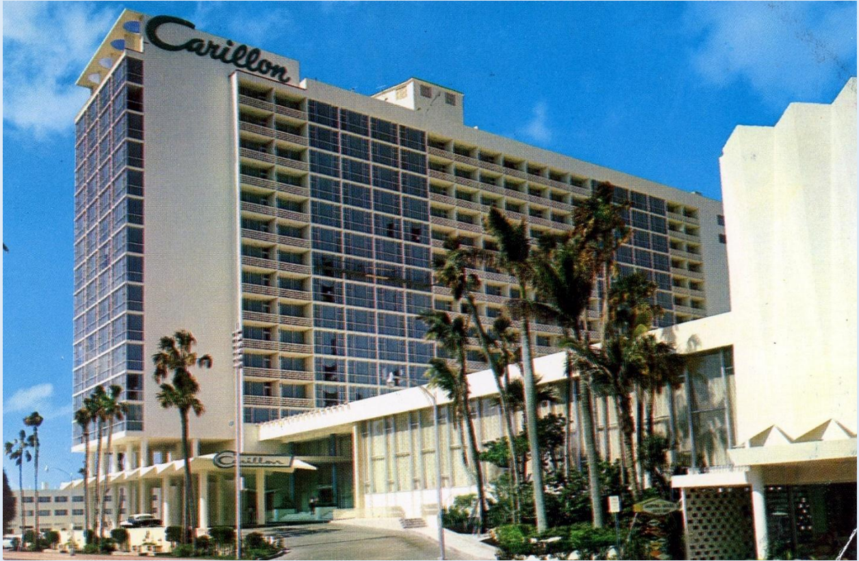
The Carillon Hotel - on Florida's Gold Coast - Miami Beach, Fla. - ca. 1959.