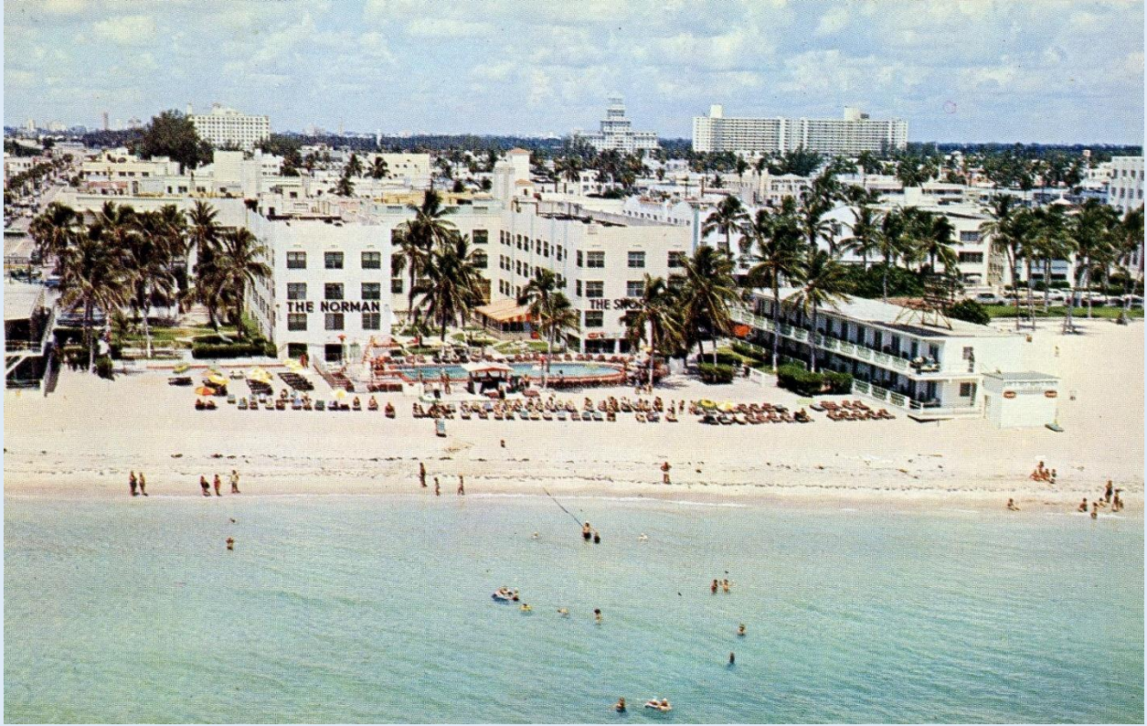
Shoreham and Norman Hotel - on the Ocean's very edge - Miami Beach, Fla. - ca. 1960s.