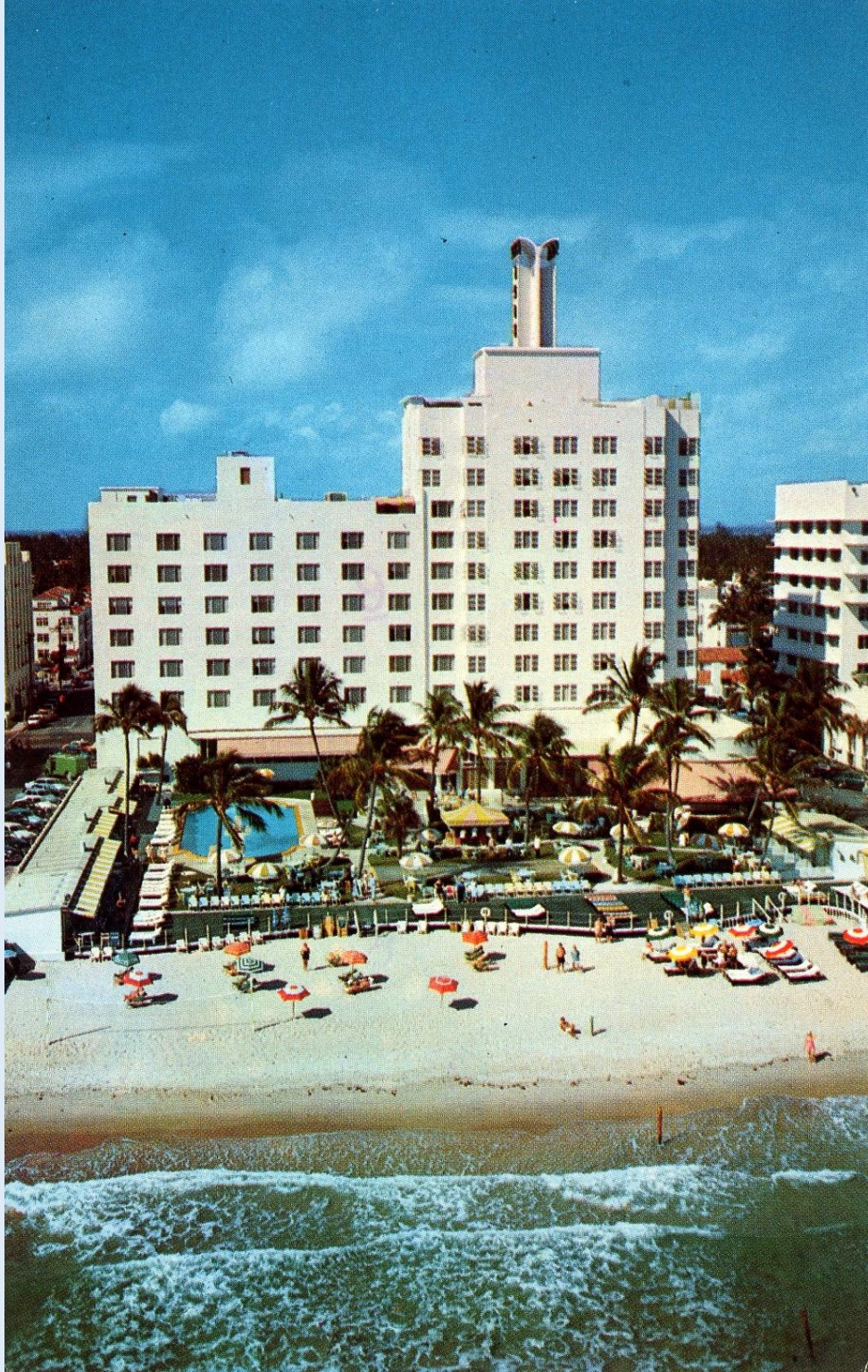
The Sea Isle - Florida's Most Magnificent Resort Estate - Miami Beach, Fla. - ca. 1971.