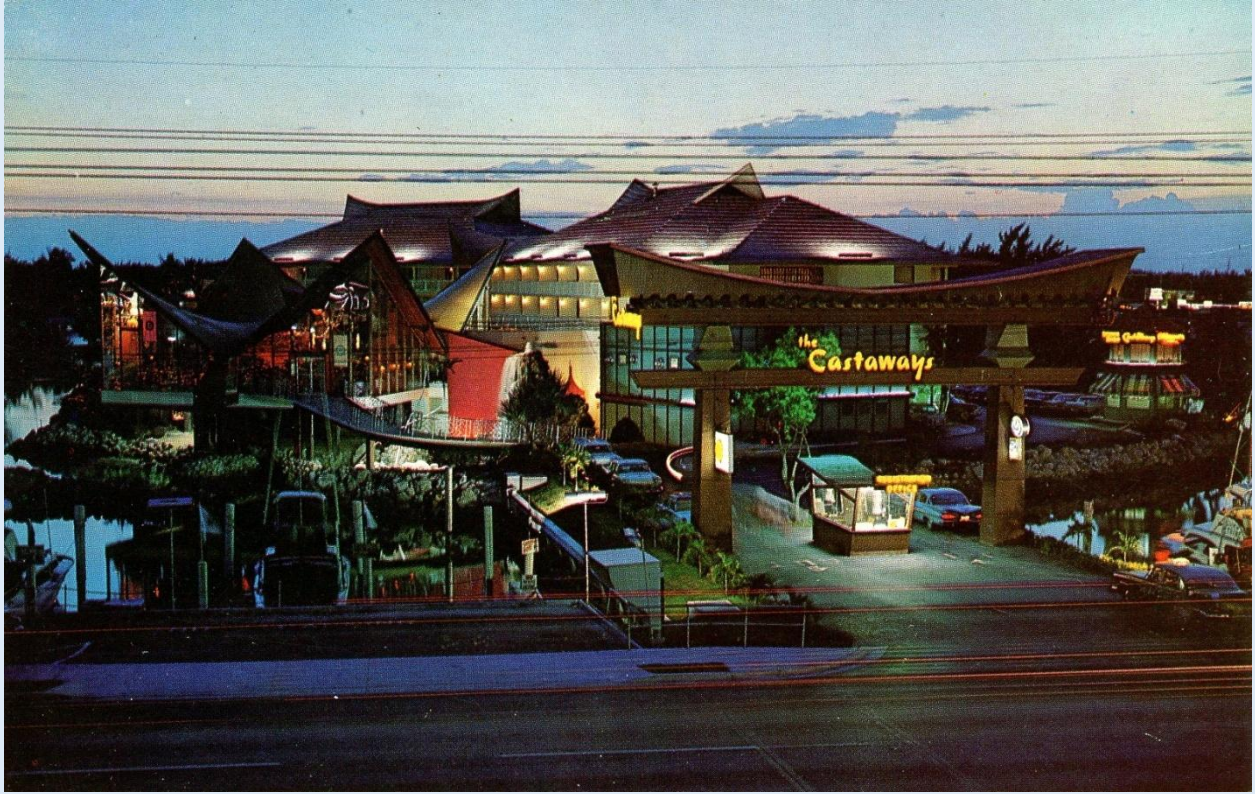
The Castaways Hotel - Front Exterior View at Sunset - Miami Beach, Fla. - ca. 1970s.