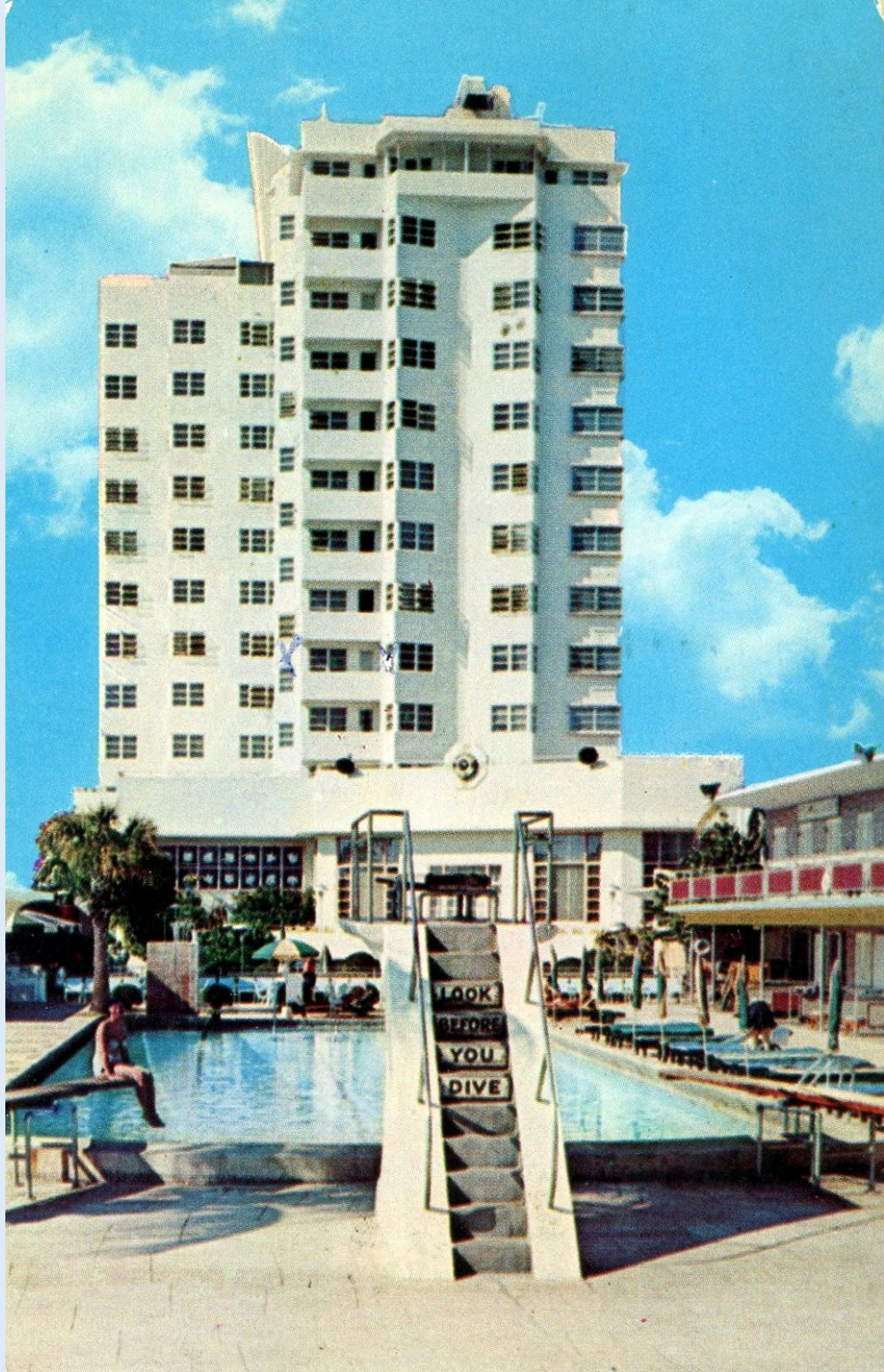
Delano Hotel and Cabana Club - Collins Avenue just north of Lincoln Road - Miami Beach, Fla. - ca. 1956.