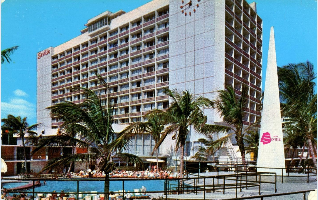
The Seville Hotel - in the heart of Miami Beach, Fla. - ca. 1960.