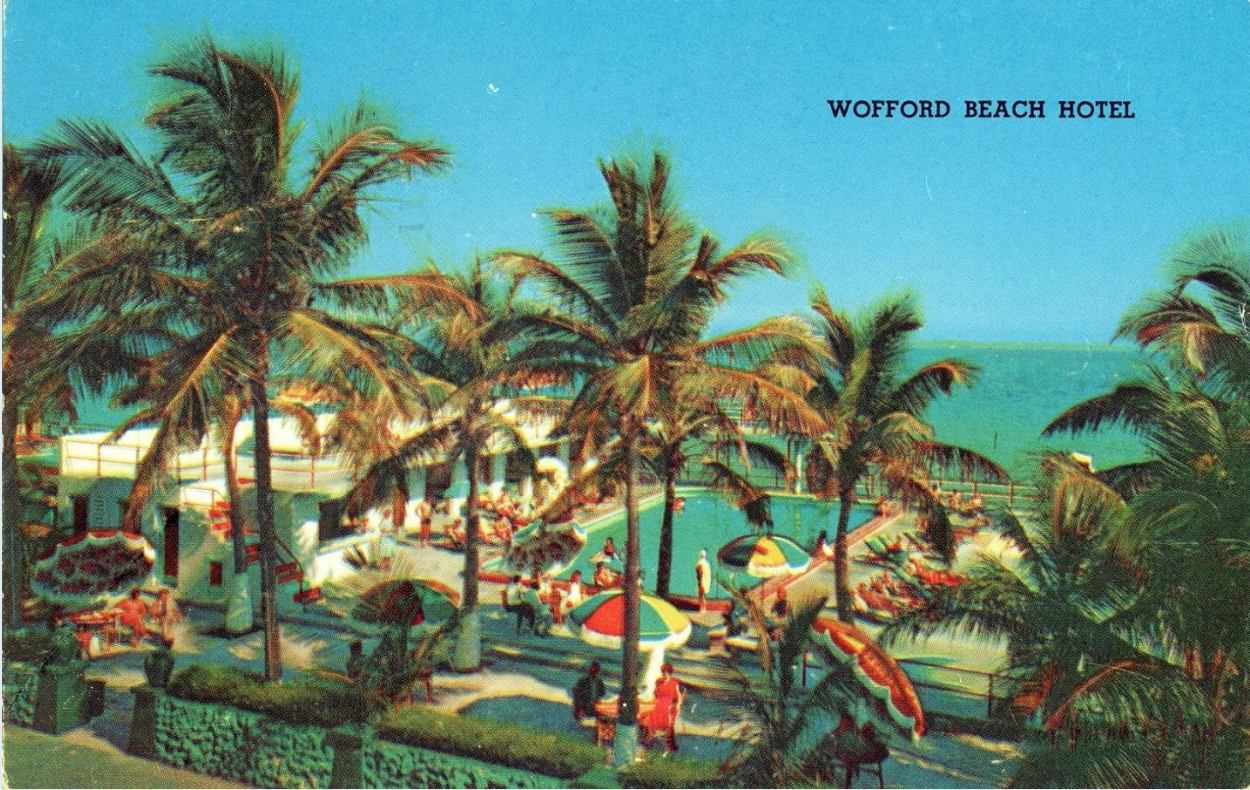
Wofford Beach Hotel - on the Ocean at 24th Street - Miami Beach, Fla. - ca. 1953.