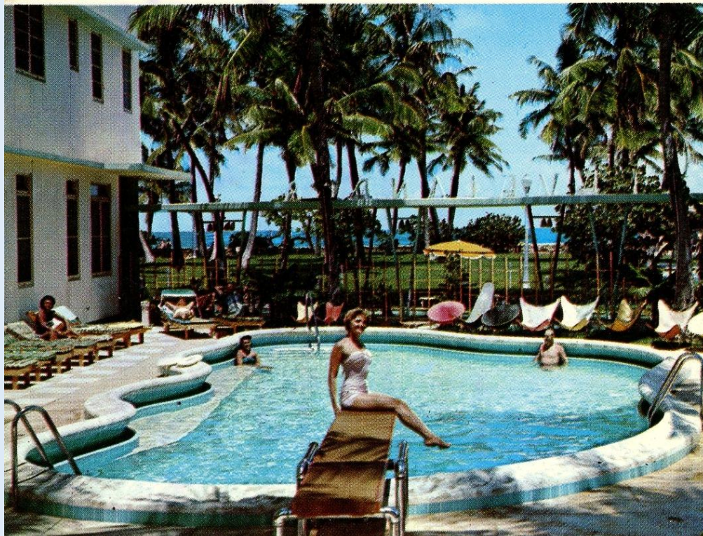
Clevelander Hotel - 1020 Ocean Drive - Miami Beach, Fla. - ca. 1960s.