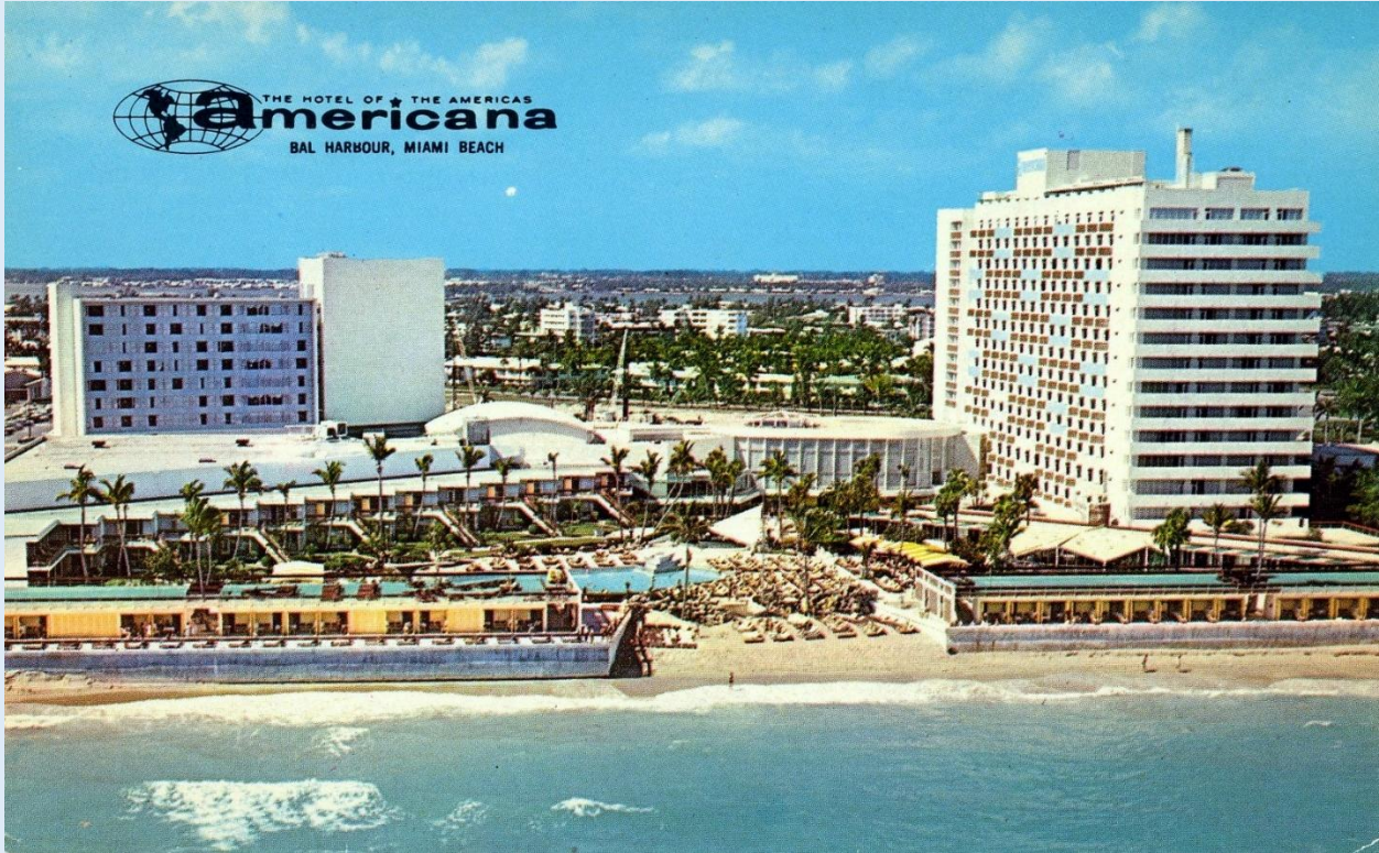
Americana Hotel - award winning cuisine at the Gaucho Steak House - Miami Beach, Fla. - ca. 1960s.