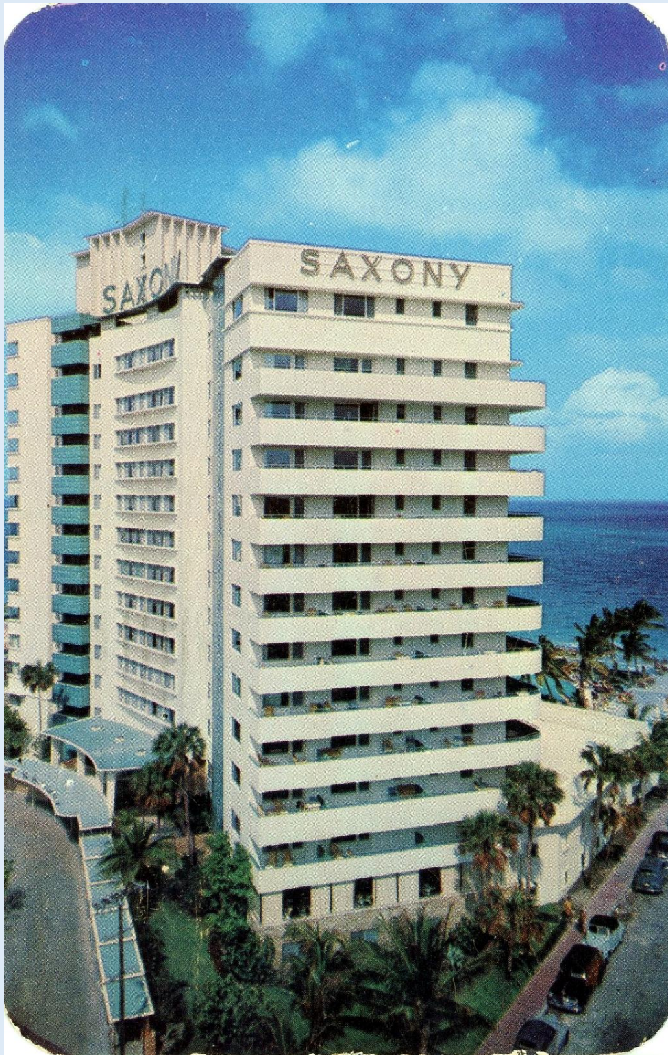
Saxony Hotel - luxurious resort on the oceanfront - Miami Beach, Fla. - ca. 1950s.