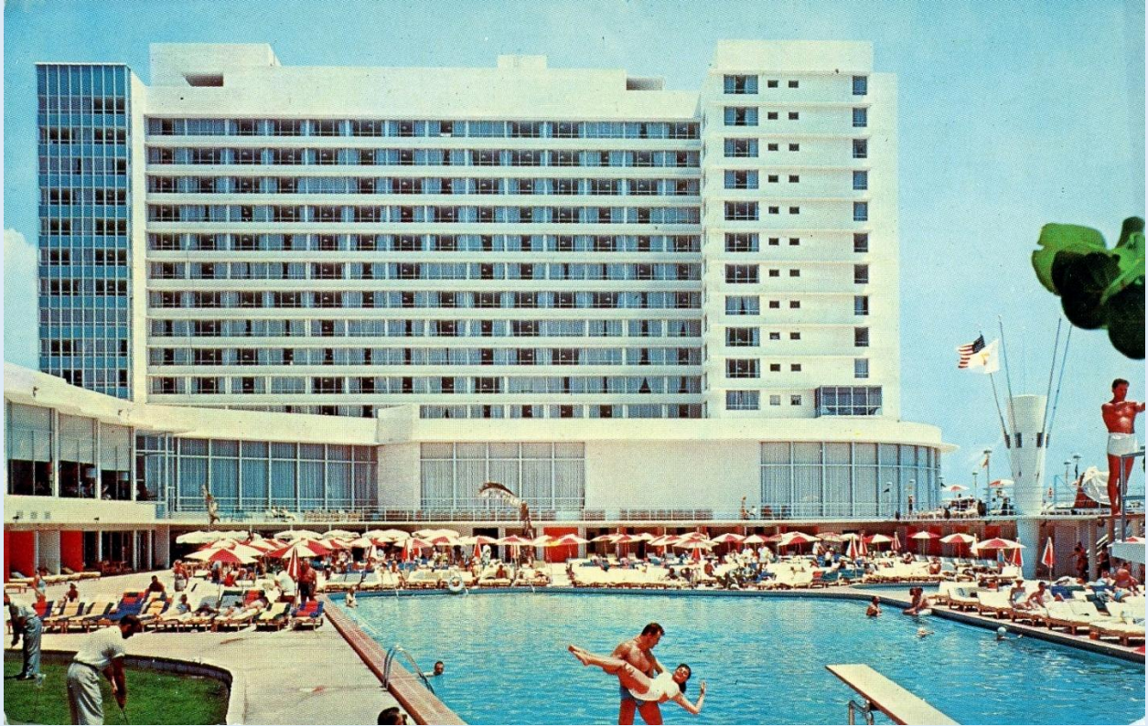
Eauville - Hotel of the Stars - 550 feet on the Ocean at 67th Street - Miami Beach, Fla. - ca. 1960s.