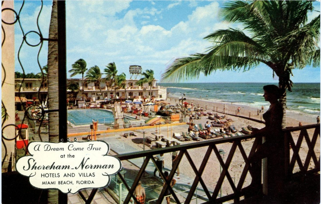
Shoreham-Norman - Twin Hotels and Villas - Miami Beach, Fla. - ca. 1960s.