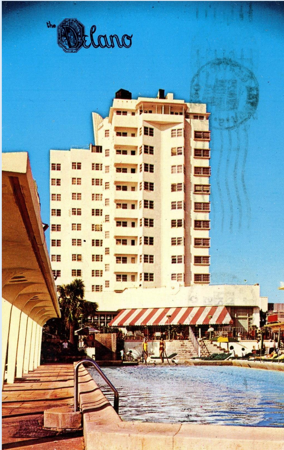
Delano Hotel and Cabana Club - Collins near Lincoln Road - Miami Beach, Fla. - ca. 1970.