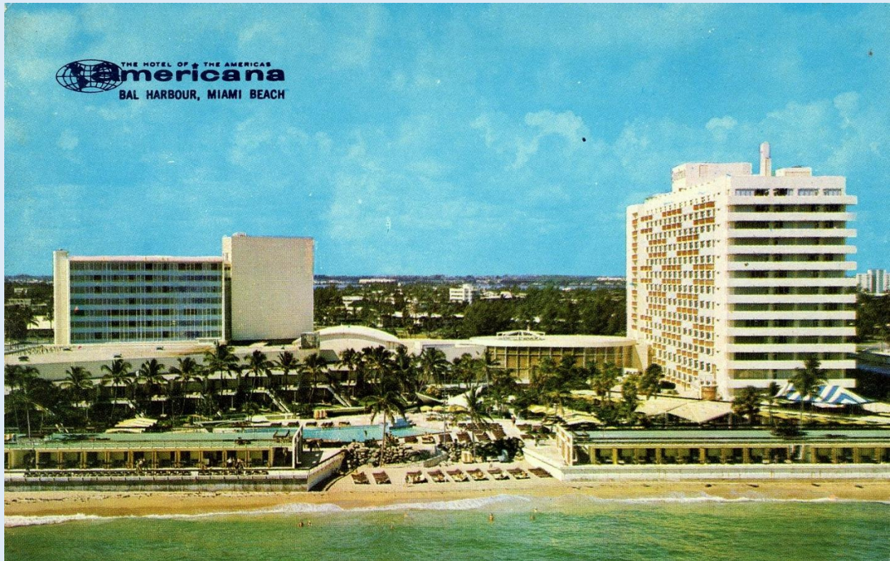
Americana Hotel - one of the world's most famous hotels - Miami Beach, Fla. - ca. 1960s.