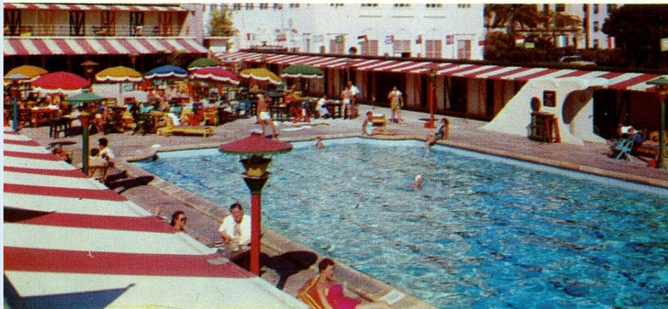
The Robert Clay Hotel - Pool and Cabana Club - Miami, Fla. - ca. 1960s.