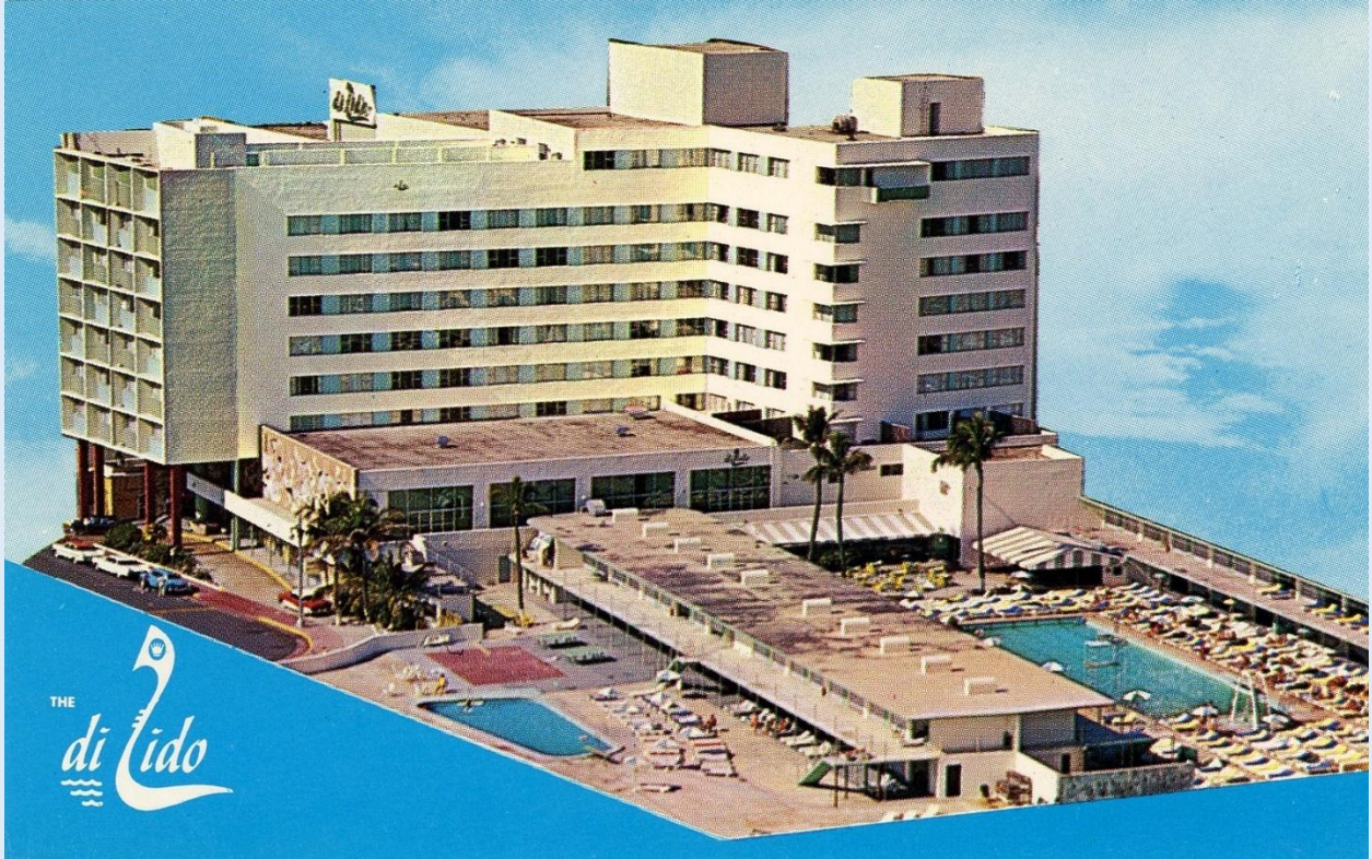
Dilido Hotel - 400 feet of oceanfront at Lincoln Boulevard - Miami Beach, Fla. - ca. 1970s.