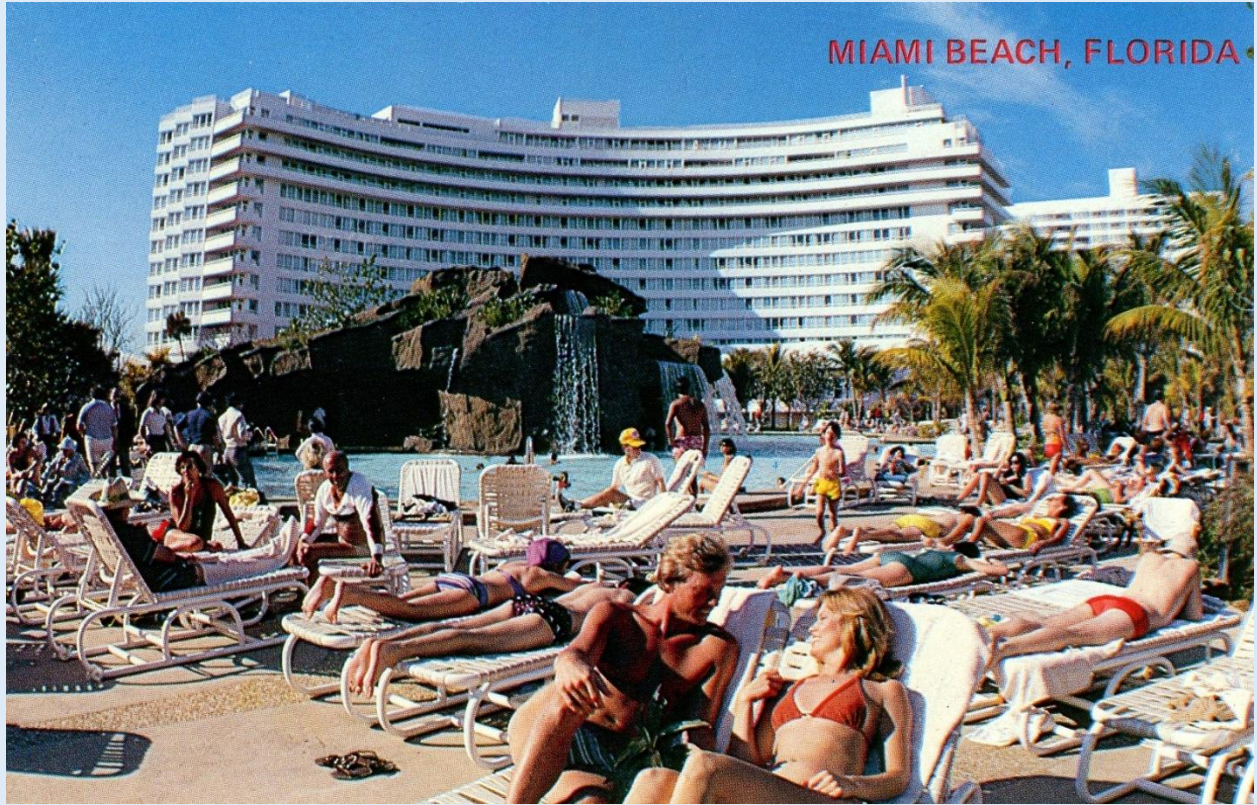
Poolside of a Fabulous Hotel - Miami Beach, Fla. - ca. 1970s.