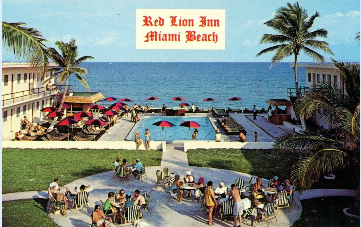
Red Lion Inn - 19051 Collins Avenue - Miami Beach, Fla. - ca. 1970s.