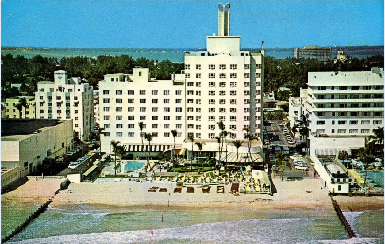
Sea Isle Hotel - exceptional features and facilities - Miami Beach, Fla. - ca. 1967.