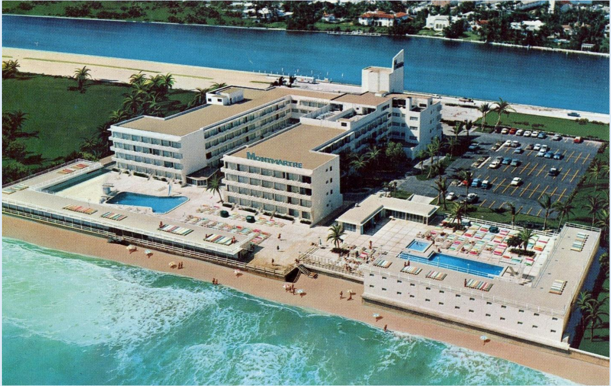
The Montmartre - a Hotel with a touch of Paris in Miami Beach, Fla. ca. 1970s.