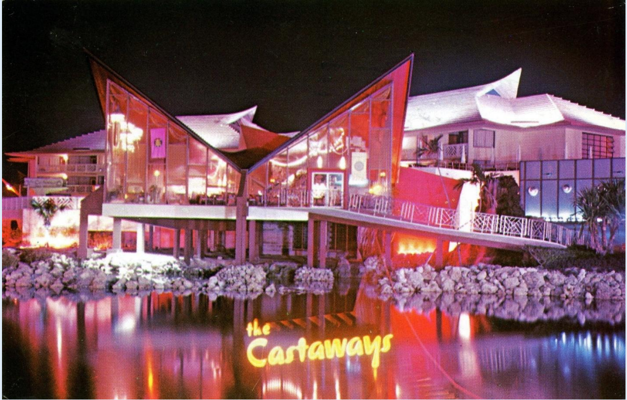
The Castaways Hotel - outstanding and beautiful motel along the oceanfront - Miami Beach, Fla. - ca. 1970s.