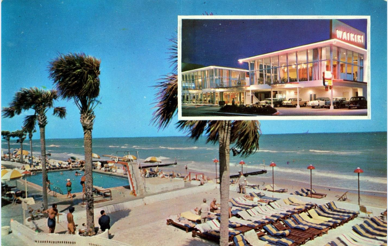
Waikiki - on the Oceanfront at 18801 Collins Avenue - Miami Beach, Fla. - ca. 1970s.