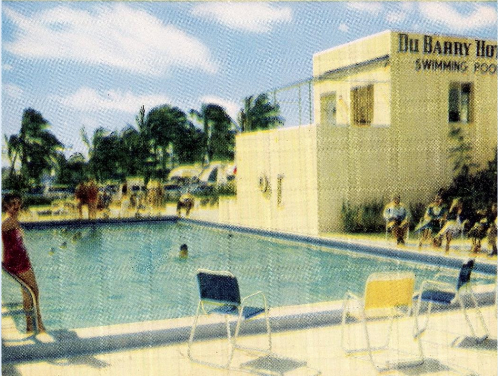
The DuBarry Hotel - 7320 Ocean Terrace - Miami Beach, Fla. - ca. 1940s.