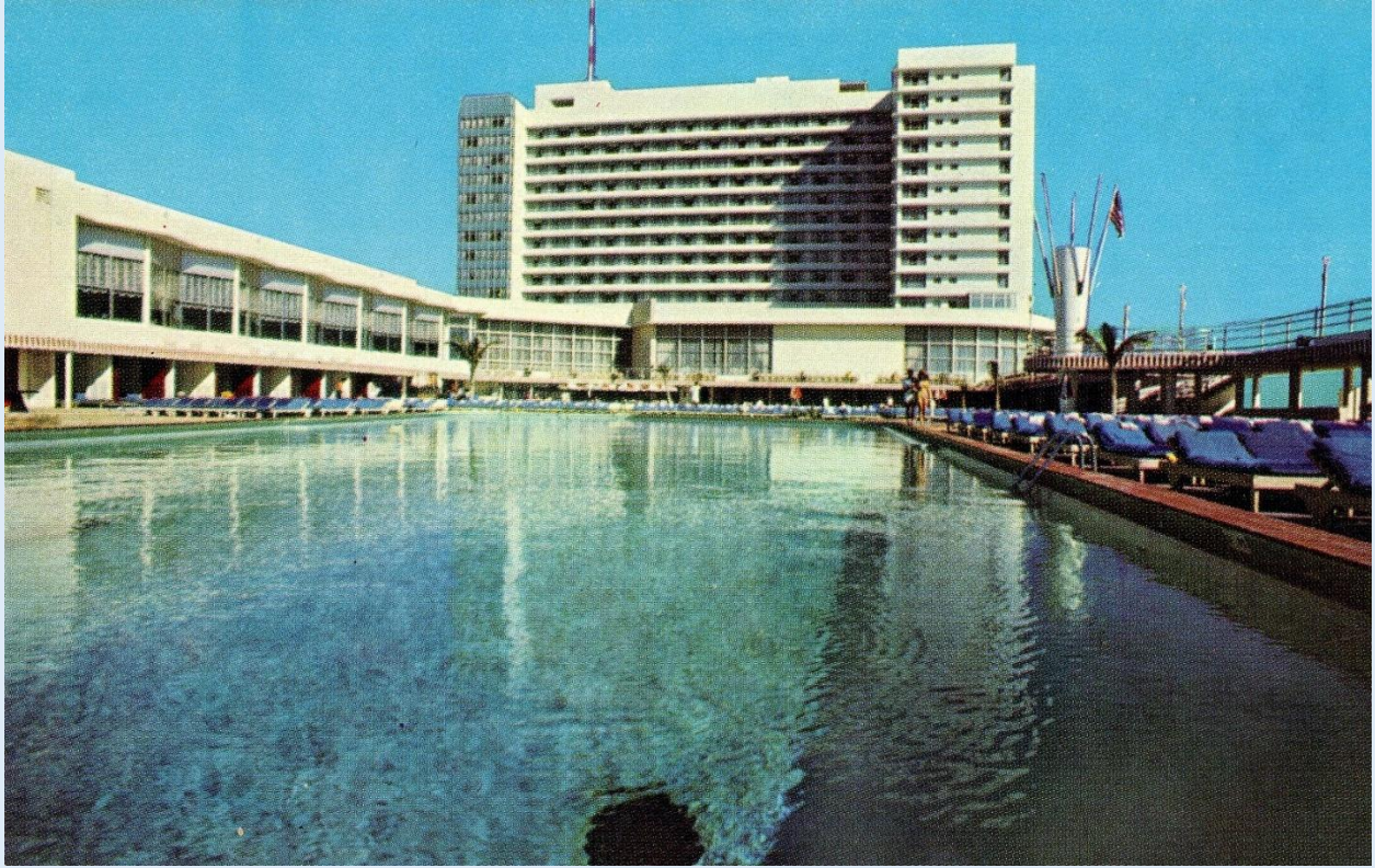
The Deauville Hotel - on the Ocean at 67th Street - Miami Beach, Fla. - ca. 1970s.