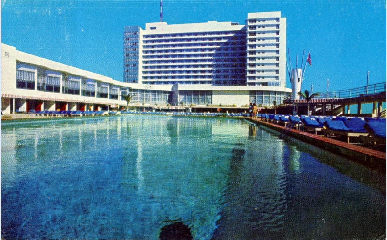
Eauville - Hotel of the Stars - on the Ocean at 67th Street - Miami Beach, Fla. - ca. 1970.