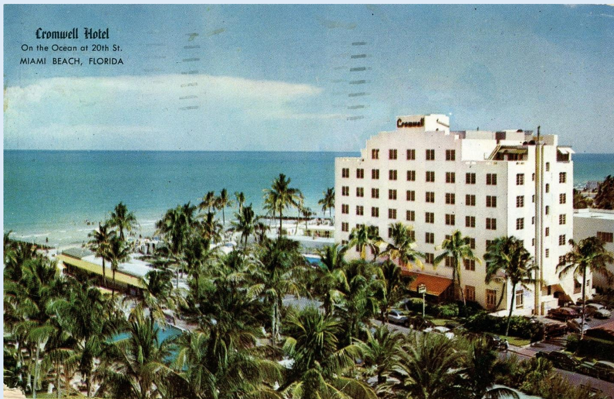
The Cromwell - Private Beach and Pool - Miami Beach, Fla. - ca. 1954.