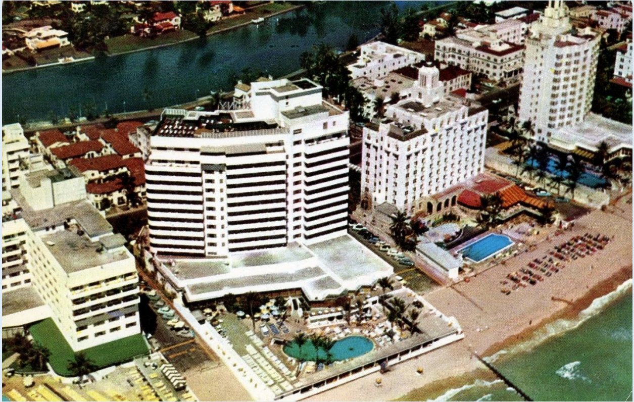
Oceanfront Hotels on the Gold Coast - Miami Beach, Fla. - ca. 1956.