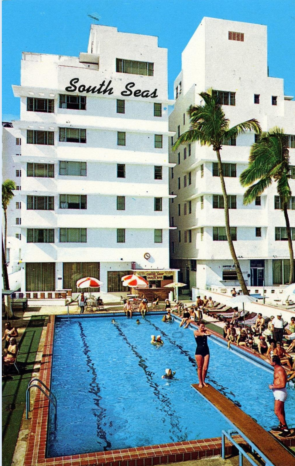
South Seas Hotel - Oceanfront at 18th Street - Miami Beach, Fla. - ca. 1976.