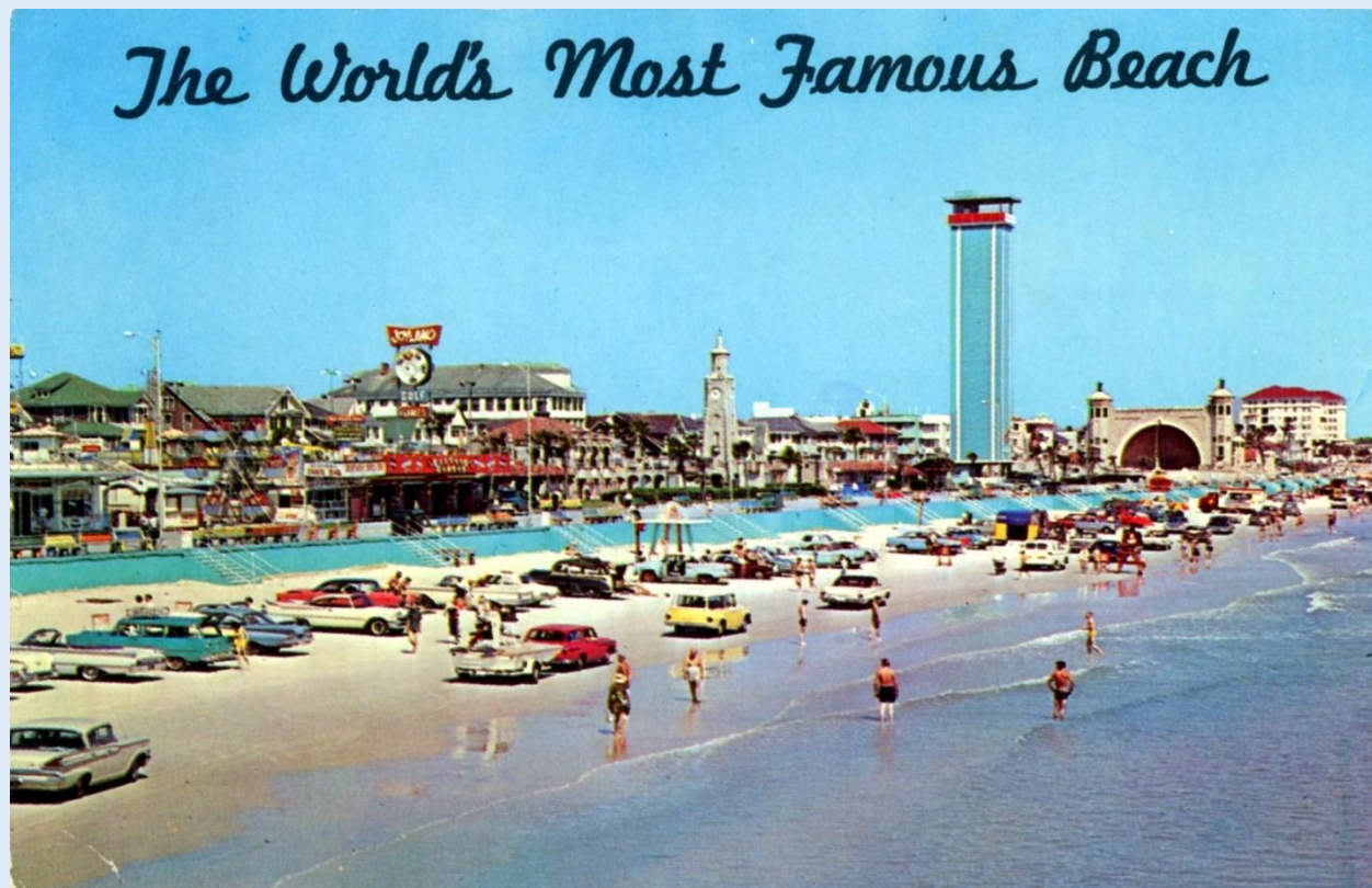
The Observation Tower - The World's Most Famous Beach - Daytona Beach, Fla. - ca. 1974