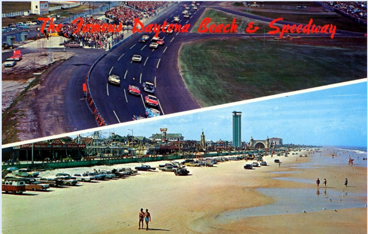
The 500 mile stock car race and Hard Packed Beach - Daytona Beach, Fla. - ca. 1966