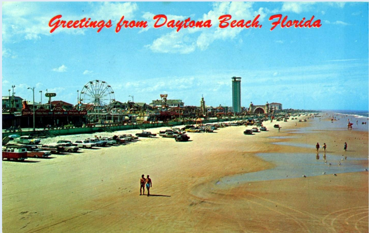
Beautiful Sandy Beach and Famous Florida Resort - Daytona Beach, Fla. - ca. 1967