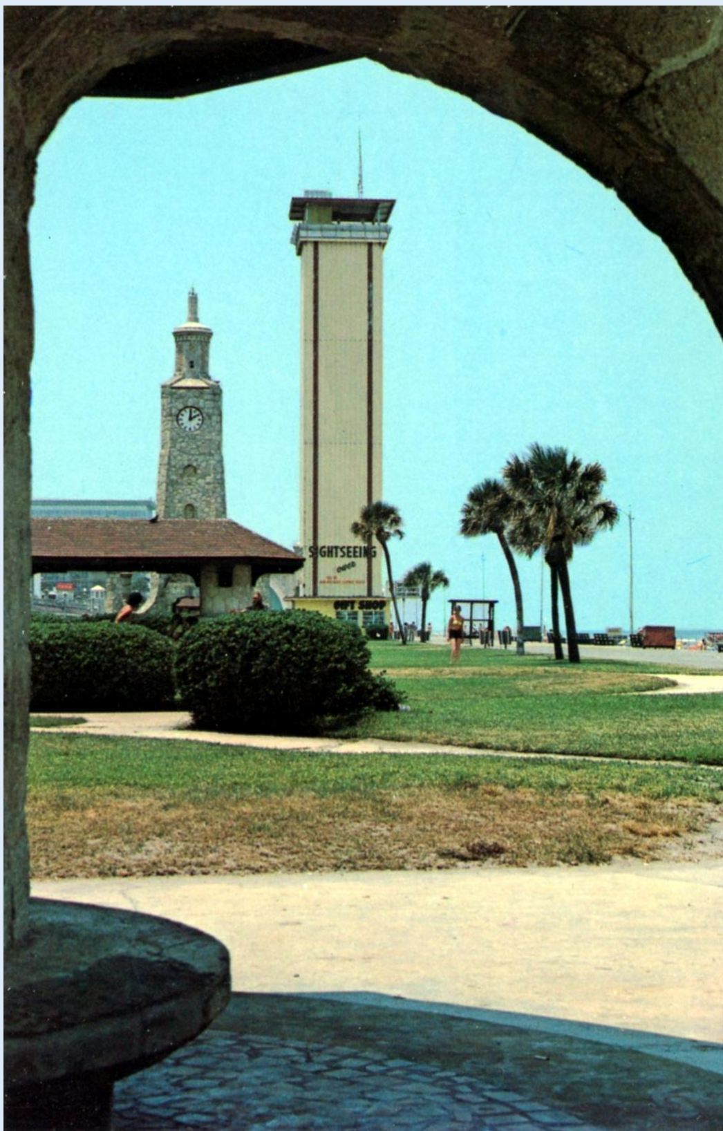
The Observation Tower & Clock Tower in Ocean Front Park - Daytona Beach, Fla. - ca. 1970s