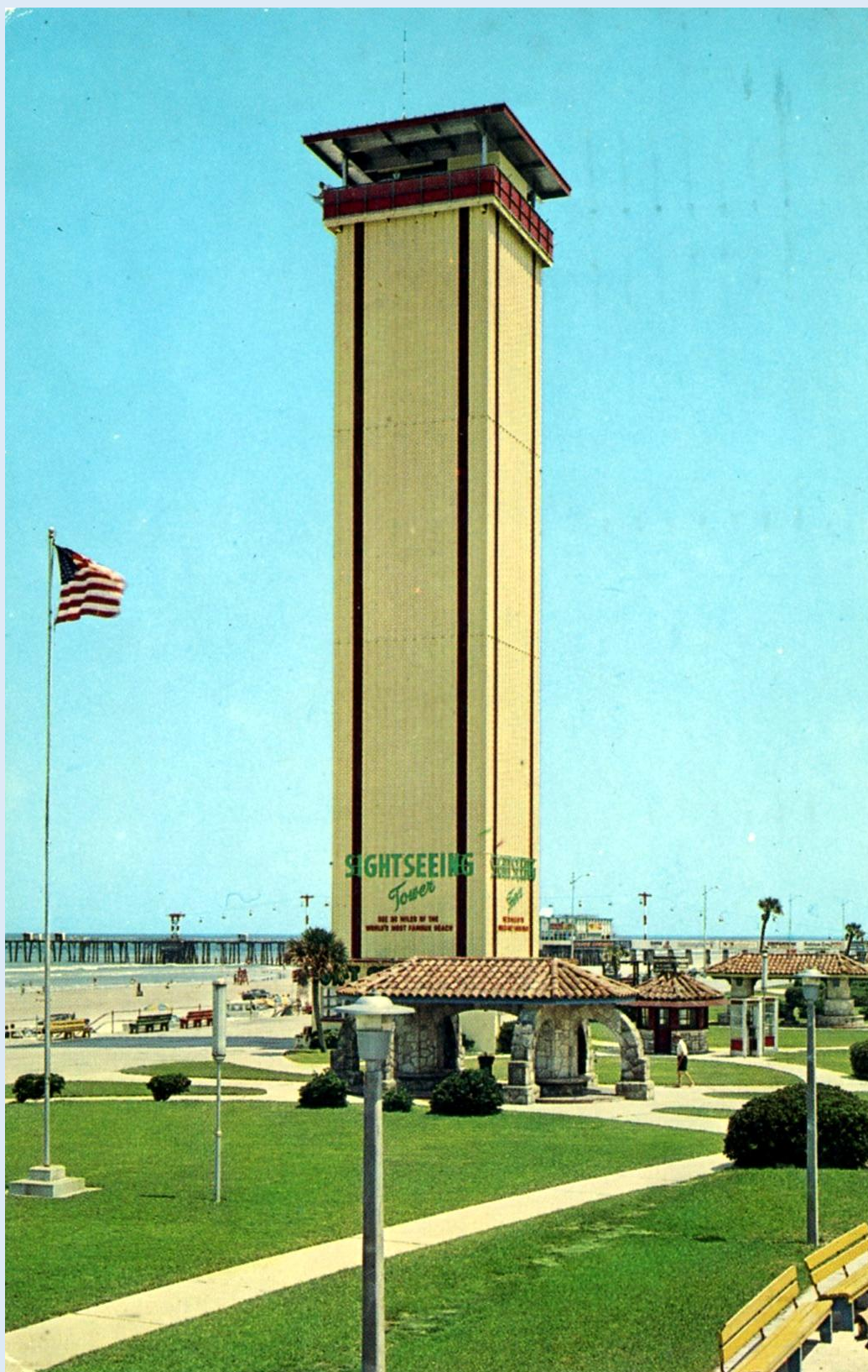
Sightseeing Tower in Ocean Front Park - Daytona Beach, Fla. - ca. 1969