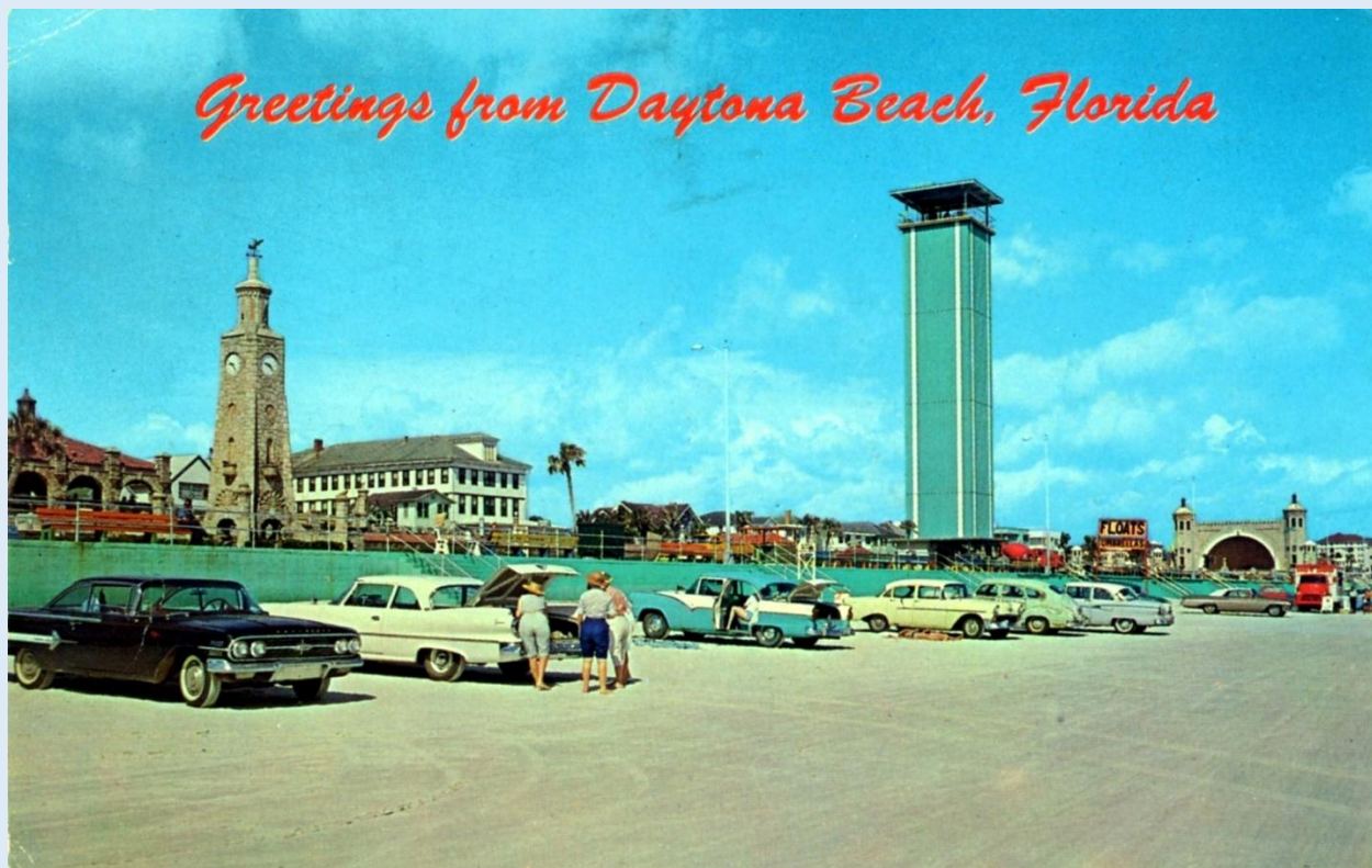
The New Lookout Tower at the World Famous Daytona Beach, Fla. - ca. 1967