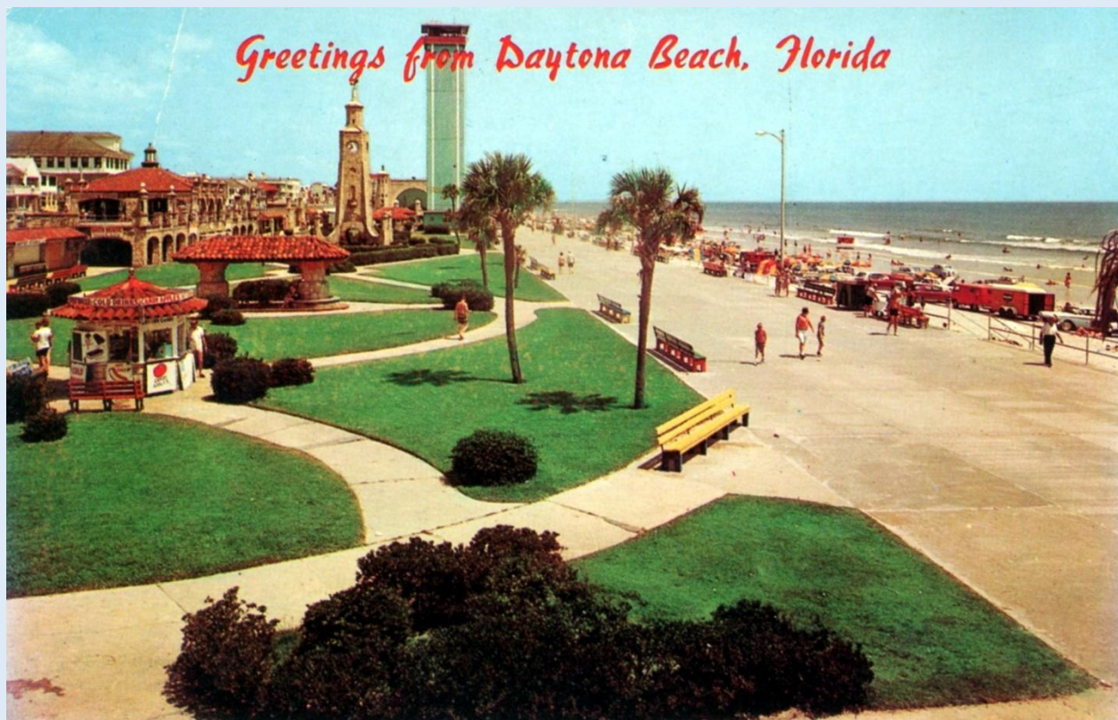
Beautiful Ocean Front Park at the World Famous Daytona Beach, Fla. - ca. 1977