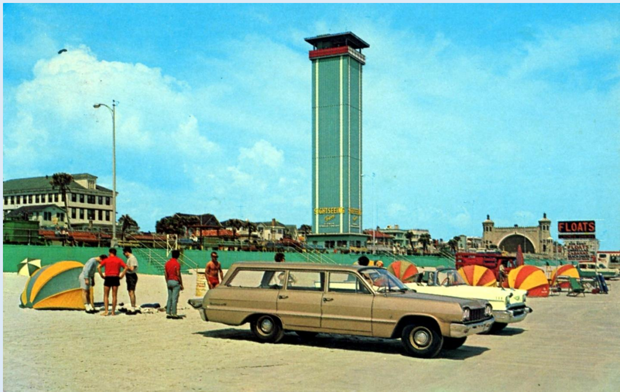
Looking North from the Fishing Pier - Daytona Beach, Fla. - ca. 1968