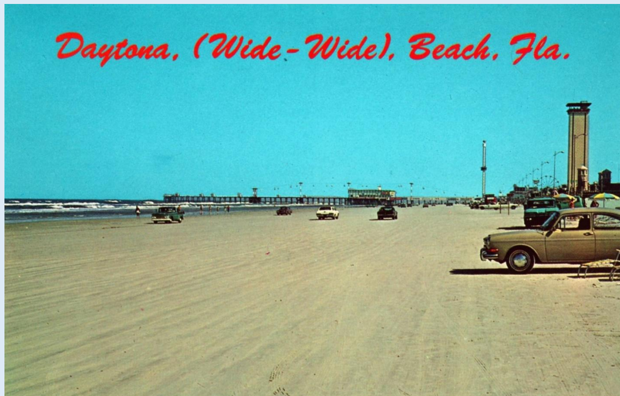
Several Hundred Feet Wide and 20 Miles Long Beach - Daytona Beach, Fla. - ca. 1970s