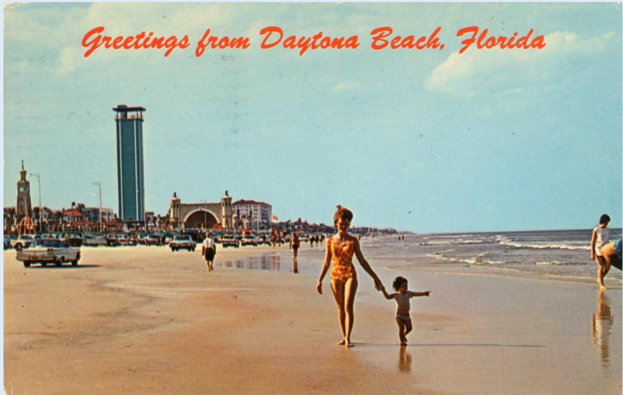
Looking North from the Fishing Pier - Daytona Beach, Fla. - ca. 1968