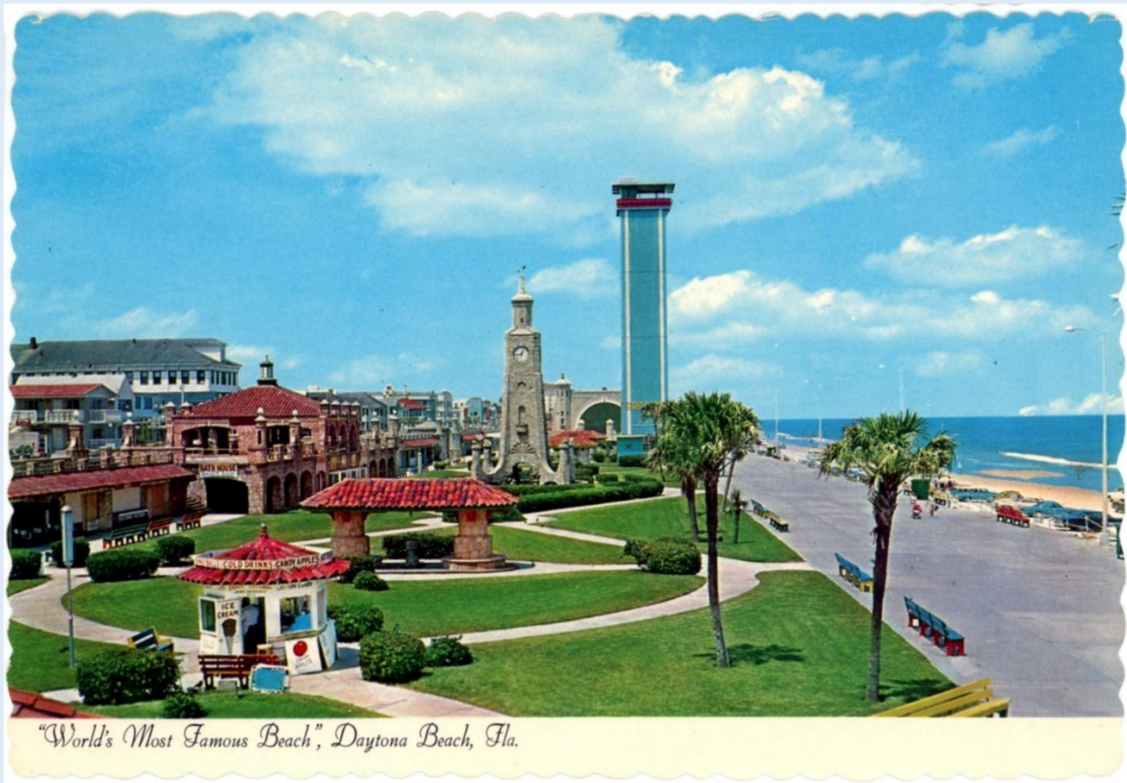
"World's Most Famous Beach," Daytona Beach, Fla.