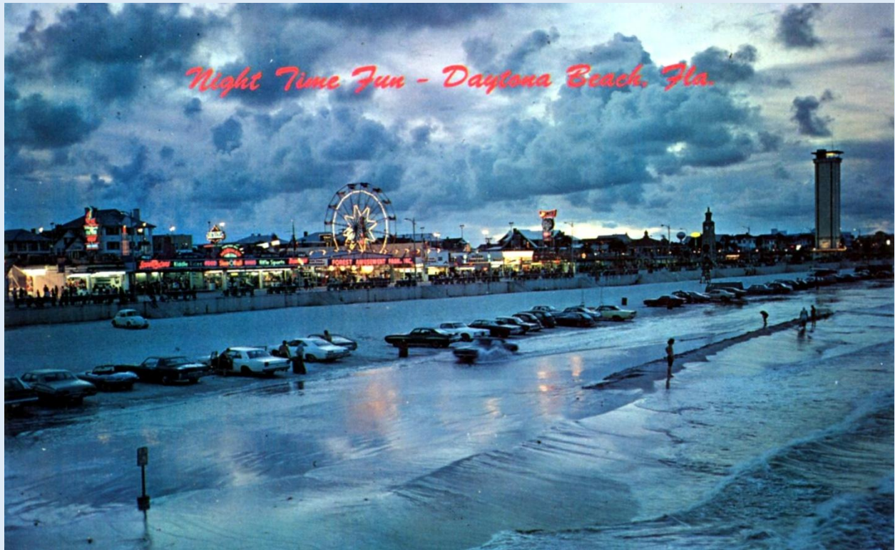
Night Time Fun - Daytona Beach, Fla. - ca. 1970s