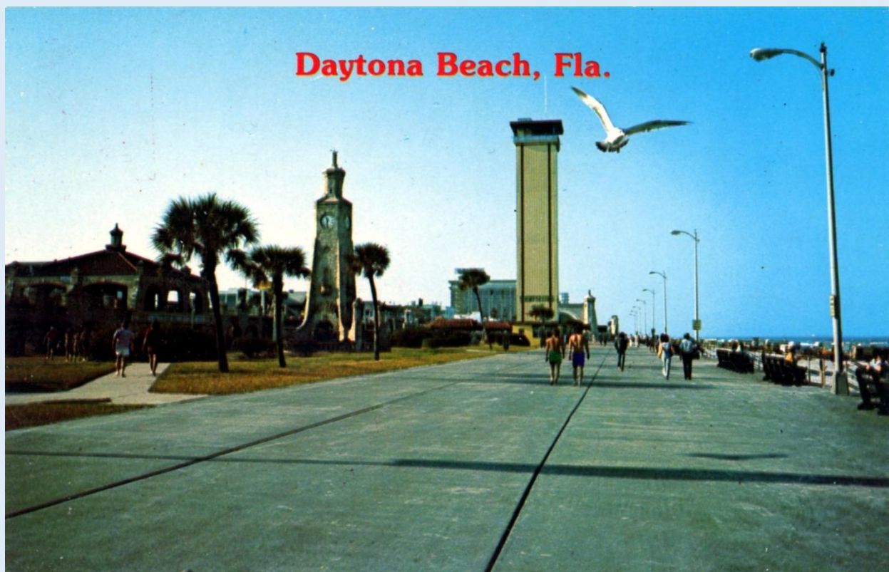
A Seagull flies over the Boardwalk in Oceanfront Park - Daytona Beach, Fla. - ca. 1970s