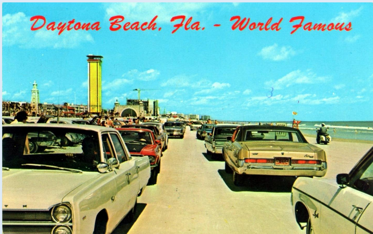
Site of some of the earliest automobile speed records - Sightseeing Tower - World Famous - Daytona Beach, Fla. - ca. 1973