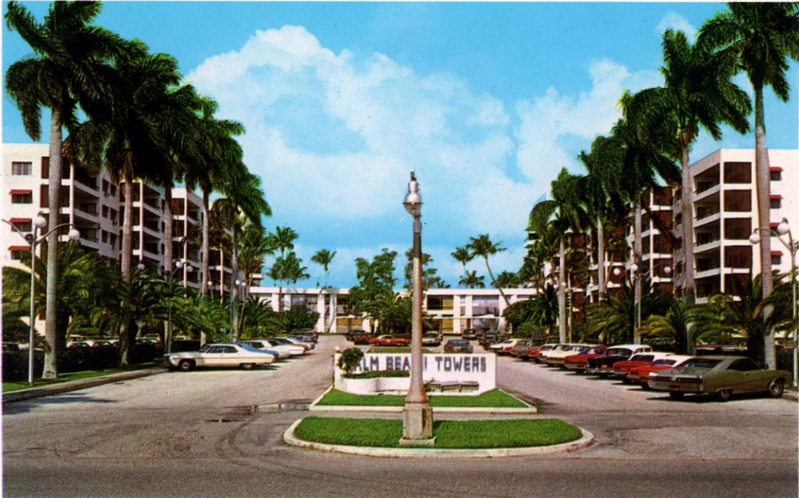
PALM BEACH TOWERS

Palm Beach Towers (The Palm Beaches) - ca. 1970s