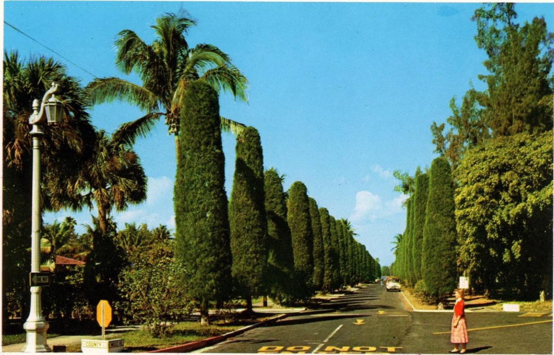
WELLS ROAD, PALM BEACH

Wells Road - Palm Beach (The Palm Beaches) - ca. 1950s