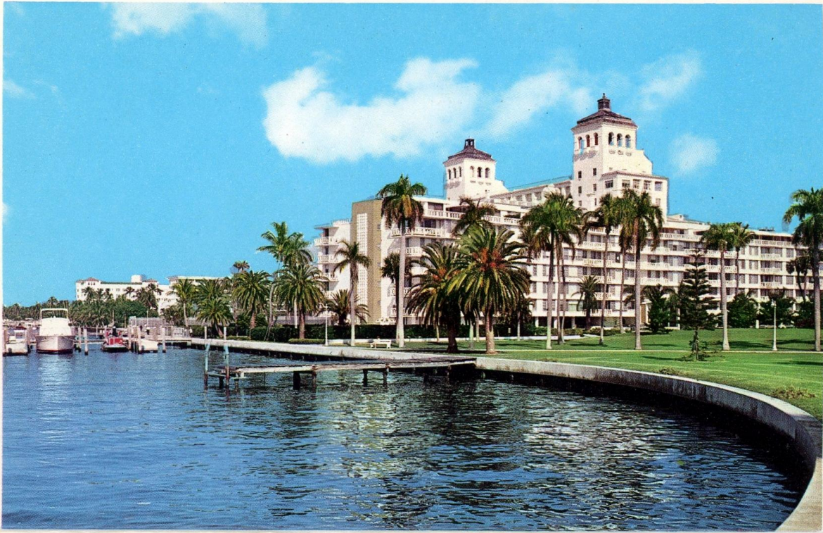
Hotel Row - Palm Beach (The Palm Beaches) - ca. 1970s