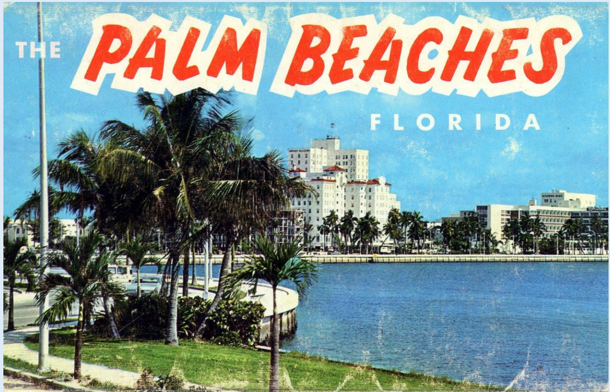
Palm Beaches, Fla. - Cover (The Palm Beaches) - ca. 1970s