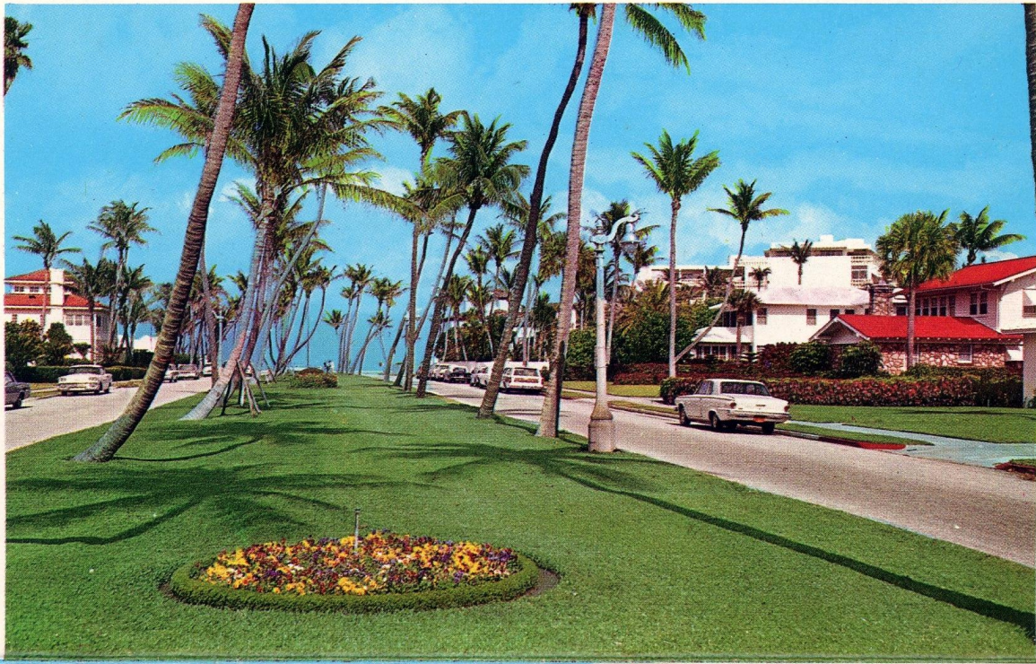
Royal Palm Way - Palm Beach (The Palm Beaches) - ca. 1960s