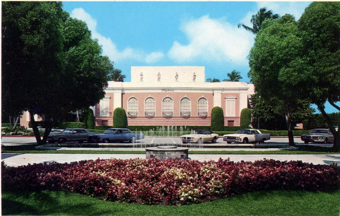
Royal Poinciana Play House - Palm Beach (The Palm Beaches) - ca. 1970s