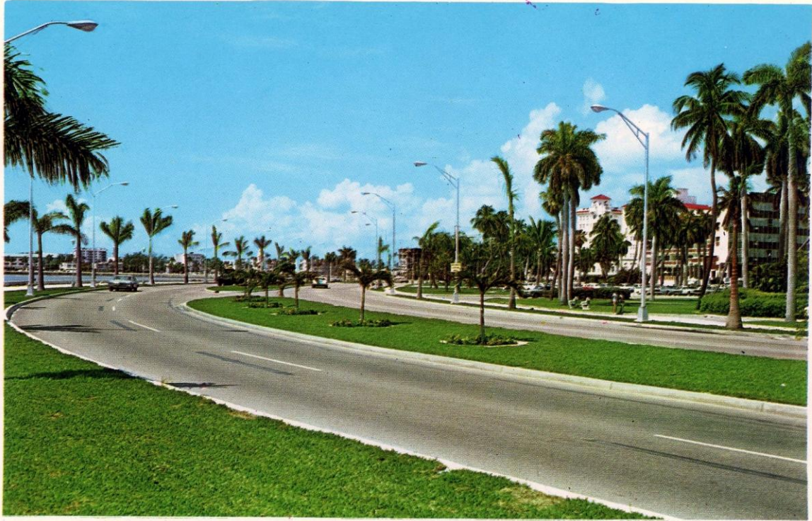
FLAGLER DRIVE — WEST PALM BEACH

Flagler Drive - West Palm Beach (The Palm Beaches) - ca. 1970s