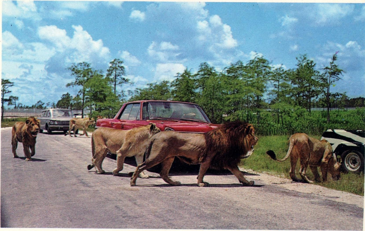
Lion Country Safari - West Palm Beach (The Palm Beaches) - ca. 1970s