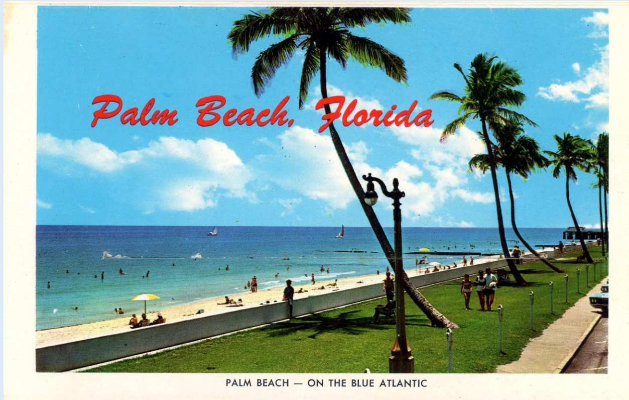
Palm Beach - On The Blue Atlantic (The Palm Beaches) - ca. 1970s