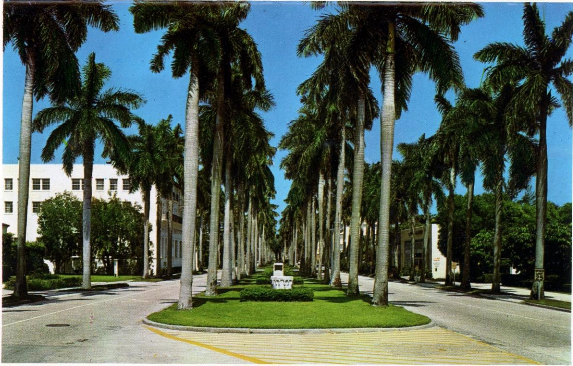
ROYAL PALM WAY — PALM BEACH

Royal Palm Way - Palm Beach (The Palm Beaches) - ca. 1970s