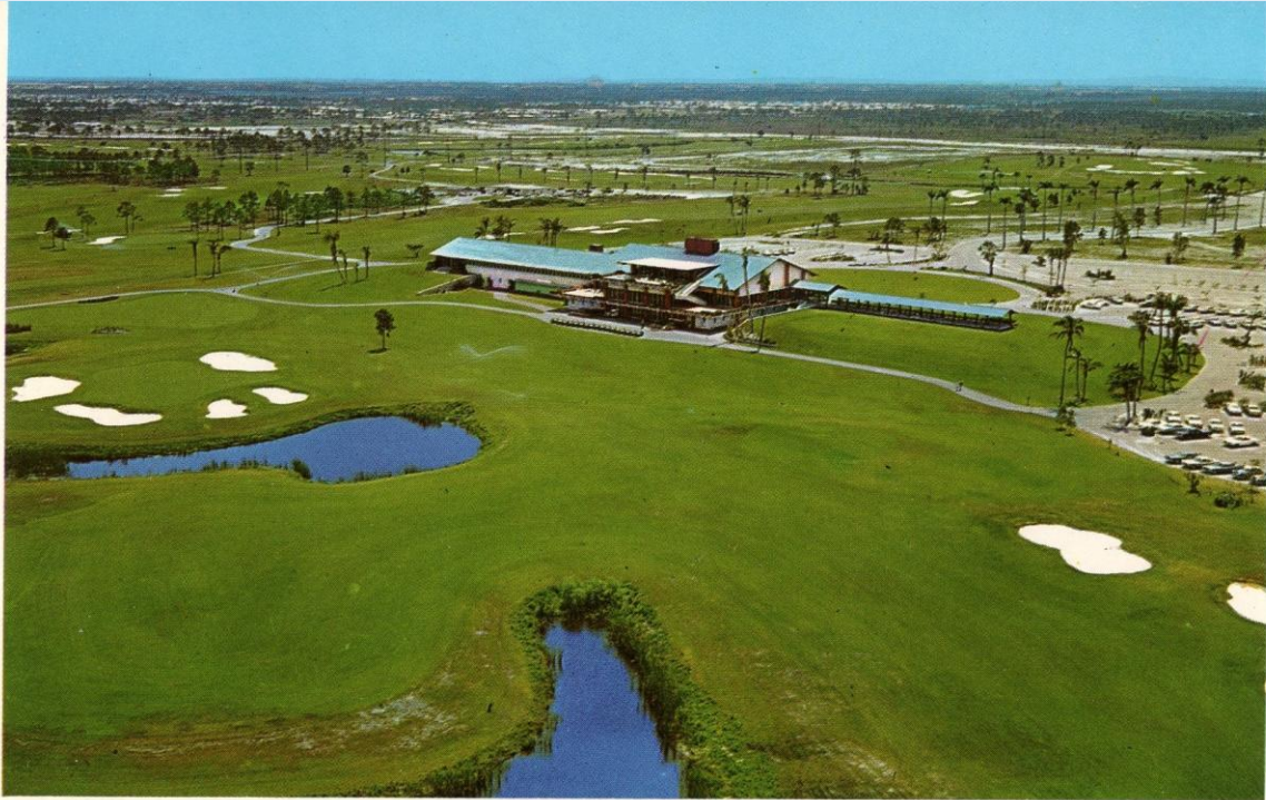
PGA NATIONAL GOLF CLUB, PALM BEACH GARDENS

PGA National Golf Club - Palm Beach Gardens (The Palm Beaches) - ca. 1970s