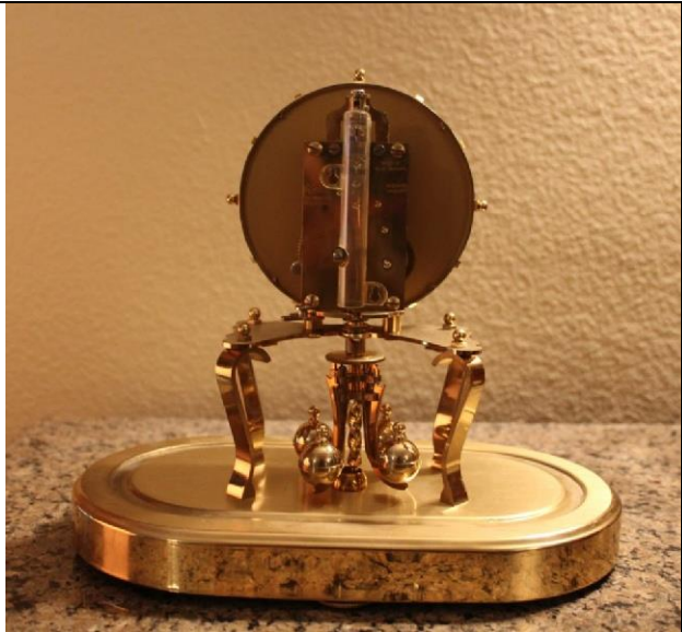
WNS-CLK-133 - Kundo - Oval 400 day clock - Full Back View