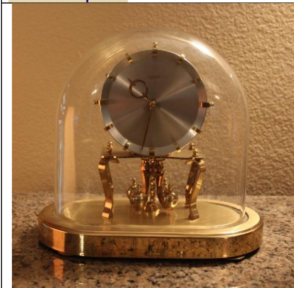
WNS-CLK-133 - Kundo - Oval 400 day clock - Full Front View