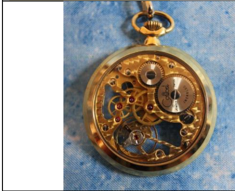
WNS-PW-6015 - Colibri - Swiss - 17J - Skeleton - Full Back View