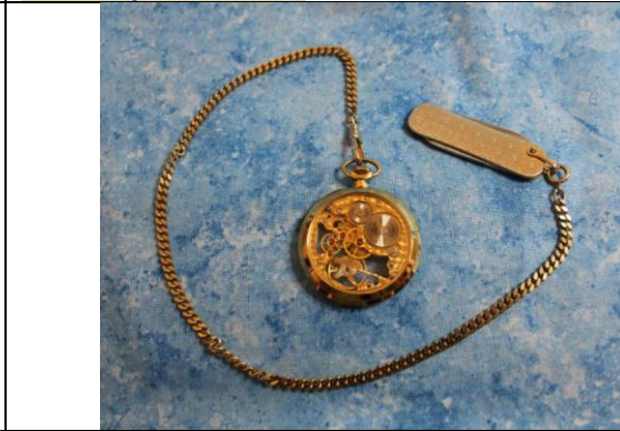
WNS-PW-6015 - Colibri - Swiss - 17J - Skeleton - Full View with Chain