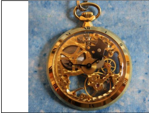
WNS-PW-6015 - Colibri - Swiss - 17J - Skeleton - Full Front View