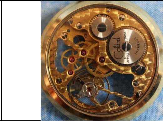
WNS-PW-6015 - Colibri - Swiss - 17J - Skeleton - Close Up Back View