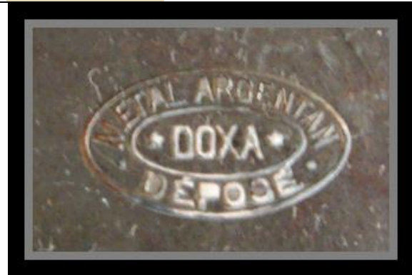
WNS-PW-6009 - Doxa Huge Pocket Watch - Case Markings View