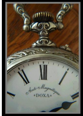
WNS-PW-6009 - Doxa Huge Pocket Watch - Dial Close Up View