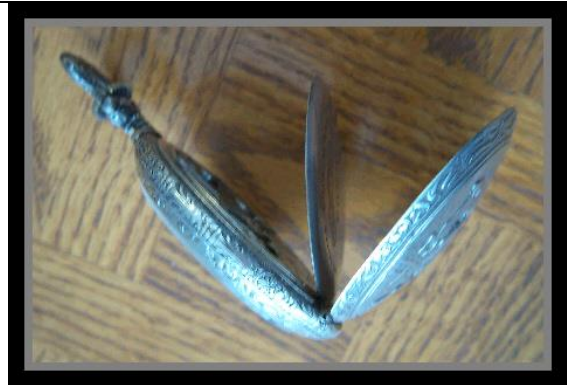
WNS-PW-6009 - Doxa Huge Pocket Watch - Open Case View