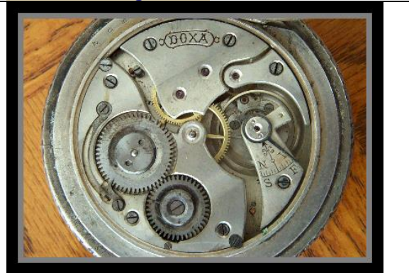
WNS-PW-6009 - Doxa Huge Pocket Watch - Movement View