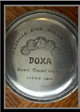
WNS-PW-6009 - Doxa Huge Pocket Watch - Dust Cover Markings View