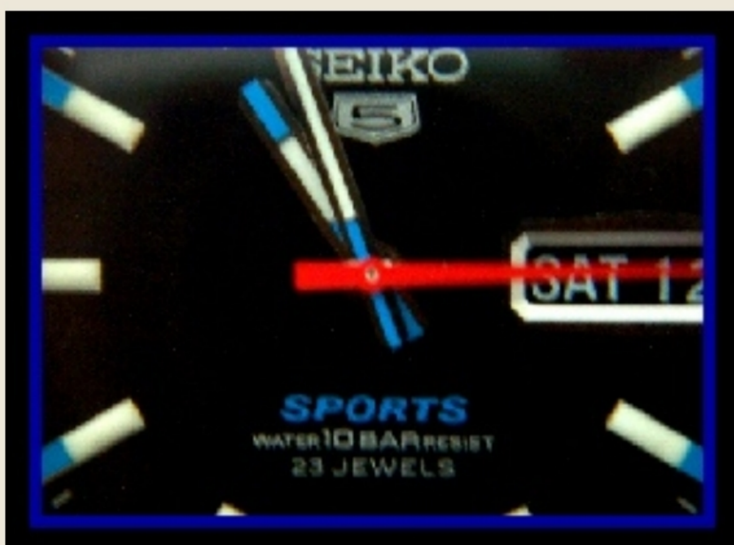
WNS-MDN-5028 - Seiko - Sports 5 Square Dial - 7S36-0120 - Dial Close Up View no 2