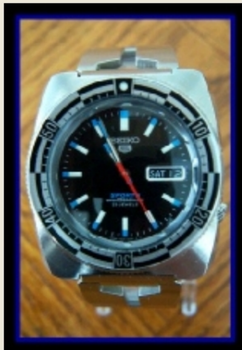
WNS-MDN-5028 - Seiko - Sports 5 Square Dial - 7S36-0120 - Dial Close Up View