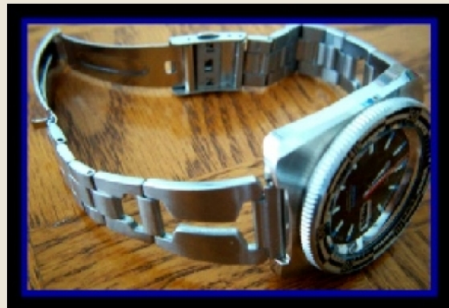
WNS-MDN-5028 - Seiko - Sports 5 Square Dial - 7S36-0120 - Left Side View with Bracelet