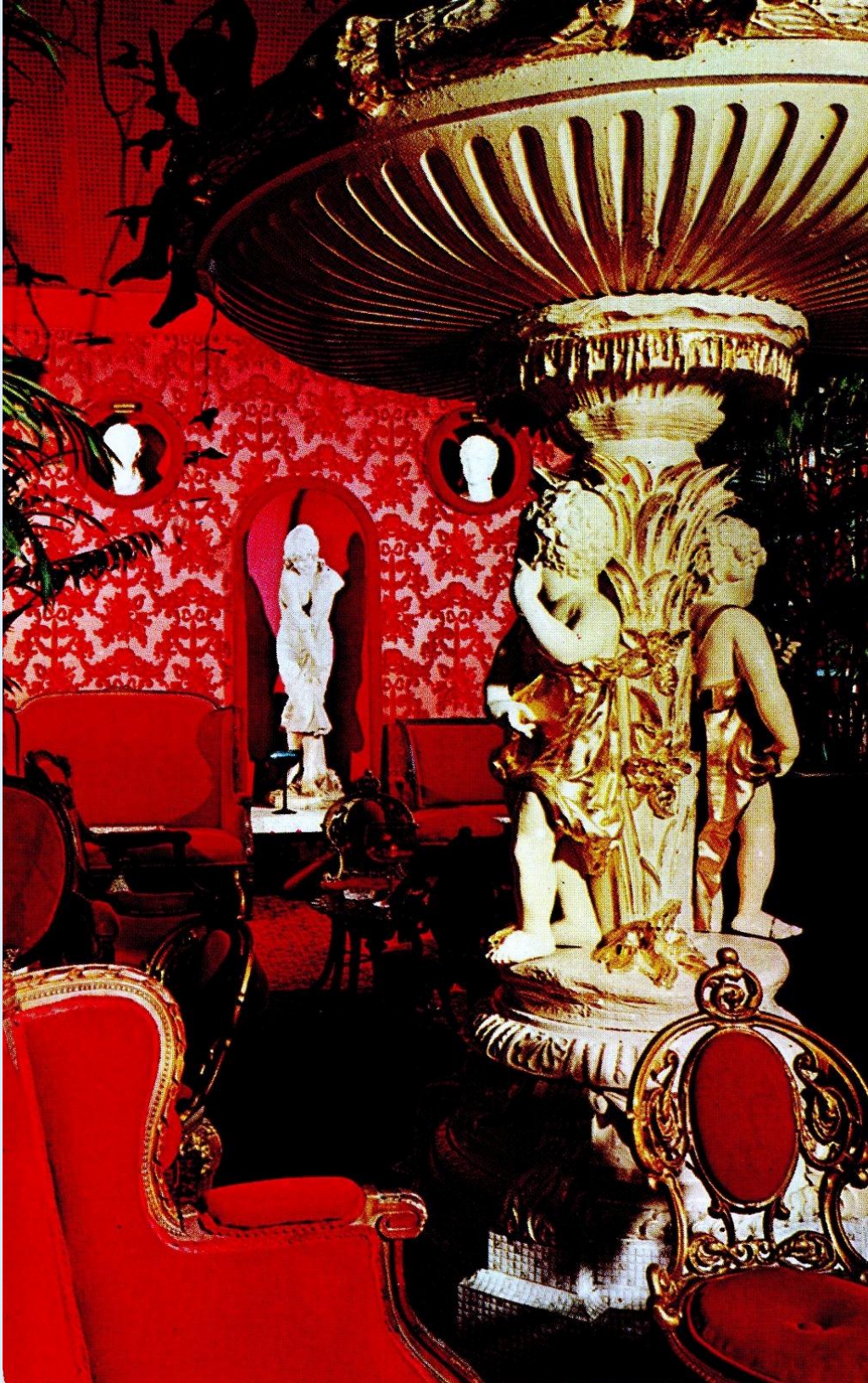
The Kapok Tree Inn - Red Velvet Lounge - Clearwater, Fla. - ca. 1970s