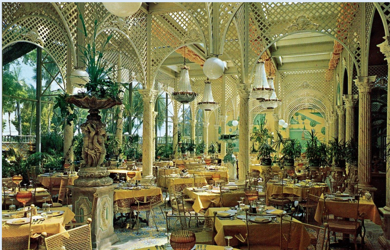
Baumgardner's - The Dining Room - N. Haines Rd. - Clearwater, Fla. - ca. 1970s