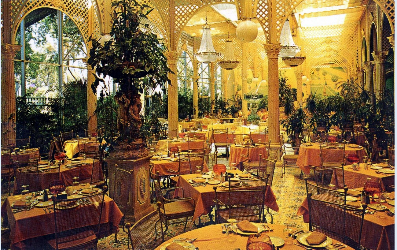
Baumgardner's - N. Haines Rd. - Clearwater, Fla. - ca. 1972