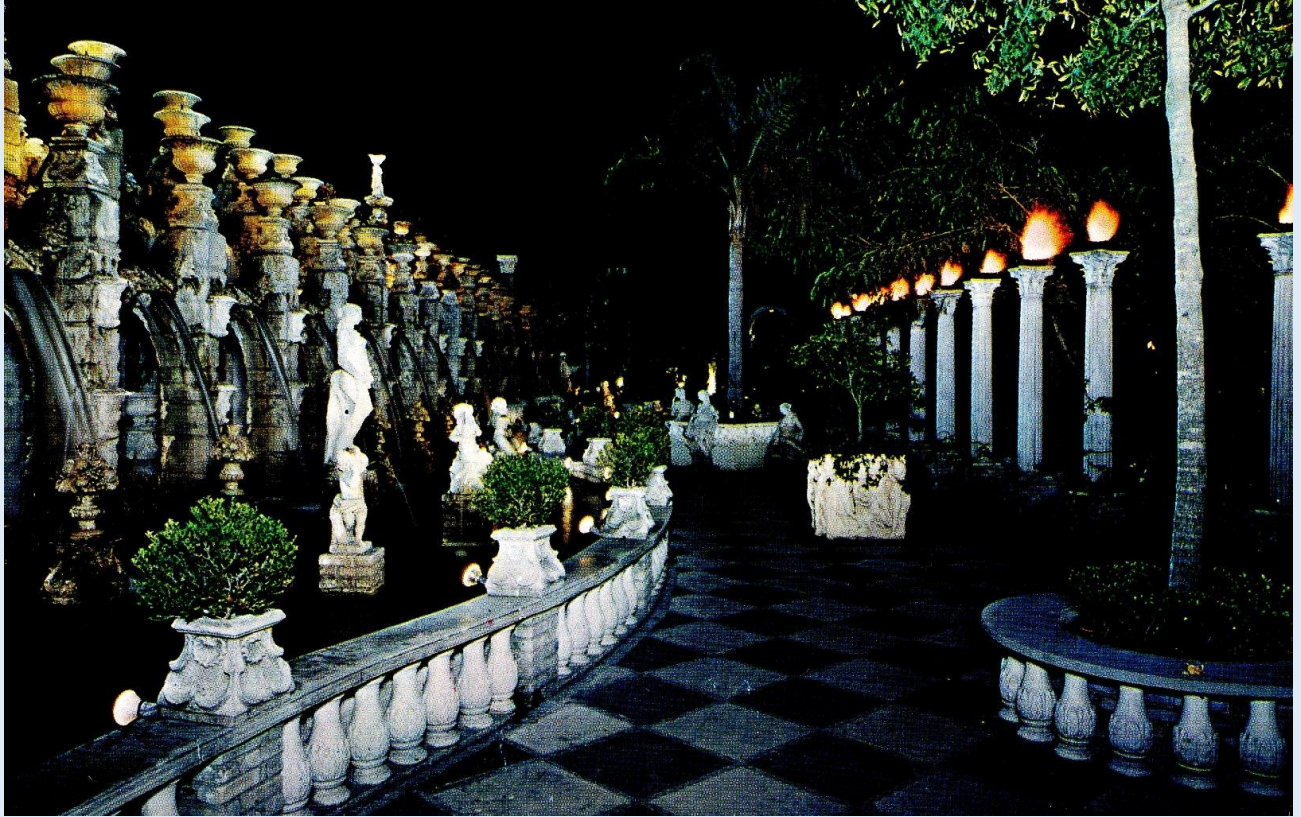
The Kapok Tree Inn - Night Scene at the North Garden - Clearwater, Fla. - ca. 1960s