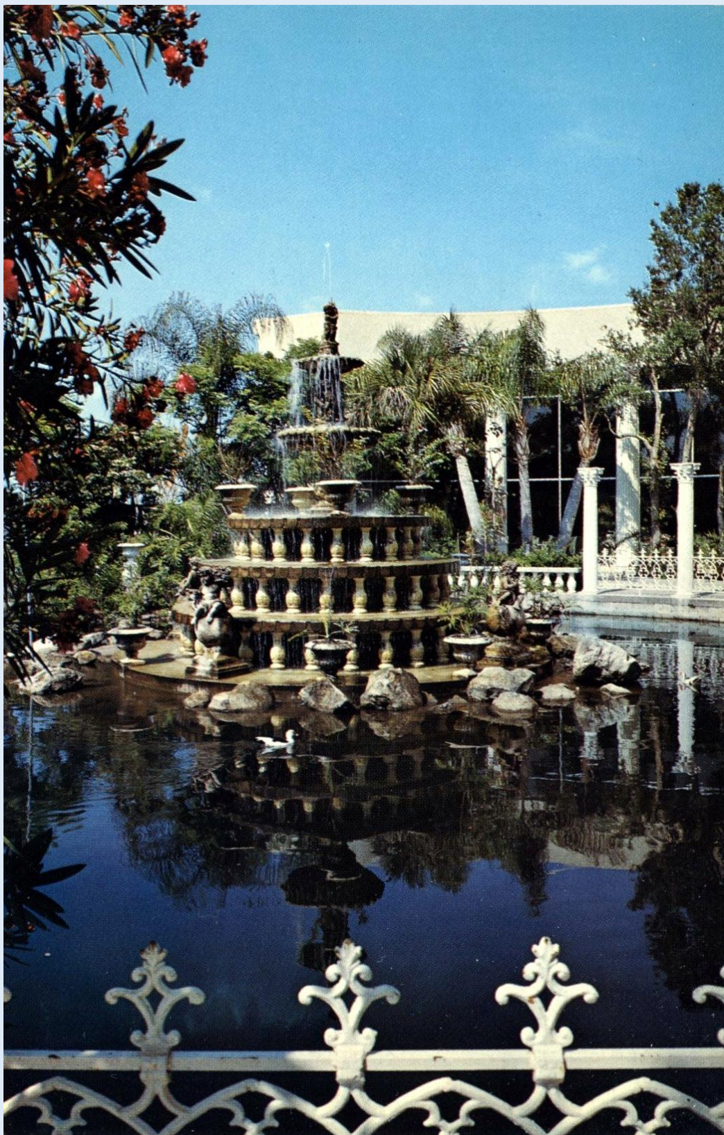
The Kapok Tree Inn - Beautiful Fountain inspired by 15th Century Renaissance Europe - Clearwater, Fla. - ca. 1960s