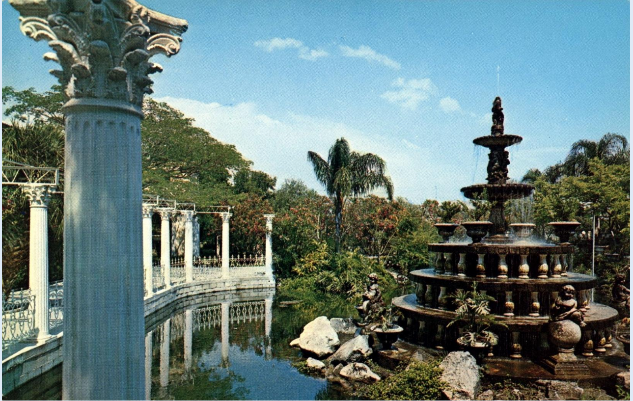
The Kapok Tree Inn - South Pool and Fountain - North Haines Road - Clearwater, Fla. - ca. 1960s