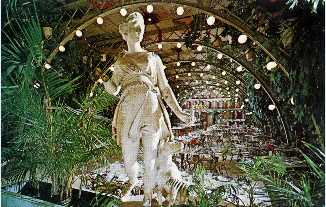
The Kapok Tree Inn - The Florida Room - North Haines Road - Clearwater, Fla. - ca. 1960s - Copy