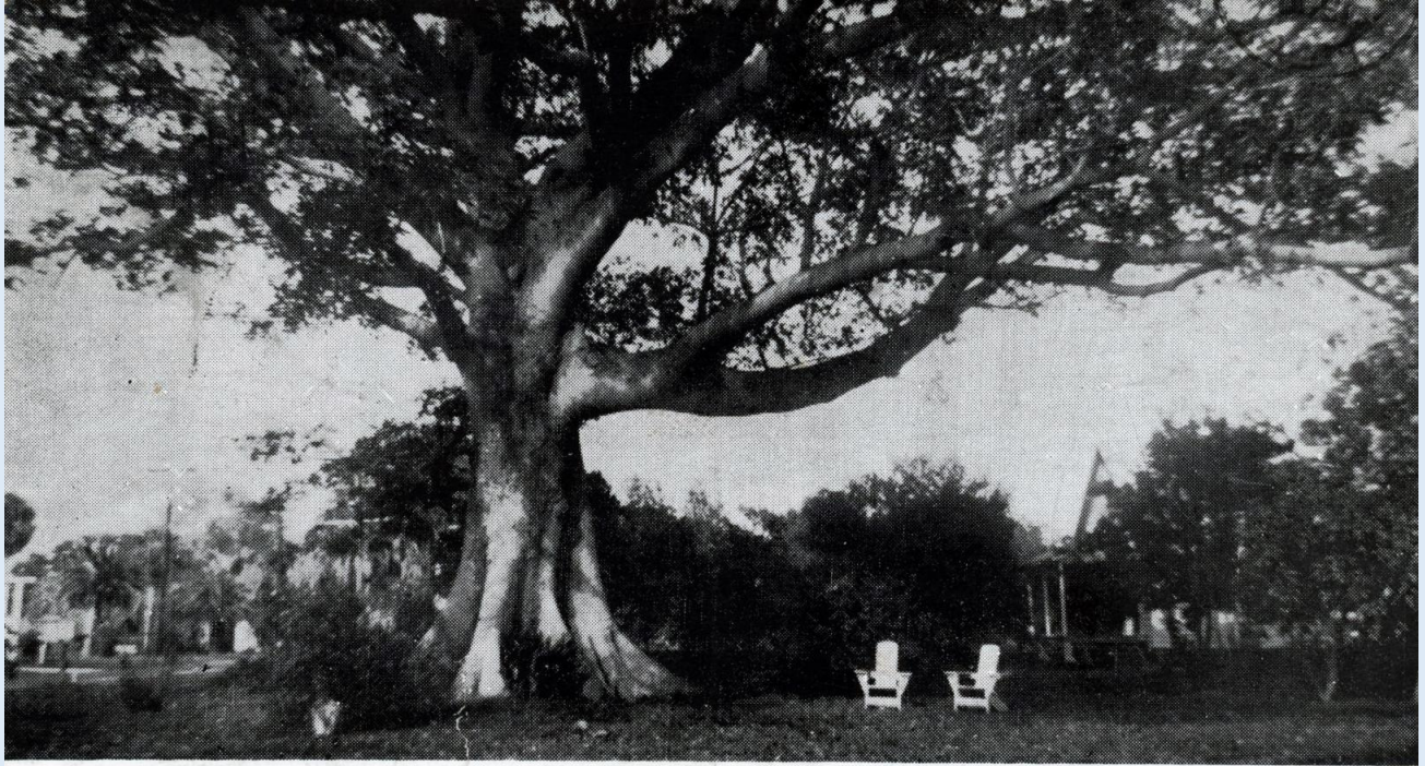
The Famous Kapok Tree at the Kapok Tree Grove, North Haines Road, Clearwater, Fla.

The Famous Kapok Tree at the Kapok Tree Grove, North Haines Road - Clearwater, Fla. - ca. 1940s