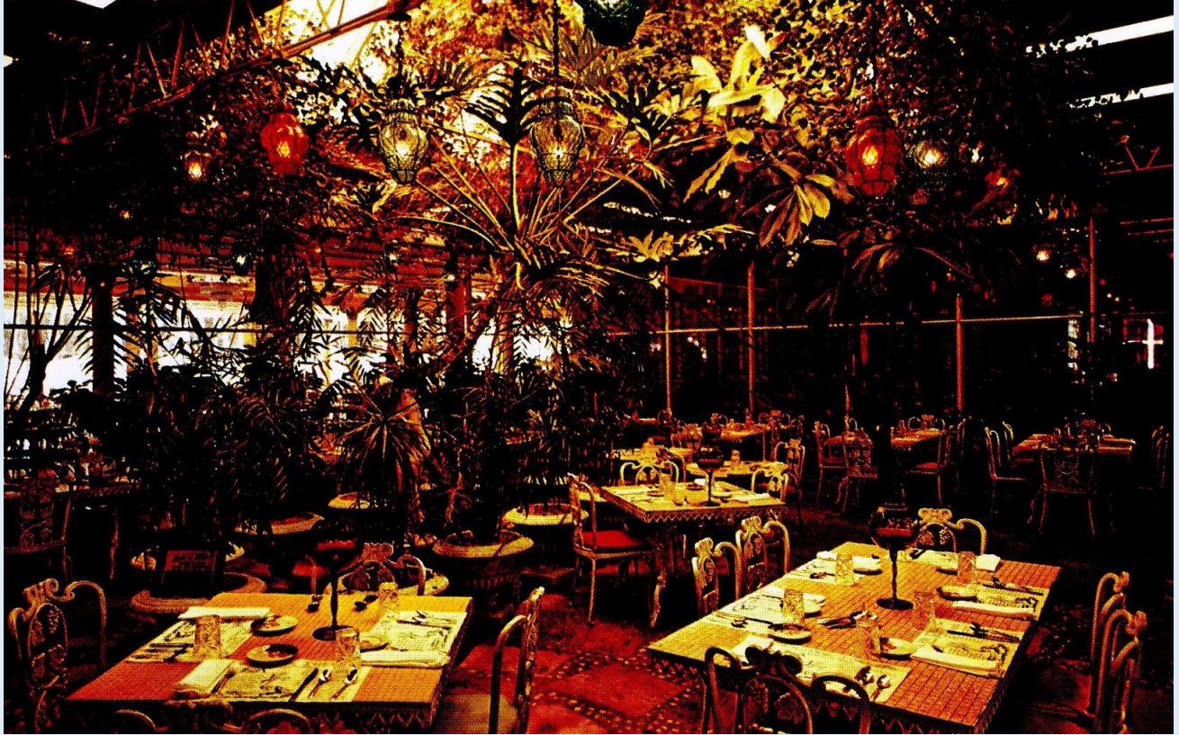
The Kapok Tree Inn - Patio in a Tropical Indoor Garden - Clearwater, Fla. - ca. 1960s