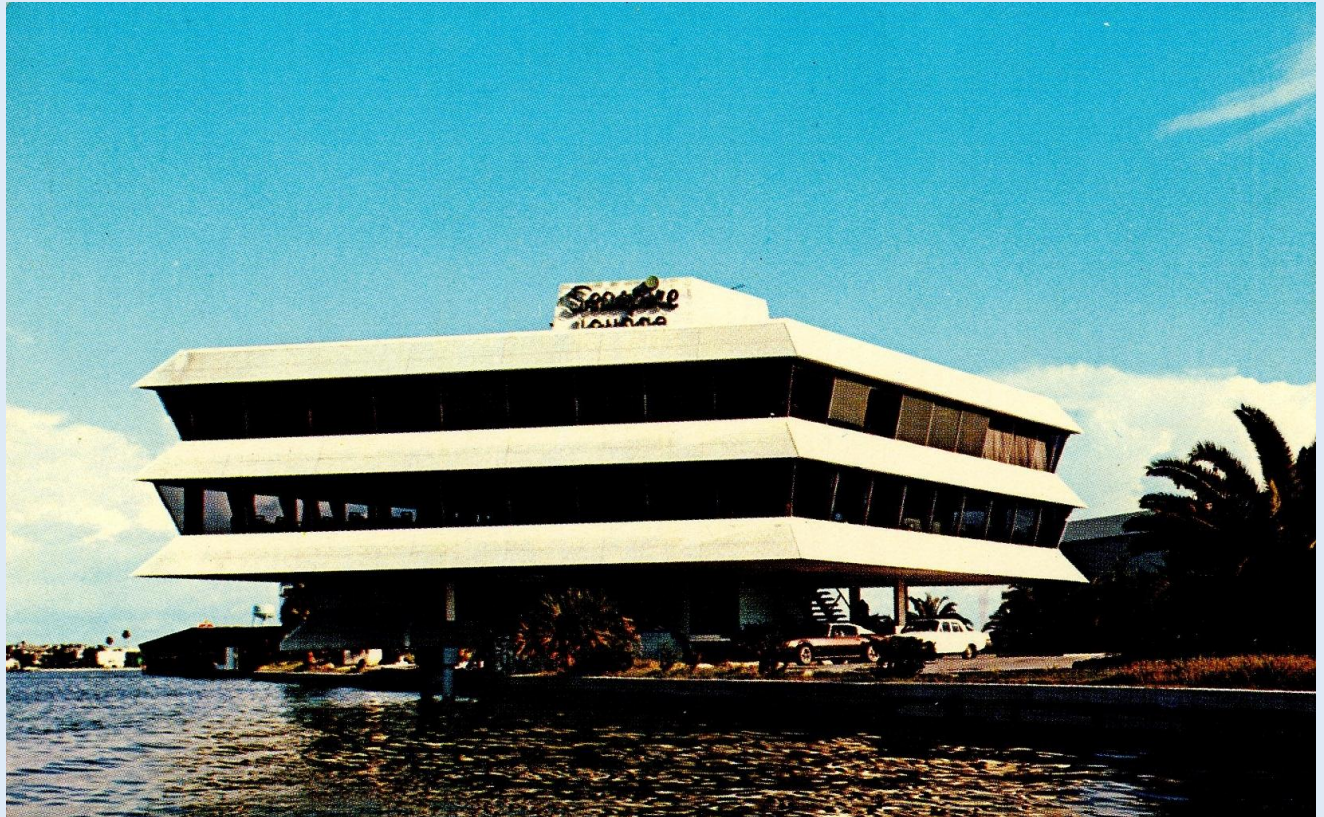
Seaspire - Restaurant and Upstairs Lounge - Clearwater, Fla. - ca. 1970s