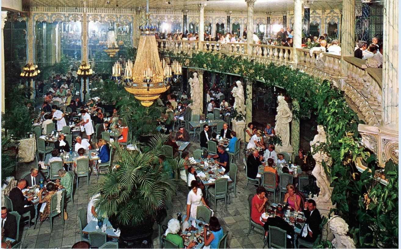
The Kapok Tree Inn - The Grand Ballroom - Clearwater, Fla. - ca. 1960s