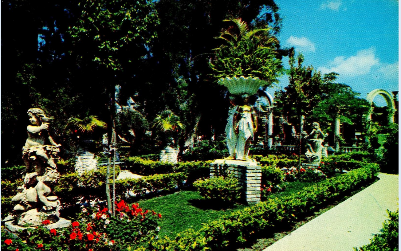
The East Garden at Kapok Tree Inn - Clearwater, Fla. - ca. 1960s