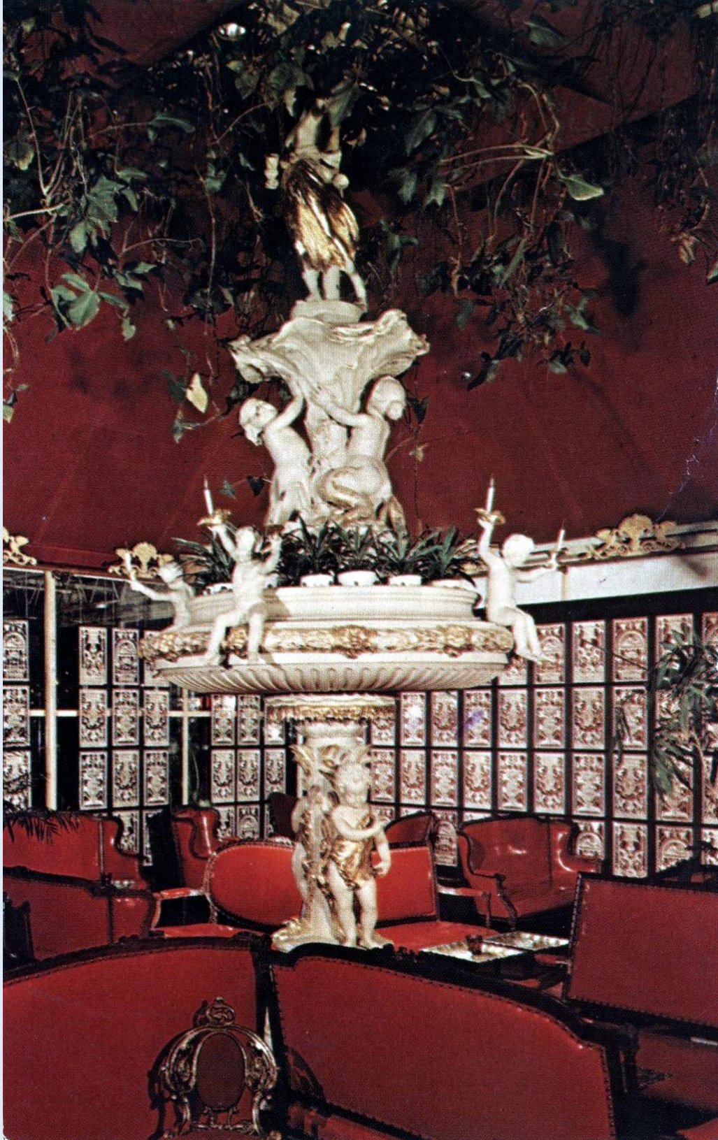
The Kapok Tree Inn - the Red Lounge featuring red love seats - Clearwater, Fla. - ca. 1960s - Copy