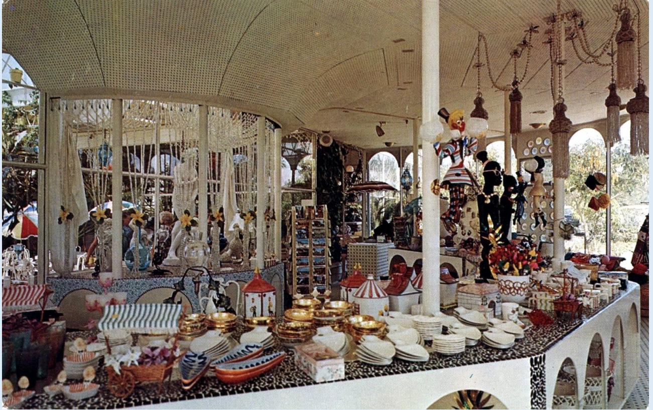
The Kapok Tree Inn - Gift Shop - North Haines Road - Clearwater, Fla. - ca. 1960s