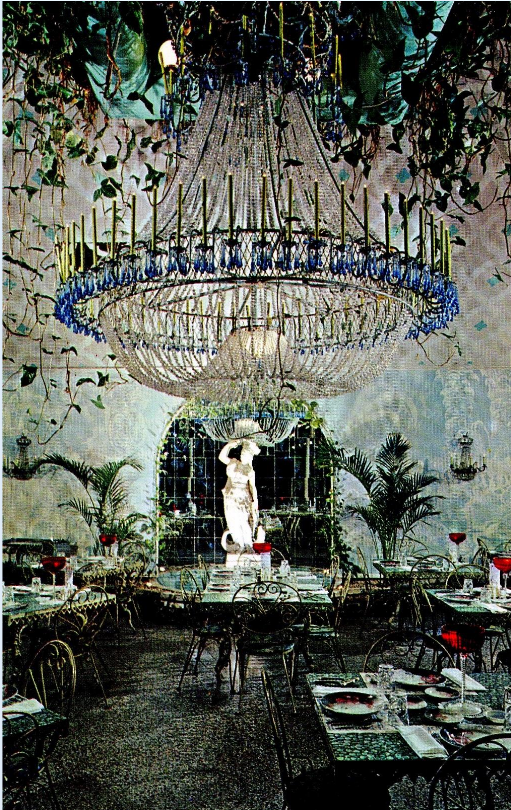
The Kapok Tree Inn - North Haines Road - Clearwater, Fla. - ca. 1960s