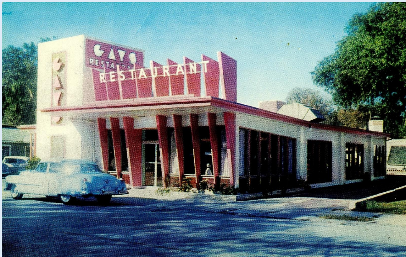
Gay's Restaurant - 1310 N. Ft. Harrison Ave., Clearwater, Fla. - ca. 1950s