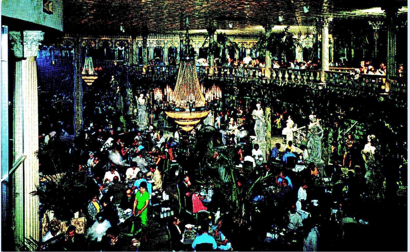
The Kapok Tree Inn - Partial view of the Grand Ballroom - Clearwater, Fla. - ca. 1979