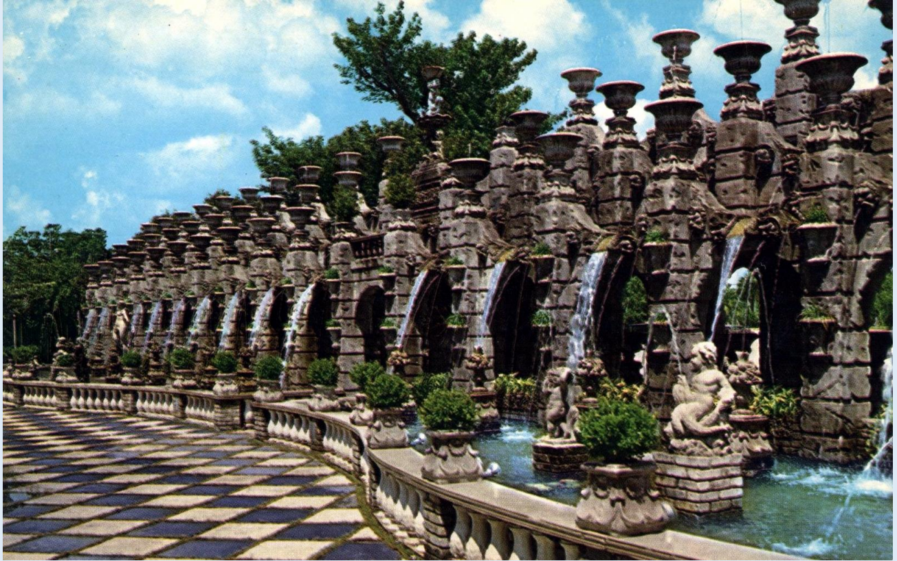
The Kapok Tree Inn - Exotic Italian Gardens - North Haines Road - Clearwater, Fla. - ca. 1960s