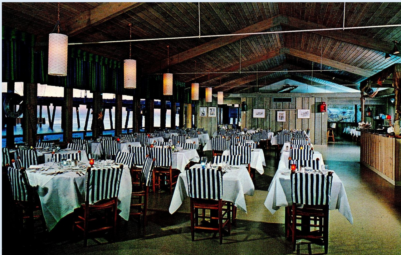
Fisherman's Wharf - Florida's Finest Seafood Restaurant - Clearwater Beach, Fla. - ca. 1960s