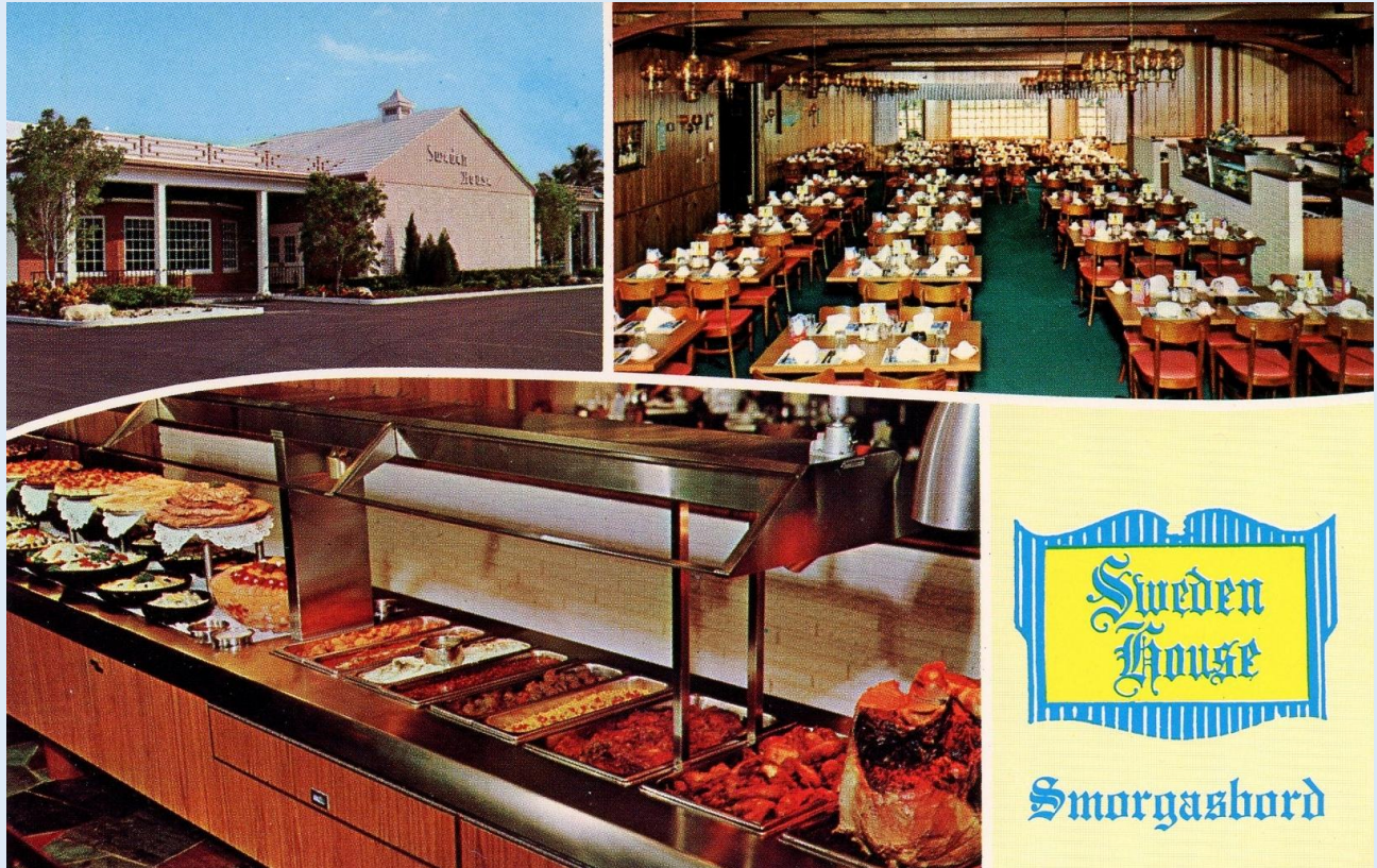
Sweden House - Smorgasbord - Rt. 60 - Clearwater, Fla. - ca. 1970s