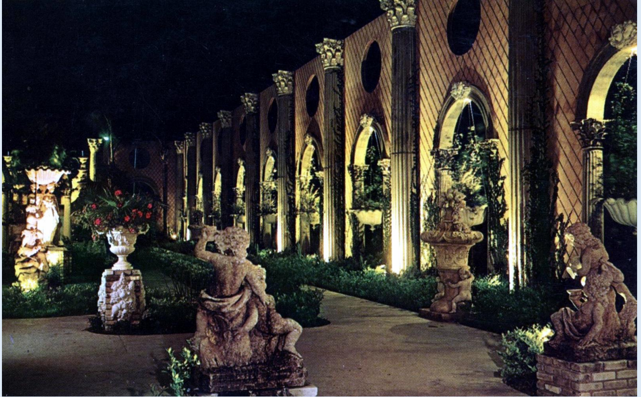
The Kapok Tree Inn - Garden Wall - North Haines Road - Clearwater, Fla. - ca. 1960s