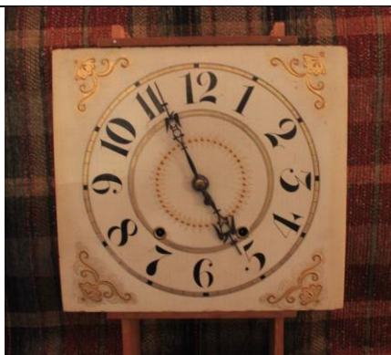
WNS-CLK-118 - American Clock Co. - Tiger Maple Scroll and Pillar - Dial view