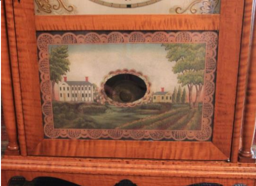
WNS-CLK-118 - American Clock Co. - Tiger Maple Scroll and Pillar - Painted Glass view