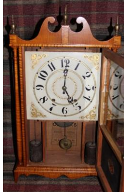
WNS-CLK-118 - American Clock Co. - Tiger Maple Scroll and Pillar - Front Door Open view