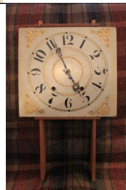
WNS-CLK-118 - American Clock Co. - Tiger Maple Scroll and Pillar - Dial view_no_2