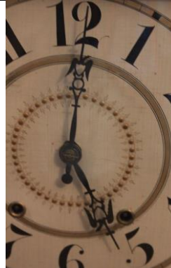
WNS-CLK-118 - American Clock Co. - Tiger Maple Scroll and Pillar - Hands view