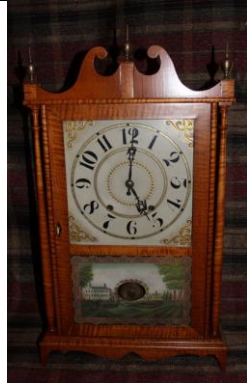
WNS-CLK-118 - American Clock Co. - Tiger Maple Scroll and Pillar - Full Front view_no_2