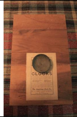
WNS-CLK-118 - American Clock Co. - Tiger Maple Scroll and Pillar - Back Panel with Bell and Paper view