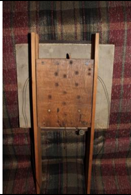
WNS-CLK-118 - American Clock Co. - Tiger Maple Scroll and Pillar - Back of Wood Movement view