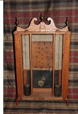
WNS-CLK-118 - American Clock Co. - Tiger Maple Scroll and Pillar - Rear without Back Cover view