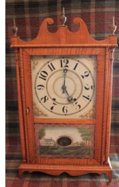
WNS-CLK-118 - American Clock Co. - Tiger Maple Scroll and Pillar - Full Front view