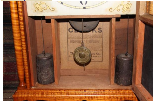
WNS-CLK-118 - American Clock Co. - Tiger Maple Scroll and Pillar - Bottom Front with weights view