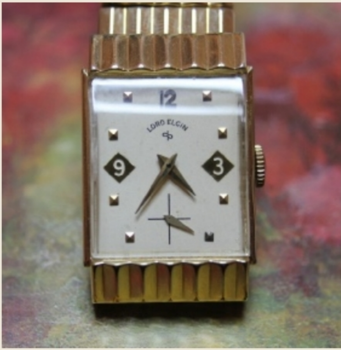
WNS-MCTY-3034 - Lord Elgin - 14K GF - Large Tank - Dial Close Up View