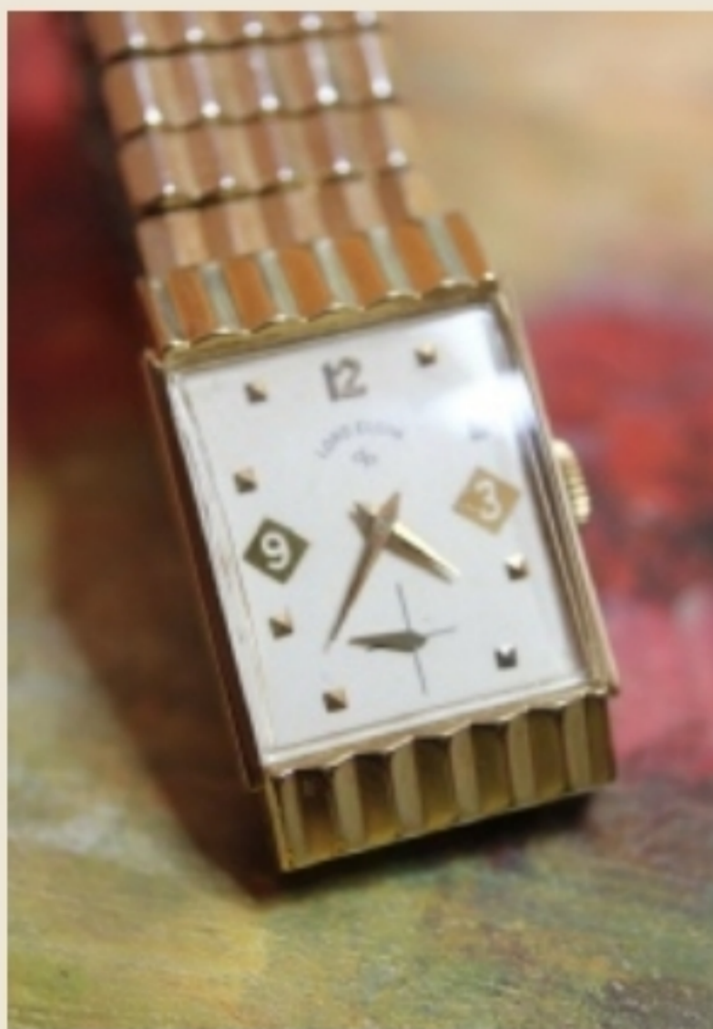
WNS-MCTY-3034 - Lord Elgin - 14K GF - Large Tank - Full Left Front View