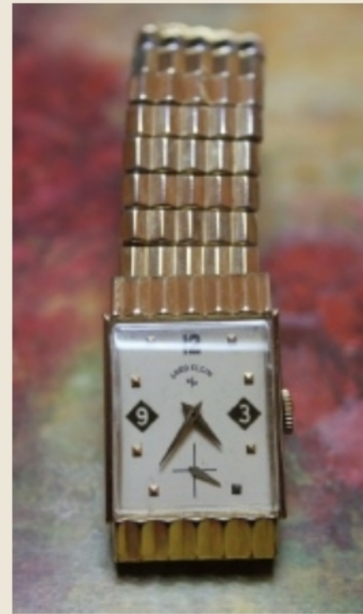
WNS-MCTY-3034 - Lord Elgin - 14K GF - Large Tank - Full Front View